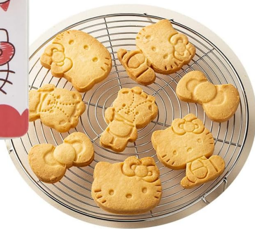
Image: The Skater Sanrio Hello Kitty Cookie Mold and Bread Cutter Set packaging, showing the four different cutters and press molds, alongside a display of freshly baked Hello Kitty cookies on a cooling rack.