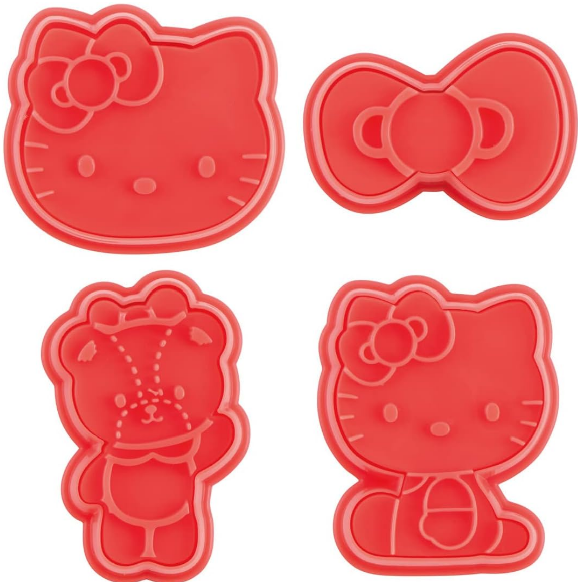
Image: A top-down view of the four red plastic cookie cutters and their matching press molds, featuring Hello Kitty's