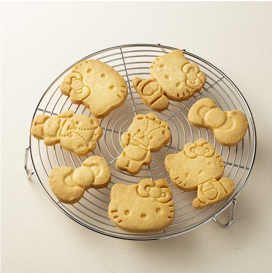
Image: A collection of freshly baked Hello Kitty shaped cookies, each with distinct imprinted details, arranged on a wire cooling rack.