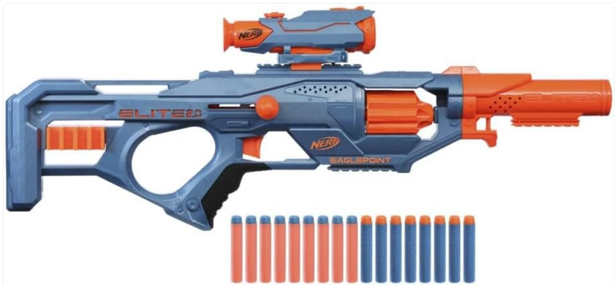
Image: The Nerf Elite 2.0 Eaglepoint RD-8 Blaster, showcasing its main body, detachable scope, and barrel, alongside 16 Nerf Elite darts.

The Hasbro Nerf Elite 2.0 Eaglepoint RD-8 Water Blaster is designed for outdoor fun, featuring a 16-dart capacity and customizable components. It is suitable for ages 8 and up, offering versatile play options with its detachable scope and barrel.