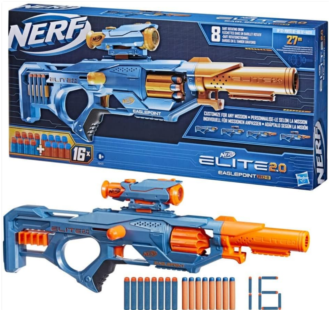
Image: The Nerf Elite 2.0 Eaglepoint RD-8 Blaster with its detachable scope attached, demonstrating its customizable nature.

Align the detachable scope with the tactical rail on top of the blaster. Slide it onto the rail until it clicks securely into place. The scope can be removed by pressing the release button and sliding it off.