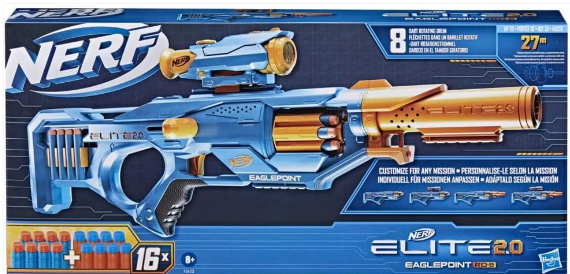
Image: The Nerf Elite 2.0 Eaglepoint RD-8 Blaster with its detachable barrel attached, showing the full assembly.

Twist the detachable barrel onto the front of the blaster until it is firmly attached. The barrel can be removed by twisting it counter-clockwise and pulling it off.