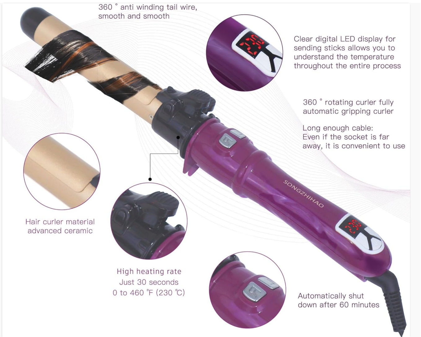
Figure 2: Product Features Diagram. This diagram highlights various features of the curling iron, such as its advanced ceramic material, automatic shutdown, rapid heating capability, 360-degree rotating curler, clear digital LED display, and long power cable.