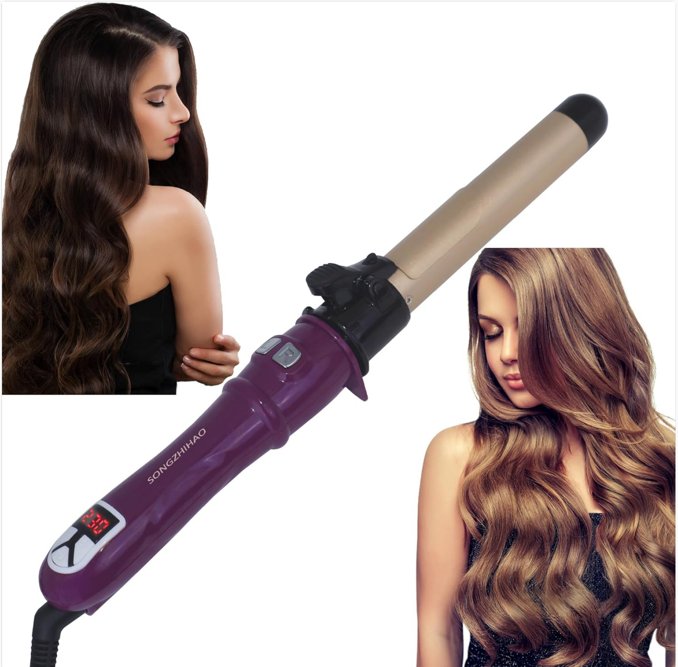
Figure 1: SONGZHIHAO Automatic Curling Iron. This image displays the purple automatic curling iron with its barrel and control buttons, alongside a woman with styled wavy hair, illustrating the product's purpose.