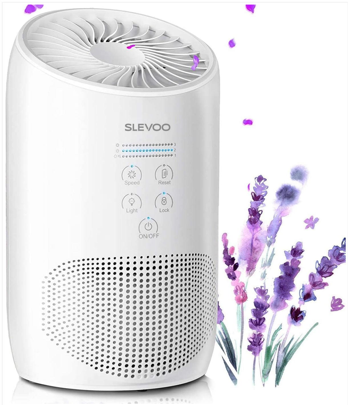
Figure 1.1: Slevoo Air Purifier BS-03