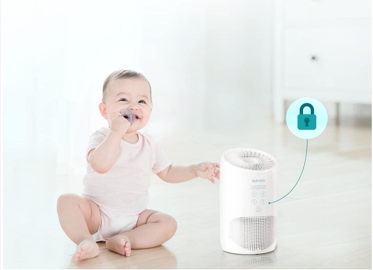
Figure 3.1: Control Panel

Pressing and holding down the child lock button for 3 seconds activates this and prevents any changes until the lock is removed. This is definitely a useful function if you have curious children or pets at home.