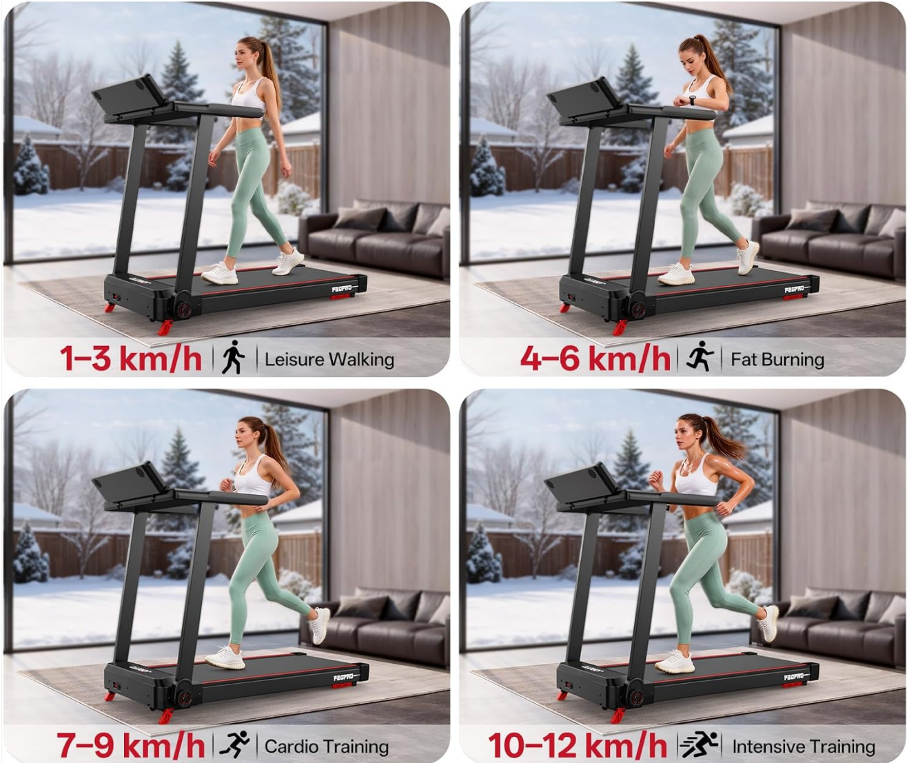
Figure 4.1: Treadmill speed ranges for various activities. This image illustrates different speed settings (1-3 km/h for leisure walking, 4-6 km/h for fat burning, 7-9 km/h for cardio training, and 10-12 km/h for intensive training) to guide users in selecting appropriate workout intensities.

Adjustable speed up to 12 km/h to suit all users