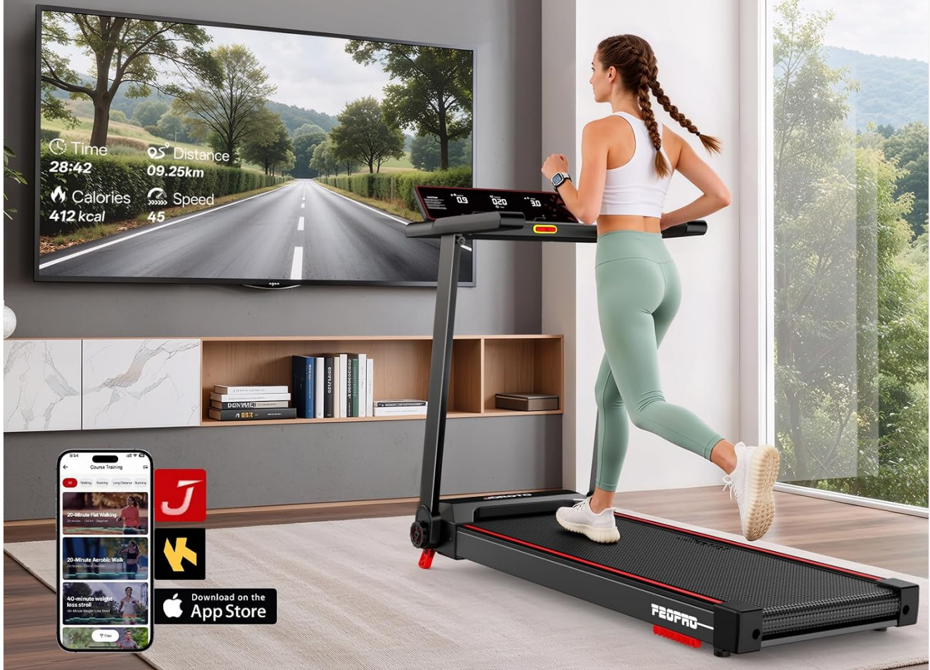
Figure 4.3: Smart app connectivity feature. This image shows a user exercising on the treadmill while connected to a fitness app, demonstrating how the app displays workout data and enhances the training experience.

More scientific training, greater motivation to exercise