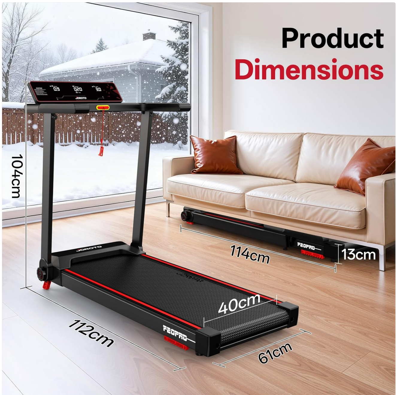
Figure 3.1: Product dimensions of the JOROTO F20PRO Treadmill. This image illustrates the treadmill's measurements (length, width, height) in both unfolded and folded states, aiding in proper placement and storage planning.