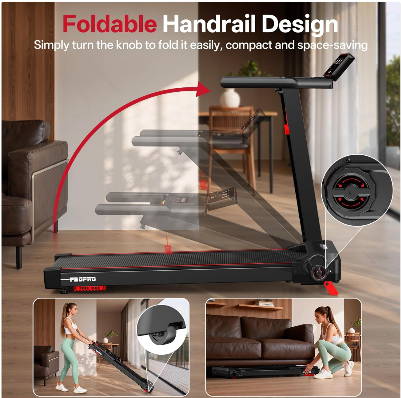
Figure 5.1: Foldable handrail design and storage. This image demonstrates the process of folding the treadmill's handrails and then the entire unit for compact storage, highlighting its space-saving feature.