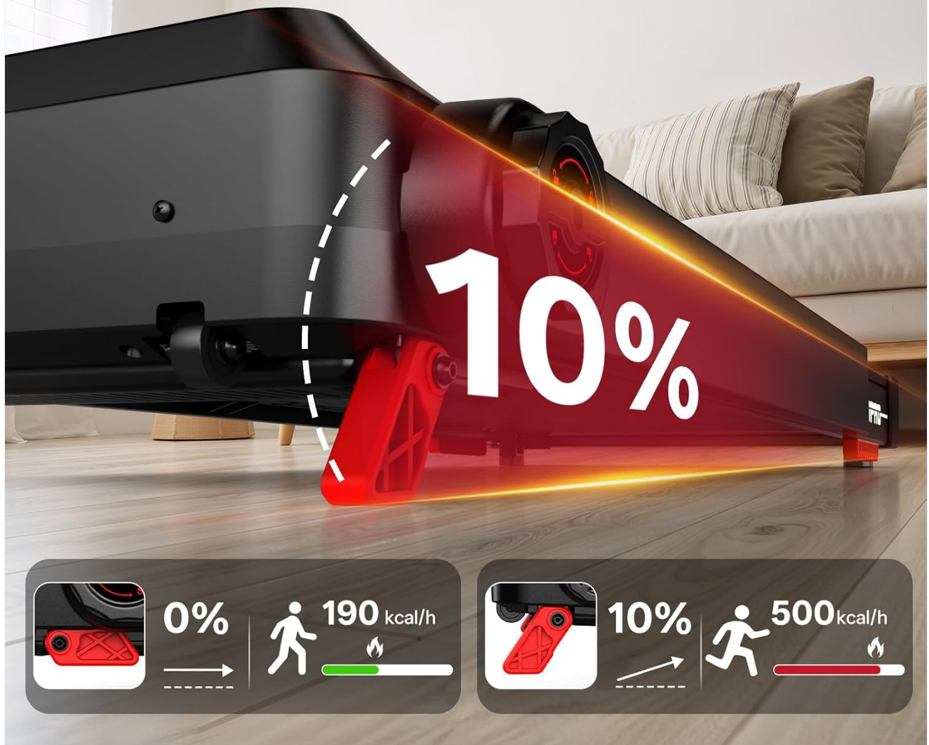
Figure 4.2: Manual incline adjustment mechanism. This image demonstrates how to manually adjust the treadmill's incline, showing the difference between a flat (0%) and an inclined (10%) running surface and the corresponding calorie burn.