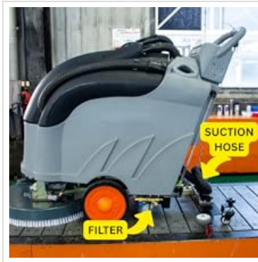
An image indicating the location of the suction hose and filter, crucial components for proper vacuum function and requiring periodic inspection and cleaning.