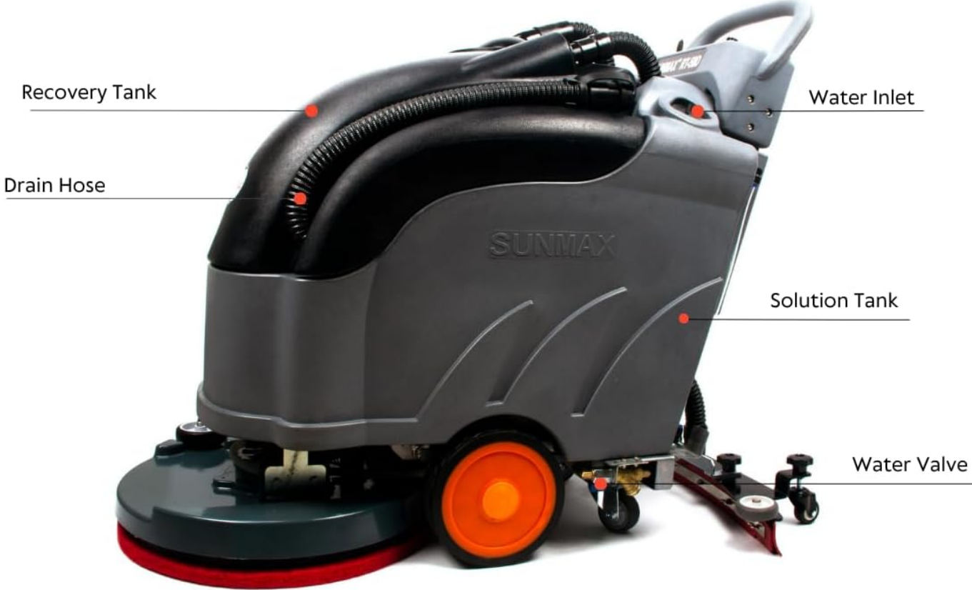
An illustration of the scrubber's tank system, indicating the solution tank for clean water, the recovery tank for dirty water, the water inlet, drain hose, and water valve.