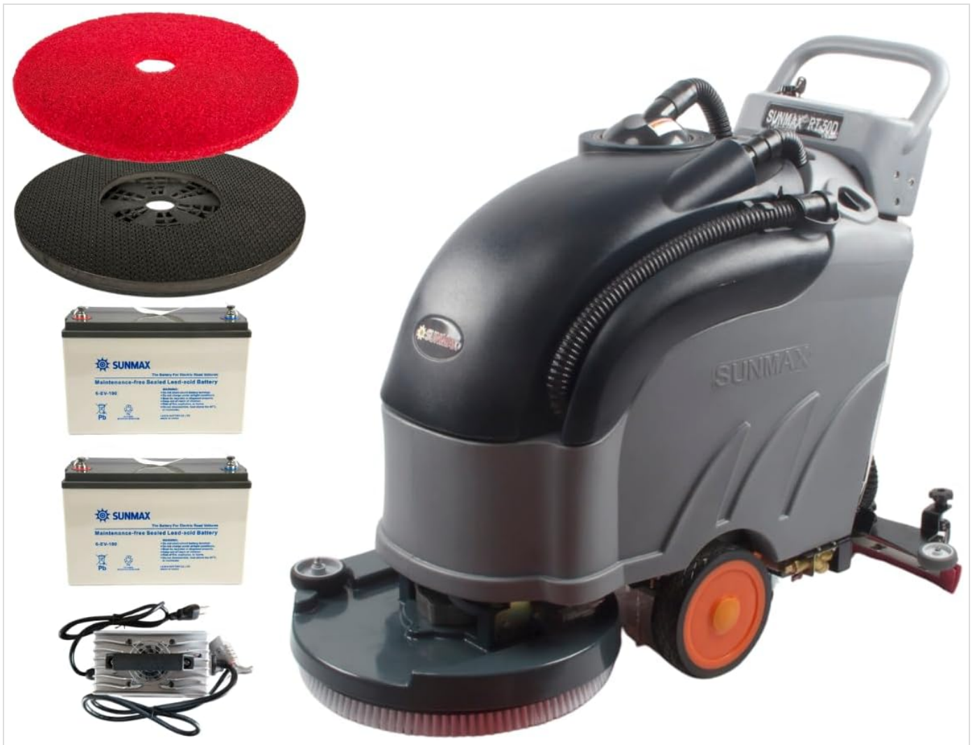
This image displays the SUNMAX RT50D self-propelled floor scrubber dryer along with its essential accessories: a heavy-duty brush, red burnishing pad, two 12V batteries, and the intelligent 15V charger.