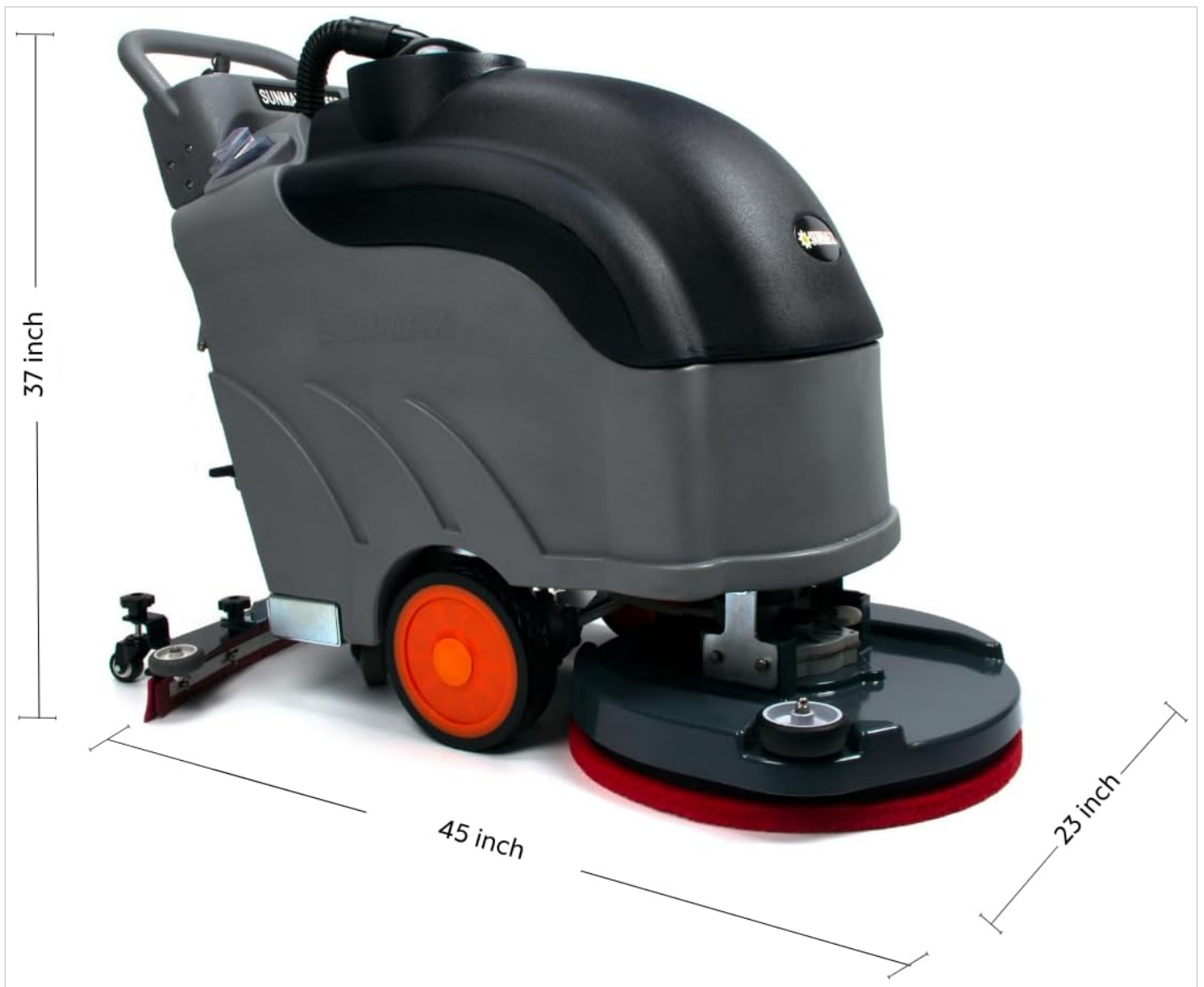
A dimensional drawing of the SUNMAX RT50D, providing its height, depth, and width measurements.