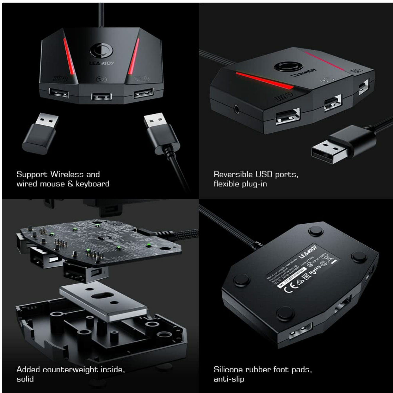
Image: An exploded view of the Leadjoy VX2 AimBox, showing its internal components including the circuit board, counterweight, and silicone rubber foot pads, indicating its solid construction.