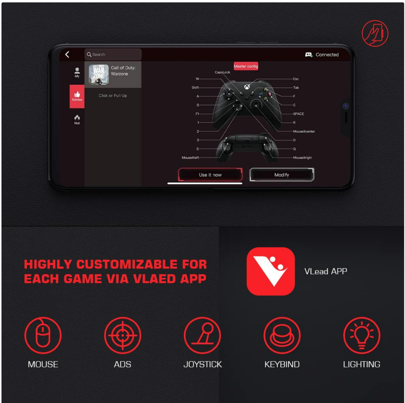
Image: A mobile phone screen displaying the VLead App interface, showing options for customizing mouse, ADS, joystick, keybinds, and lighting settings for a game like Call of Duty: Warzone.