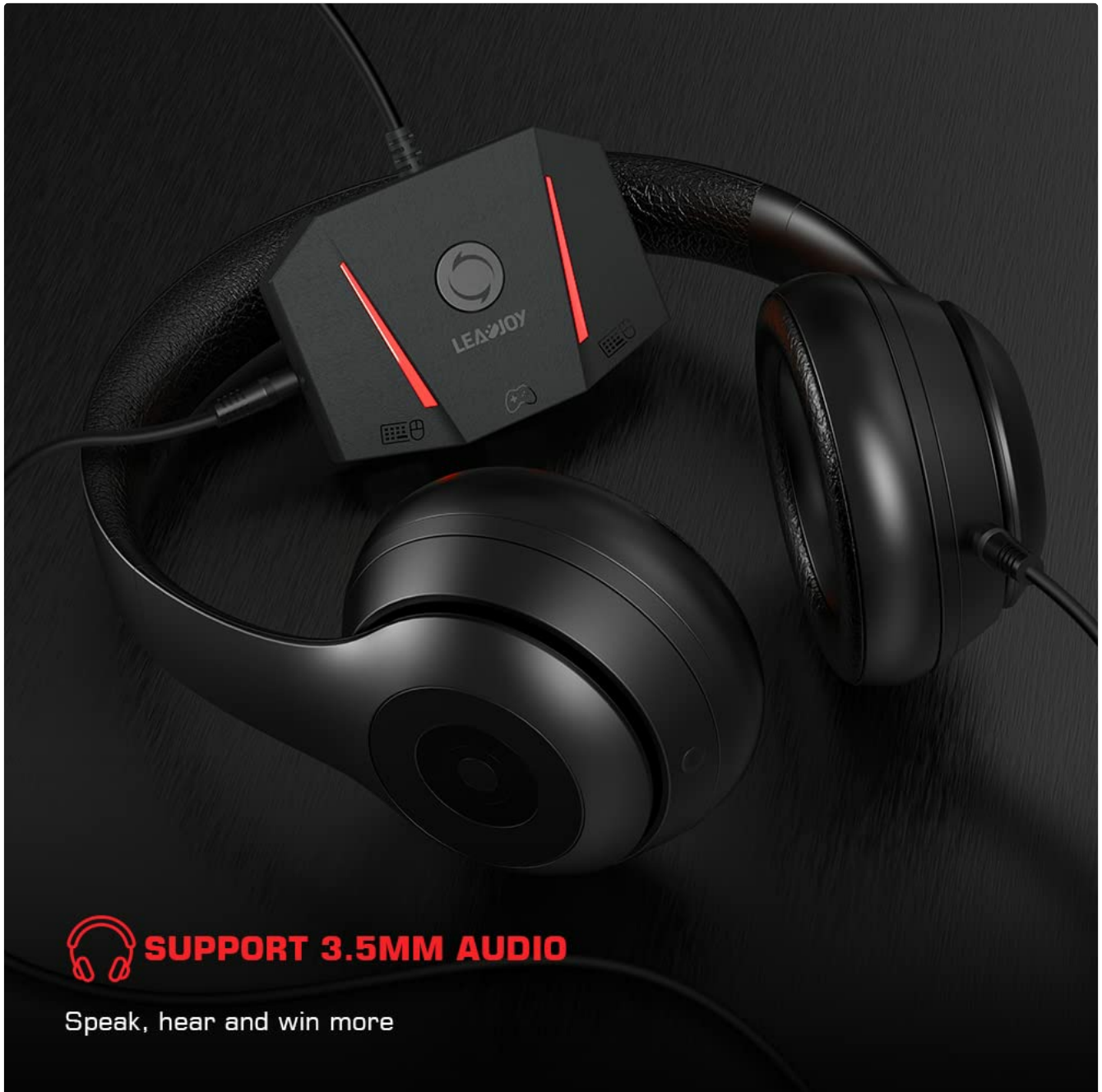
Image: The Leadjoy VX2 AimBox adapter with a gaming headset plugged into its 3.5mm audio jack, highlighting the audio support feature.

The VX2 AimBox includes a built-in 3.5mm headset jack. This allows you to connect your gaming headset directly to the adapter, enabling voice chat with teammates and real-time stereo sound from the game. This feature helps to reduce environmental noise and enhances immersion.