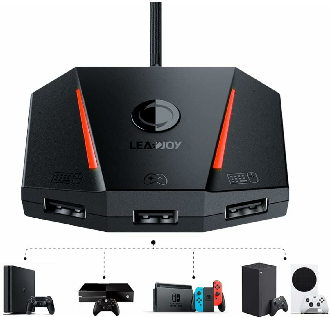
Image: The Leadjoy VX2 AimBox, a compact black device with red accents, shown with diagrams illustrating its compatibility with Xbox One, Xbox Series X/S, PlayStation 4, and Nintendo Switch consoles.