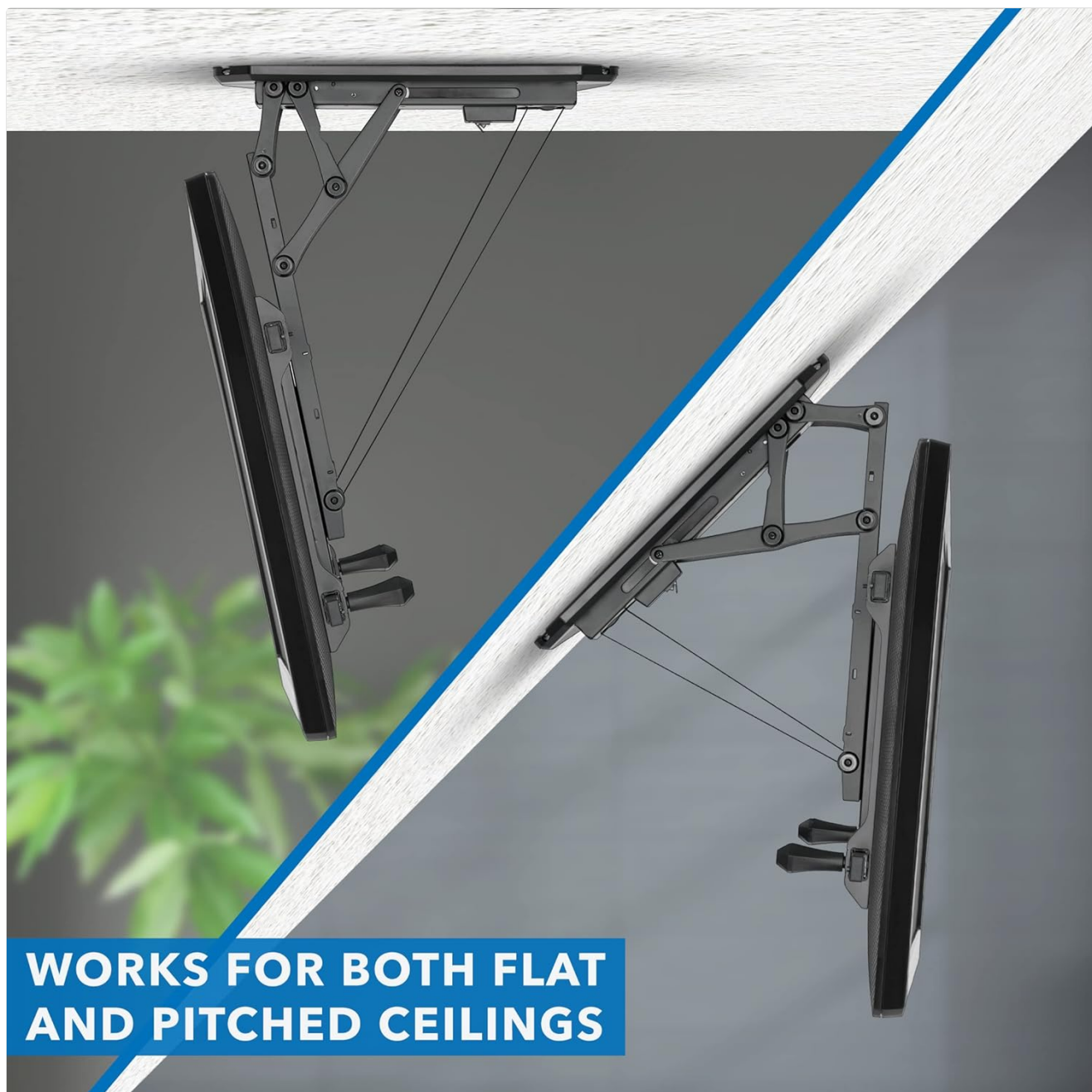
Image: Illustration demonstrating the Mount-It! ceiling TV mount's compatibility with both flat and pitched ceiling installations. The mount features a keyhole pattern for easy installation, and the mounting bracket positions can be adjusted based on your TV's VESA pattern location to ensure optimal fit and balance.