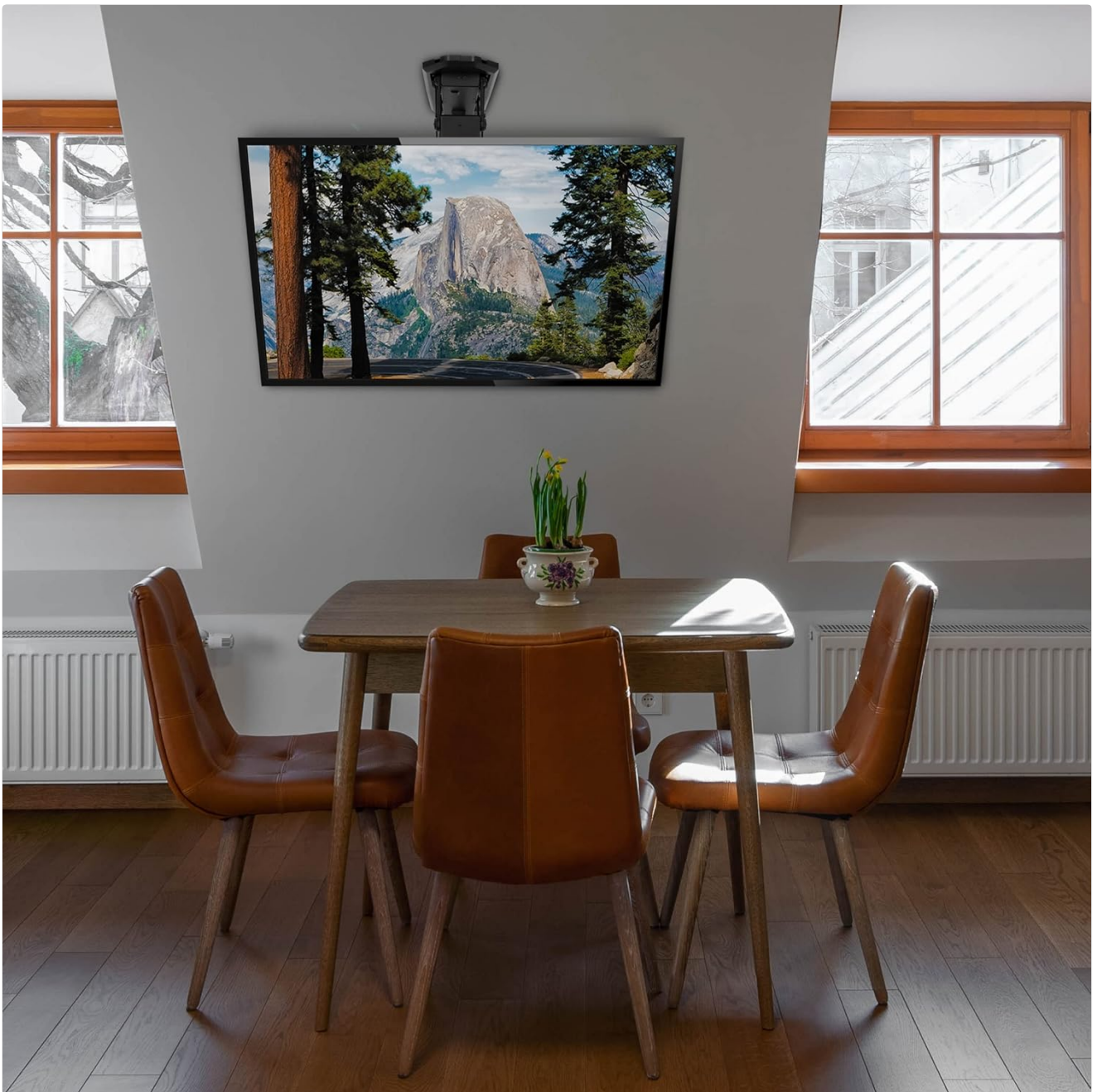
Image: A visual representation of the mount's 75-degree tilt capability, allowing for flexible viewing positions.

The remote and app feature memory presets, enabling you to save and recall your favorite viewing positions with a single press. This is ideal for quickly setting up your TV for different activities like watching movies, gaming, or presentations.