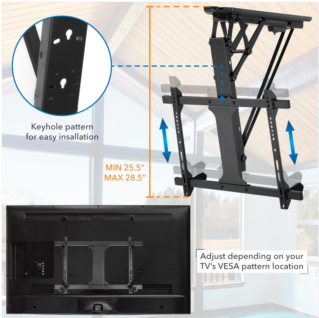
Image: Detailed diagram illustrating the dimensions of the mount and the various VESA patterns it supports, along with its weight capacity.