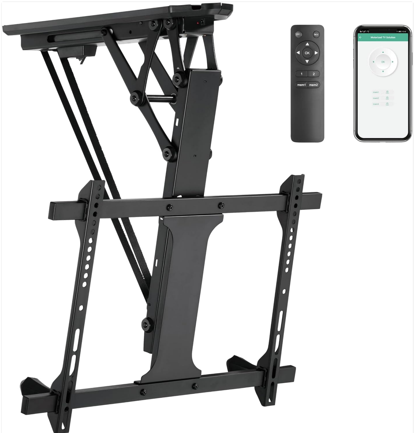
Image: The Mount-It! MI-4224 Motorized Ceiling TV Mount, showing the main bracket, remote control, and smartphone app interface.