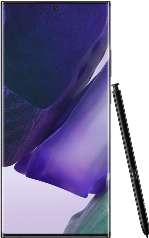
Image: Front view of the Samsung Galaxy Note 20 Ultra 5G, showcasing its large Infinity-O display and the S Pen positioned to the side.