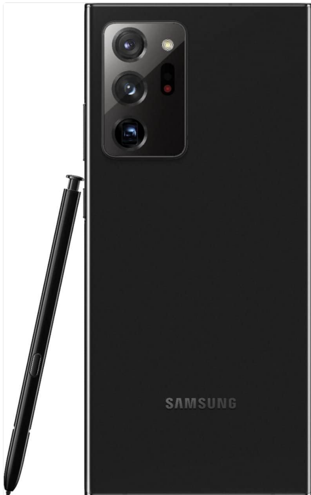
Image: Back view of the Samsung Galaxy Note 20 Ultra 5G, highlighting the prominent multi-lens camera module and the S Pen.