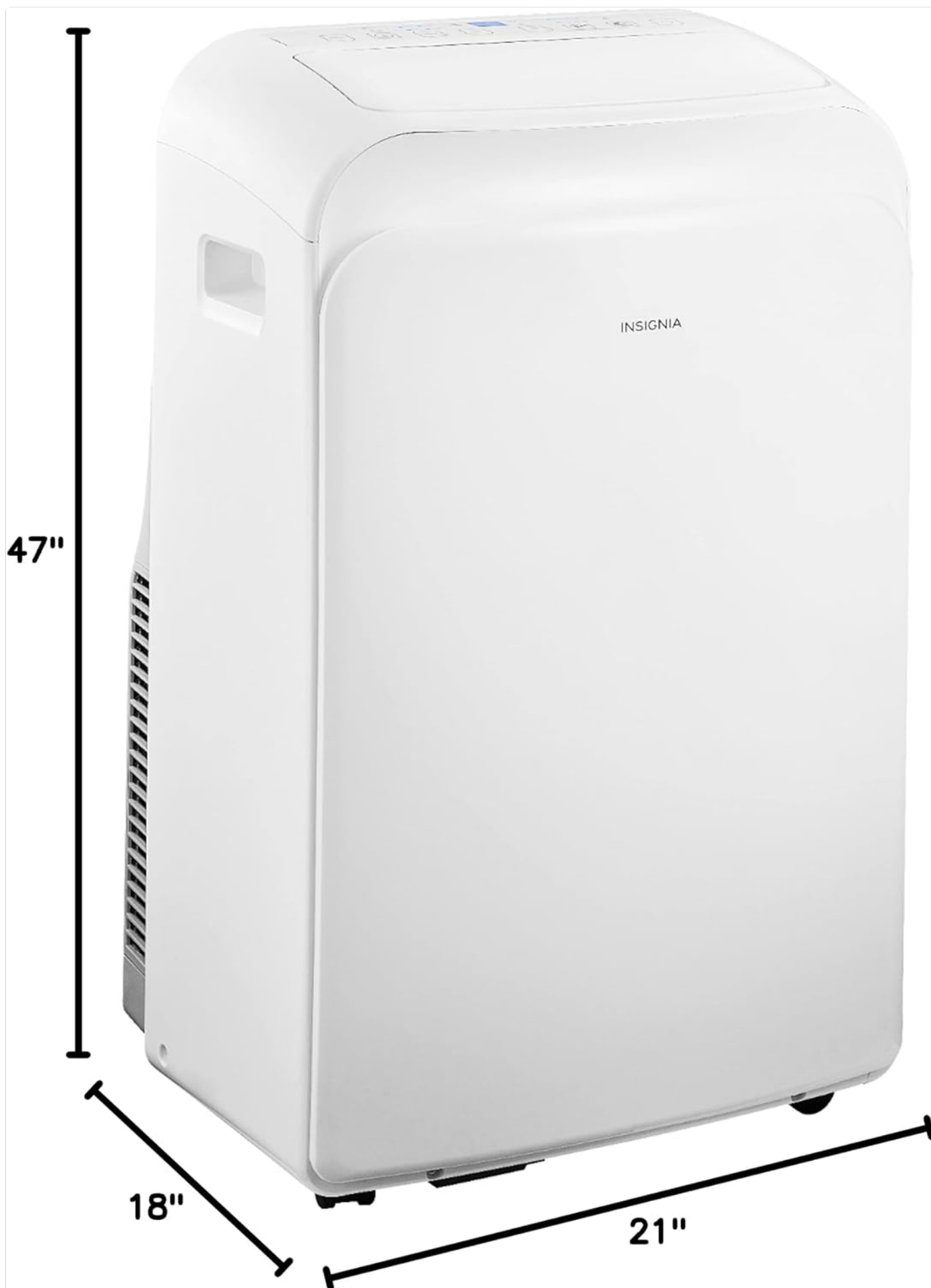
Diagram showing the dimensions of the Insignia NS-AC06PWH1 portable air conditioner: 47 inches height, 21 inches depth, 18 inches

5. Power Connection: Plug the power cord into a grounded 110V AC electrical outlet.