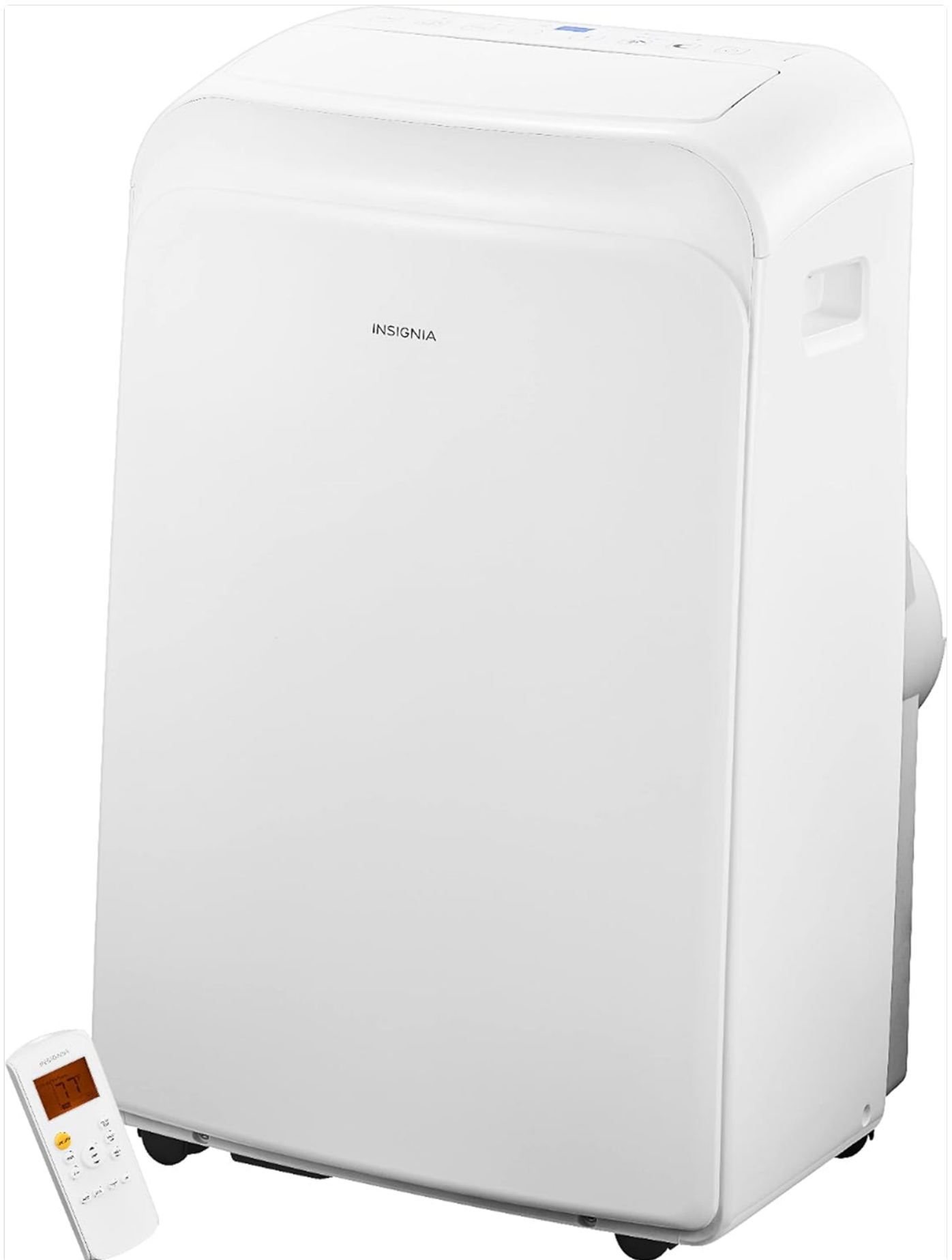
Front view of the Insignia NS-AC06PWH1 portable air conditioner, showing its compact design and the included remote control.