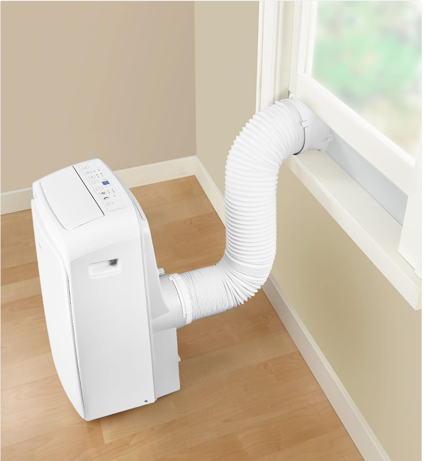
The portable air conditioner with its exhaust hose properly installed and vented through a window using the window slider kit.