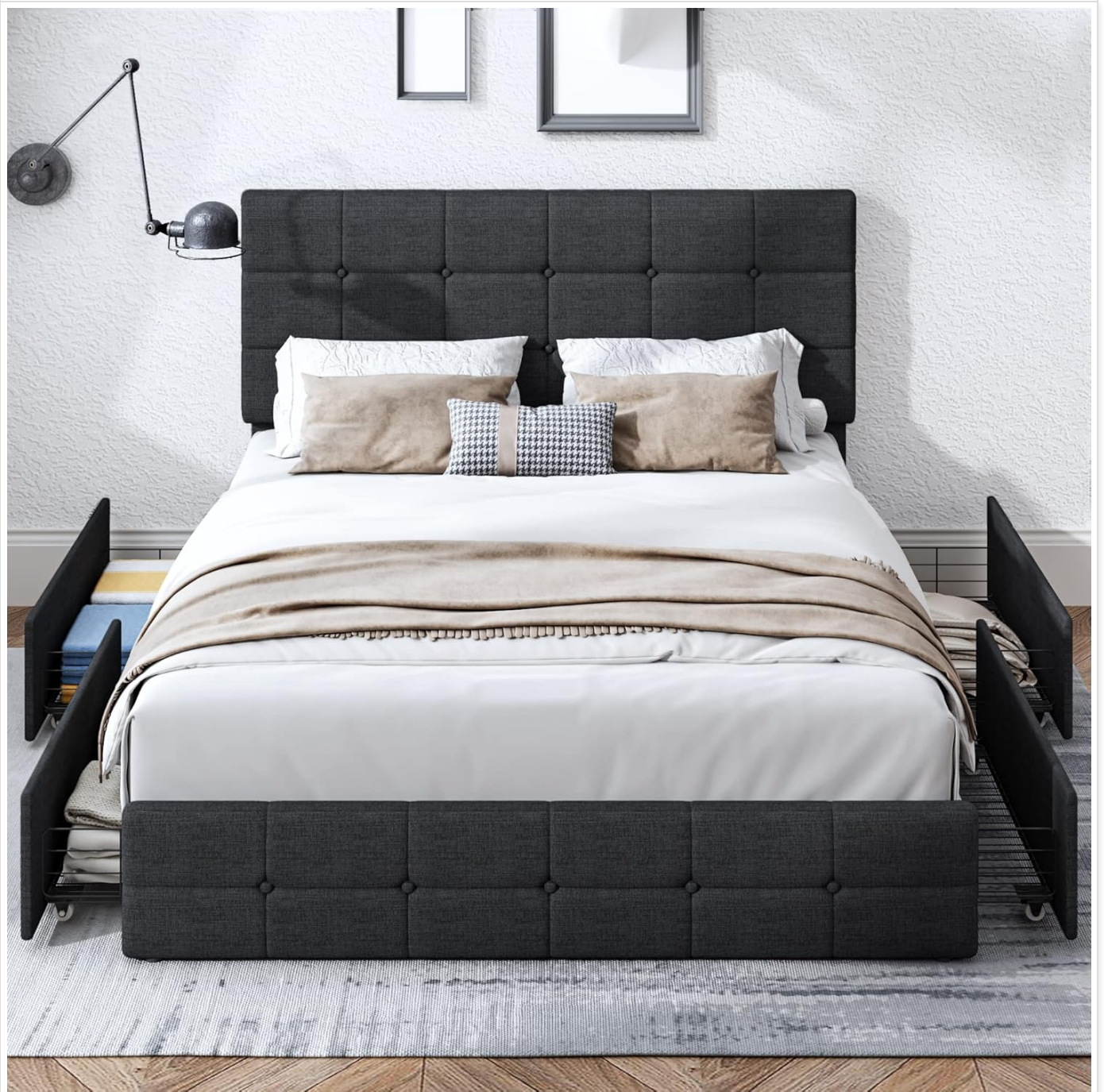
Figure 3.4: Bed frame with storage drawers.