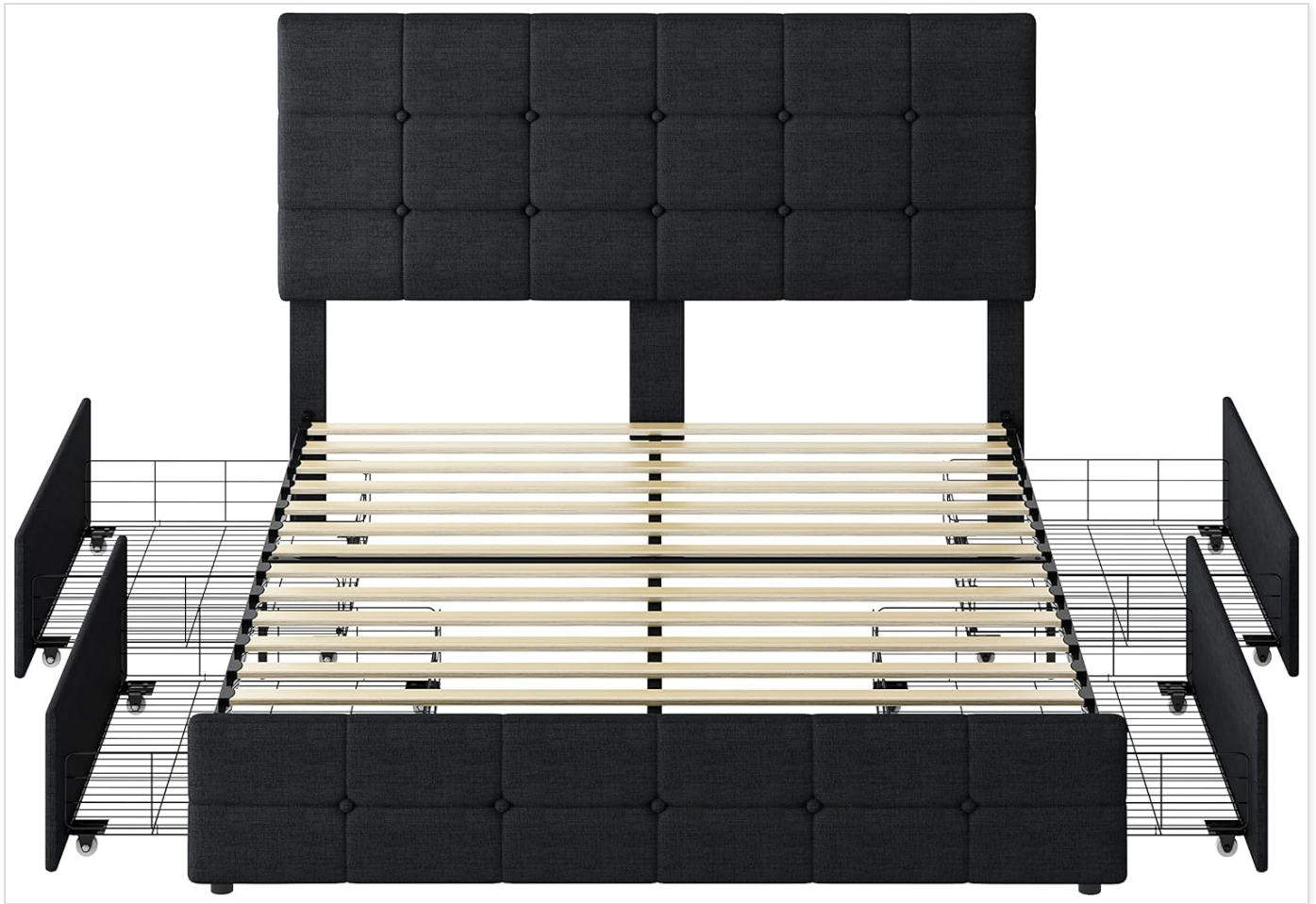
Figure 2.1: Exploded view of bed frame components.