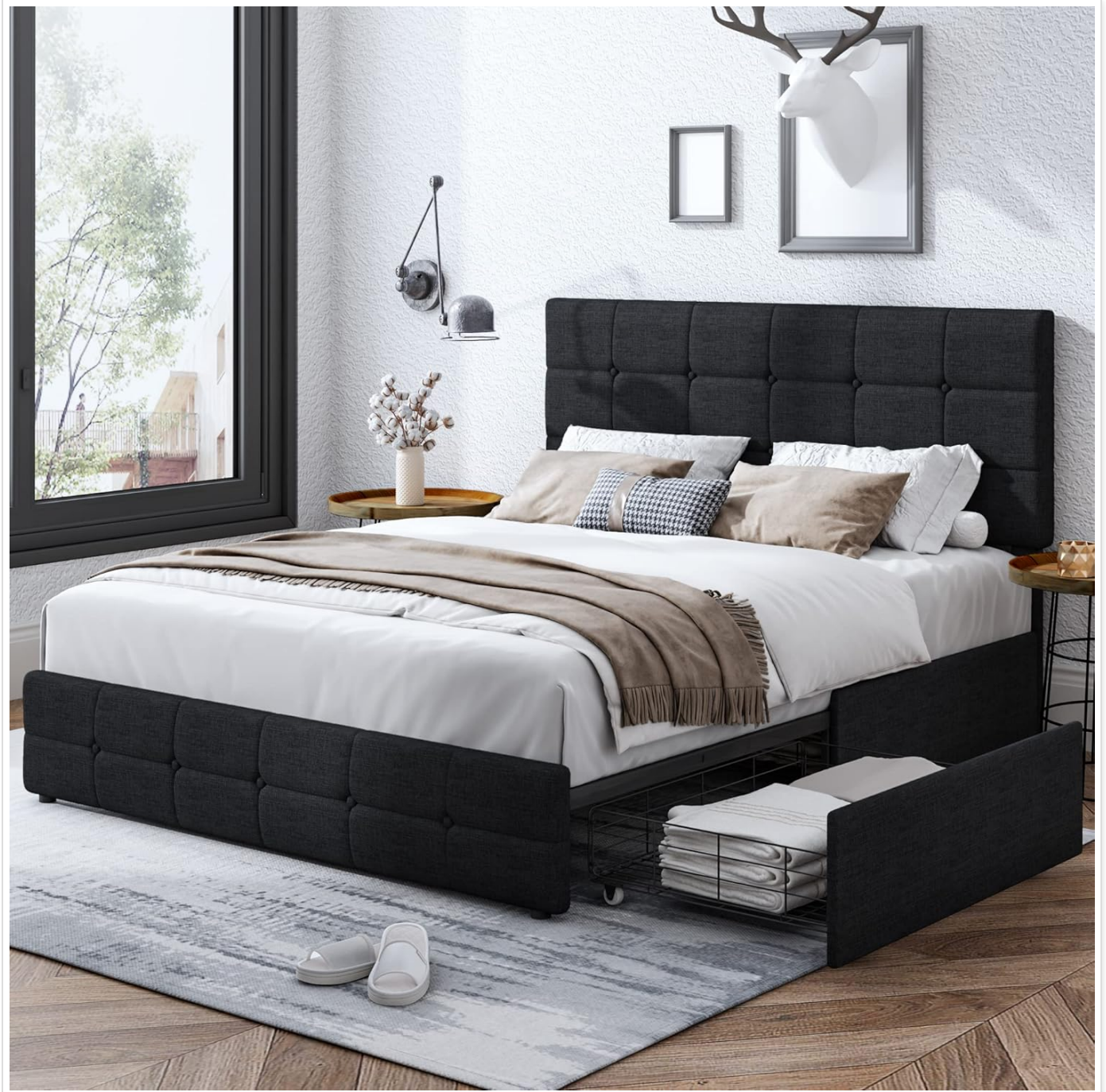
Figure 3.1: Assembled bed frame overview.

Connect the side rails (C) to the headboard (A) and footboard (B) using the provided bolts and the Allen wrench. Ensure the upholstered sides face outwards.