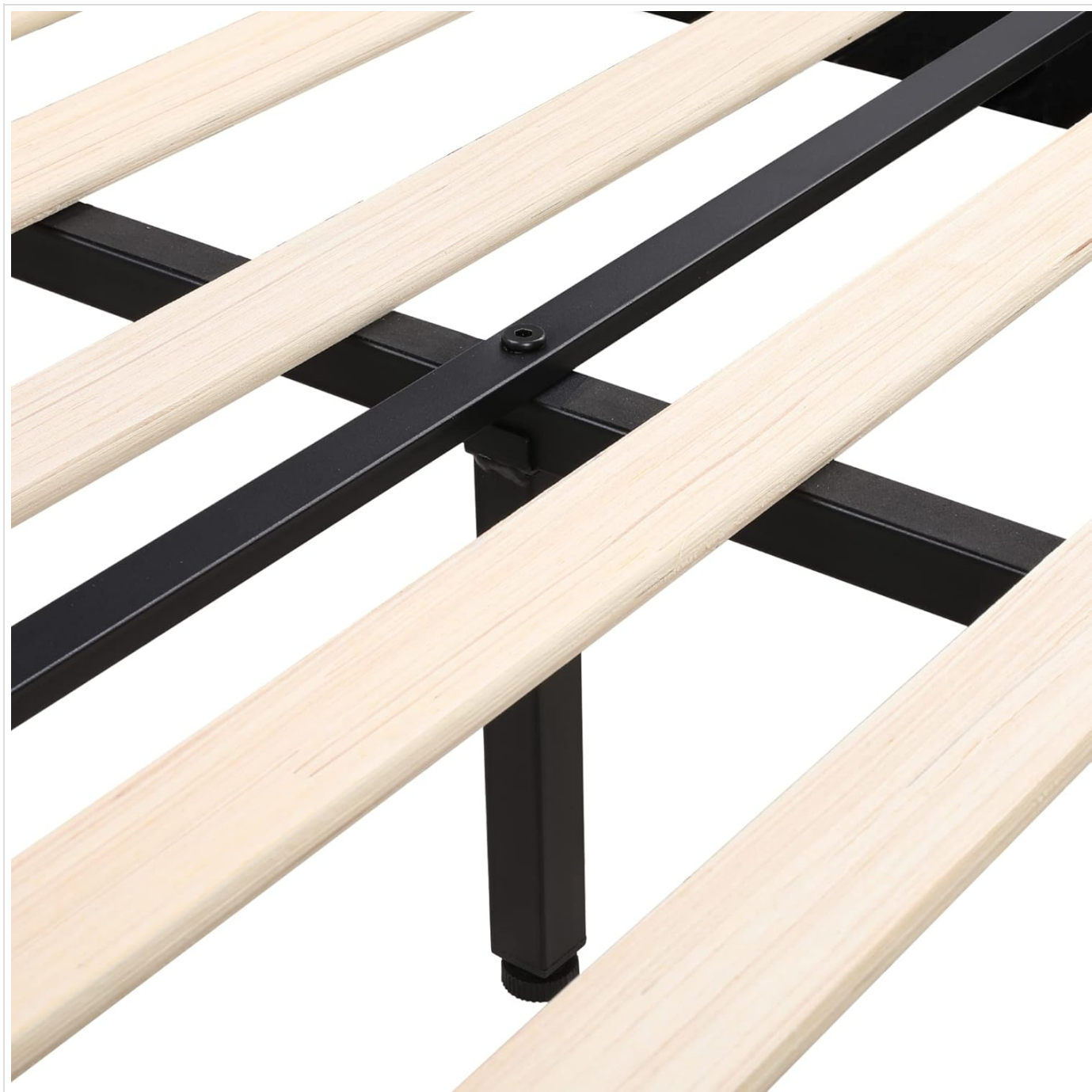
Figure 3.2: Detail of the center support and slat system.