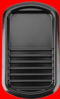
Non-stick Frying Pan