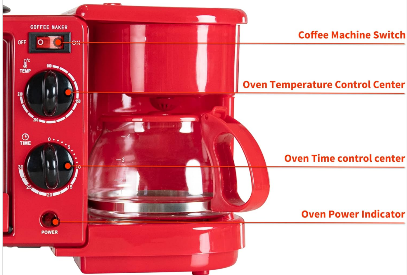
Figure 2: Visual representation of the 3-in-1 functionality, highlighting the frying pan, toaster oven, and coffee machine components.