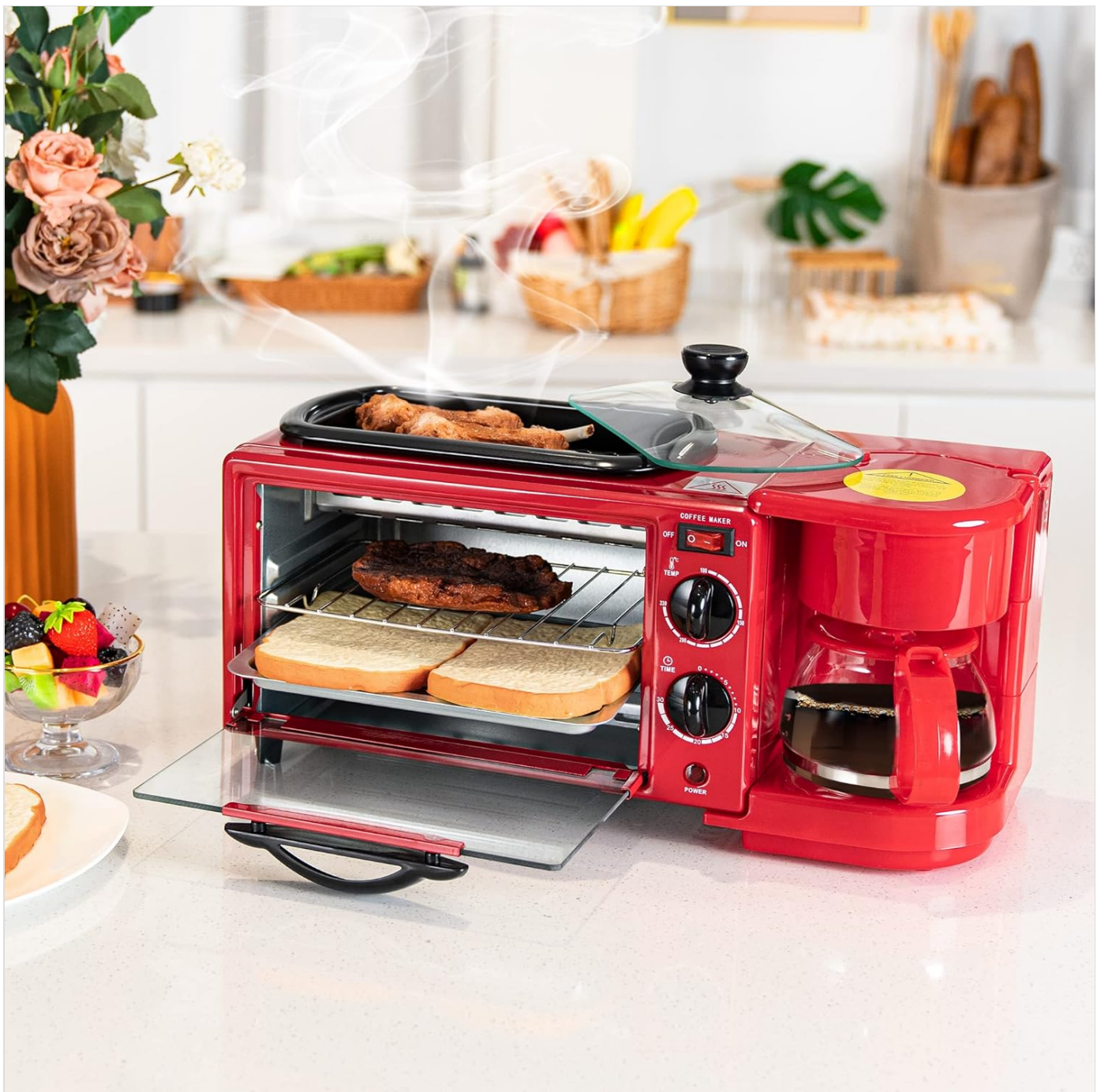
Figure 6: The coffee maker component with a full carafe of brewed coffee.