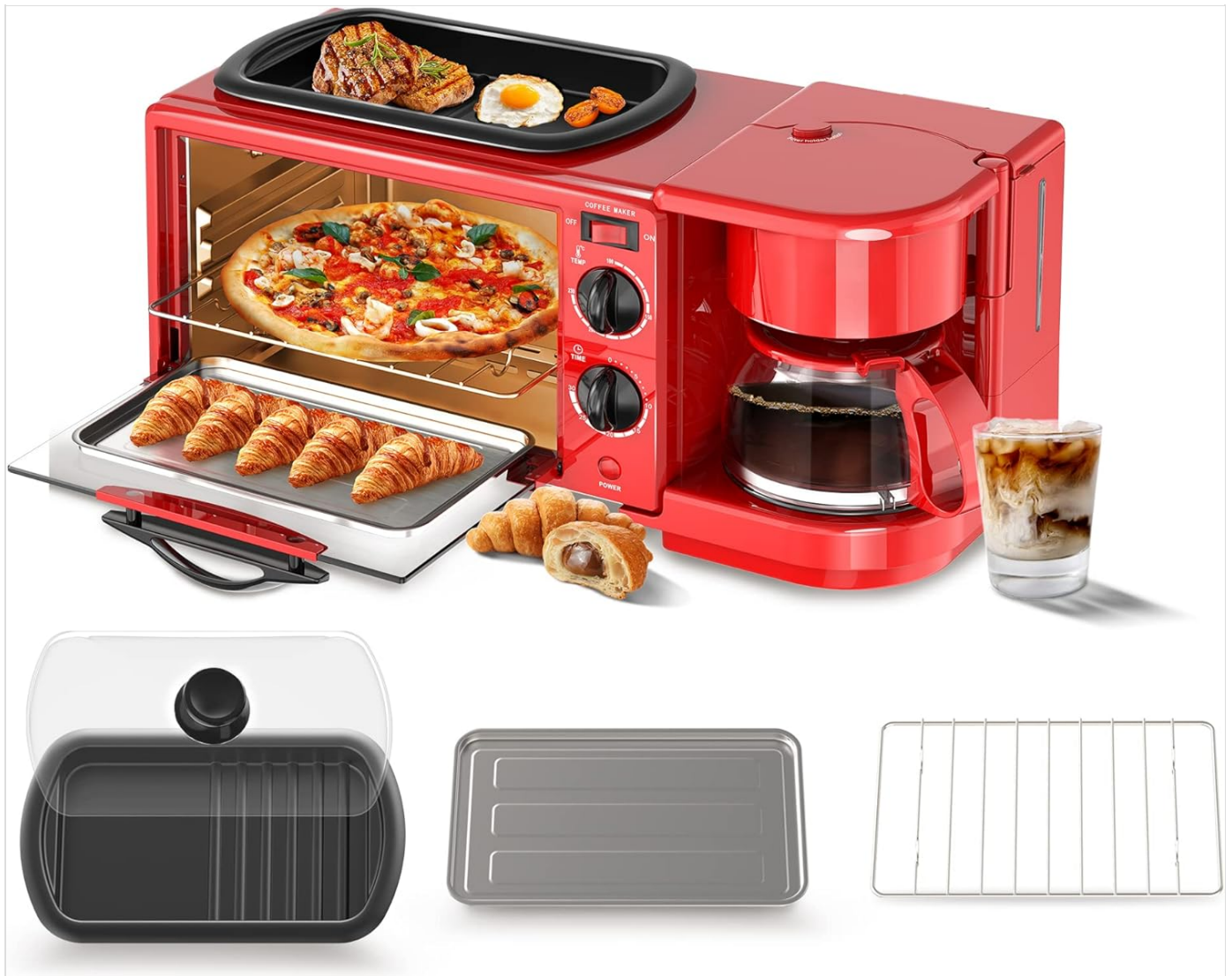
Figure 1: Overview of the DECAKILA 3-in-1 Breakfast Station, showing the toaster oven, coffee maker, griddle, and included accessories (bake tray, bake rack, frying pan, coffee pot, frying pan cover).

Familiarize yourself with the various parts of your DECAKILA 3-in-1 Breakfast Station.