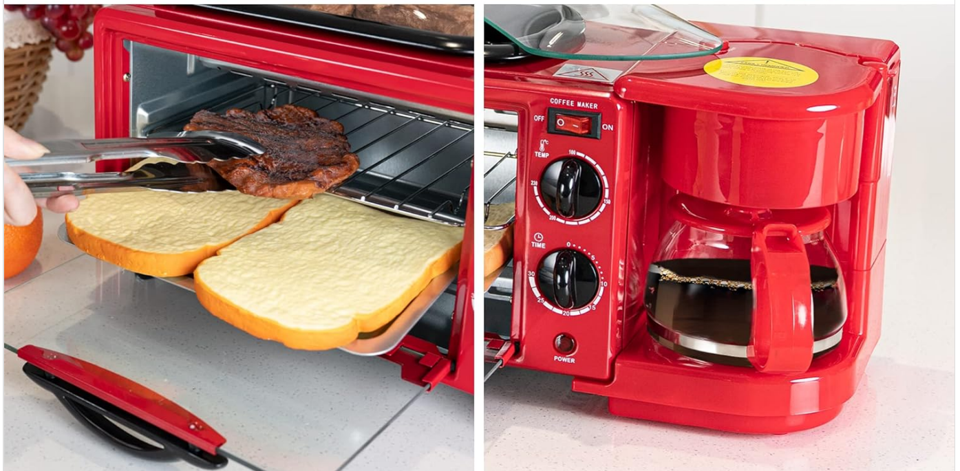
Figure 4: Detail of the anti-scald handle for safe operation of the oven door and griddle cover.