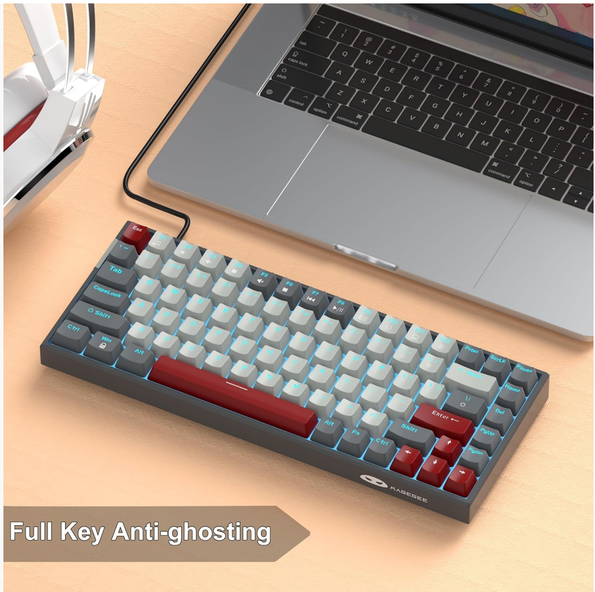
Image: The MageGee Star84 keyboard with text overlay indicating "Full Key Anti-ghosting", illustrating its capability to register multiple simultaneous key presses.