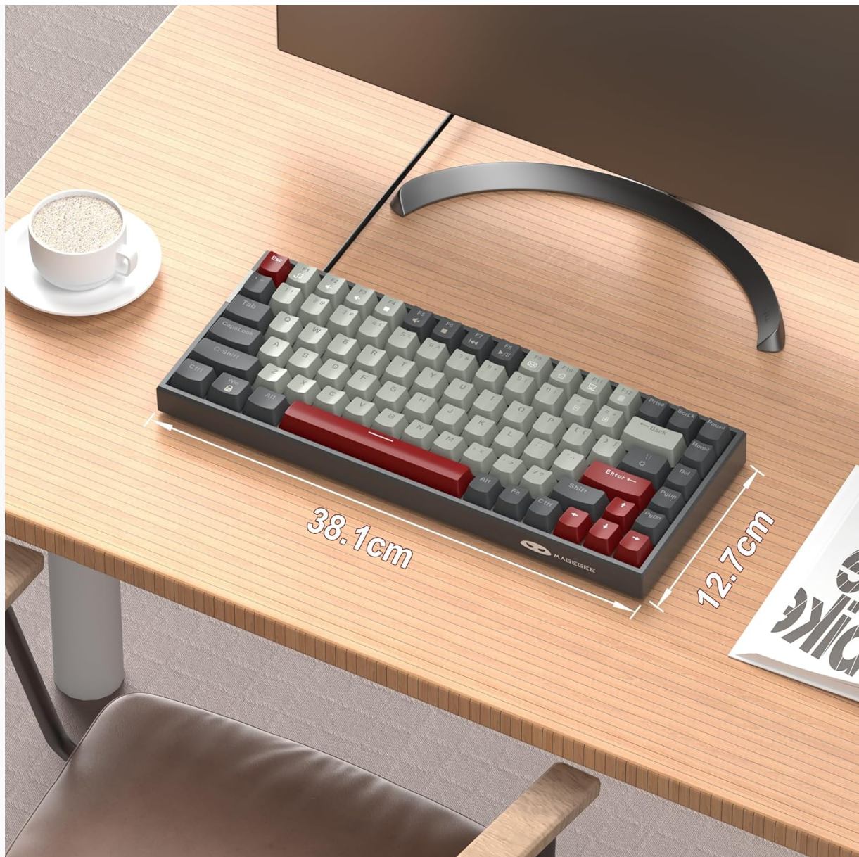
Image: Top-down view of the MageGee Star84 keyboard with dimensions labeled as 38.1cm (length) and 12.7cm (width).