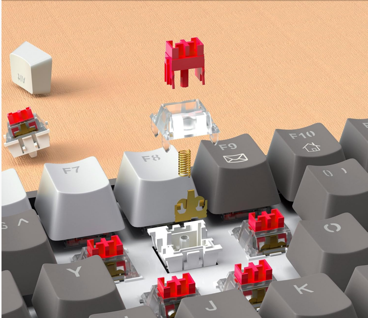
Image: Exploded view of a Red Mechanical Switch, showing its internal components and highlighting its linear actuation.

50 Million keystroke life, Linear & fast response