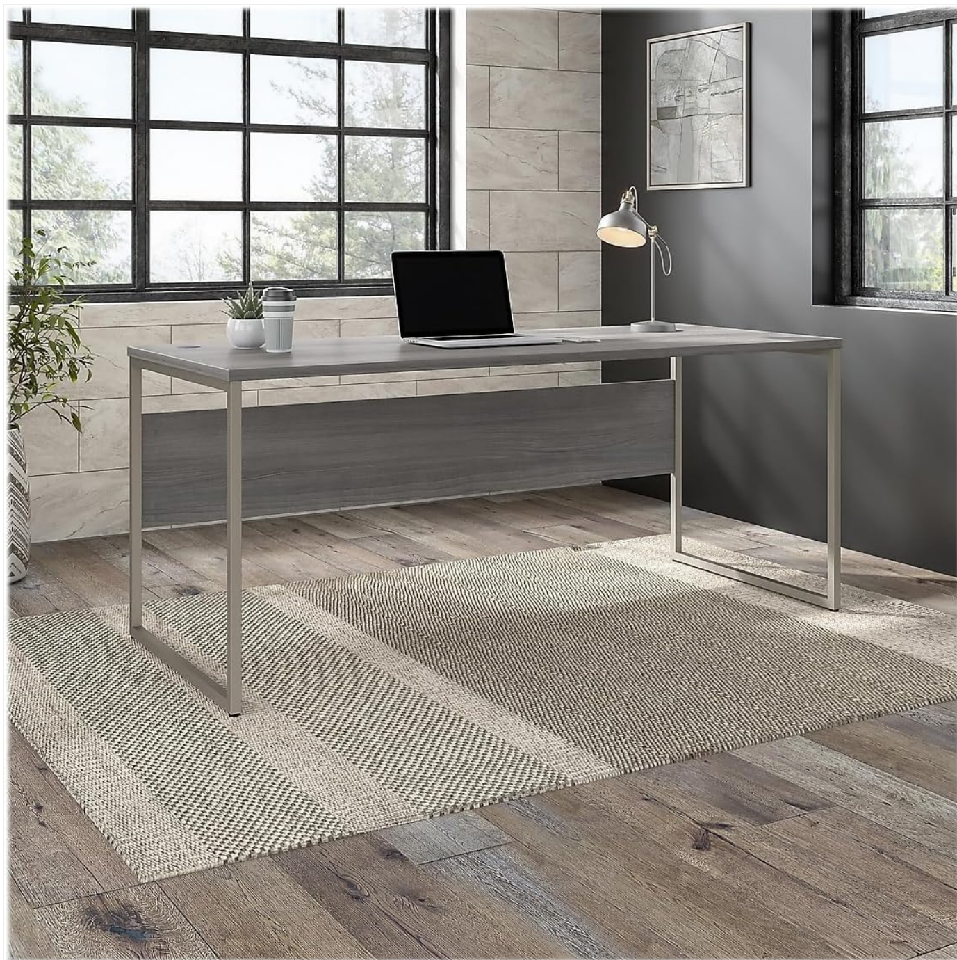
Image 2.1: The assembled desk in a typical office environment, showcasing its spacious design.

prevents tipping, especially in environments with children or pets.