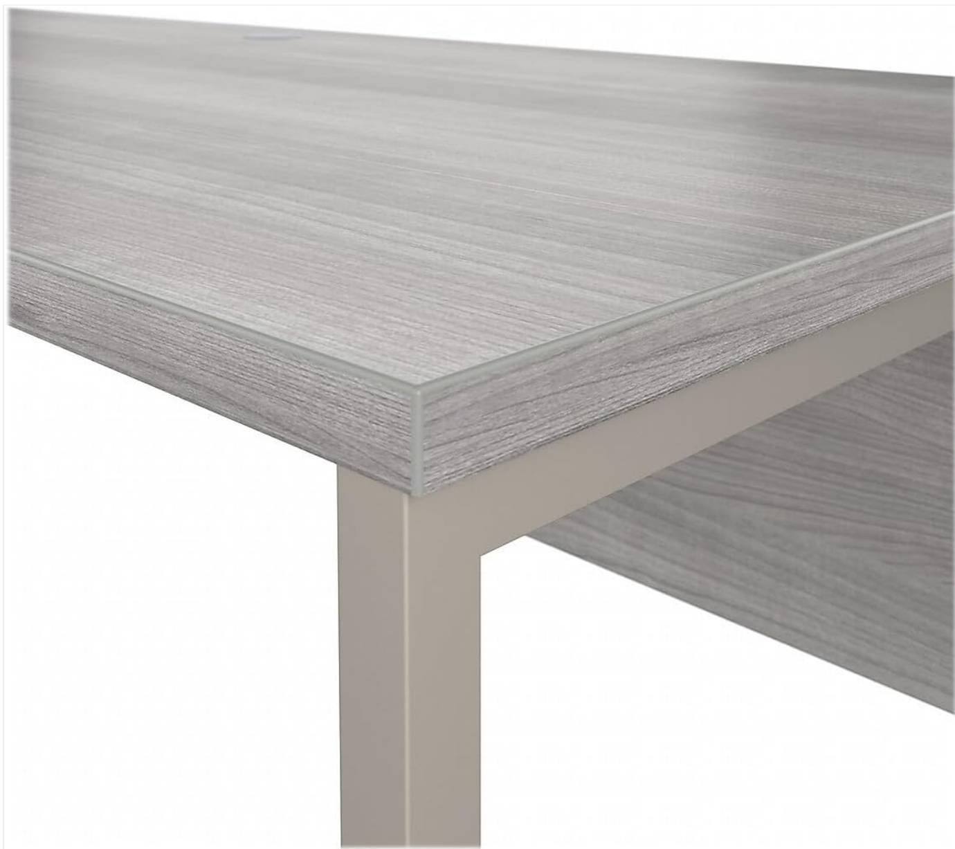
Image 4.1: Detail of the desk's laminated surface, highlighting its finish.