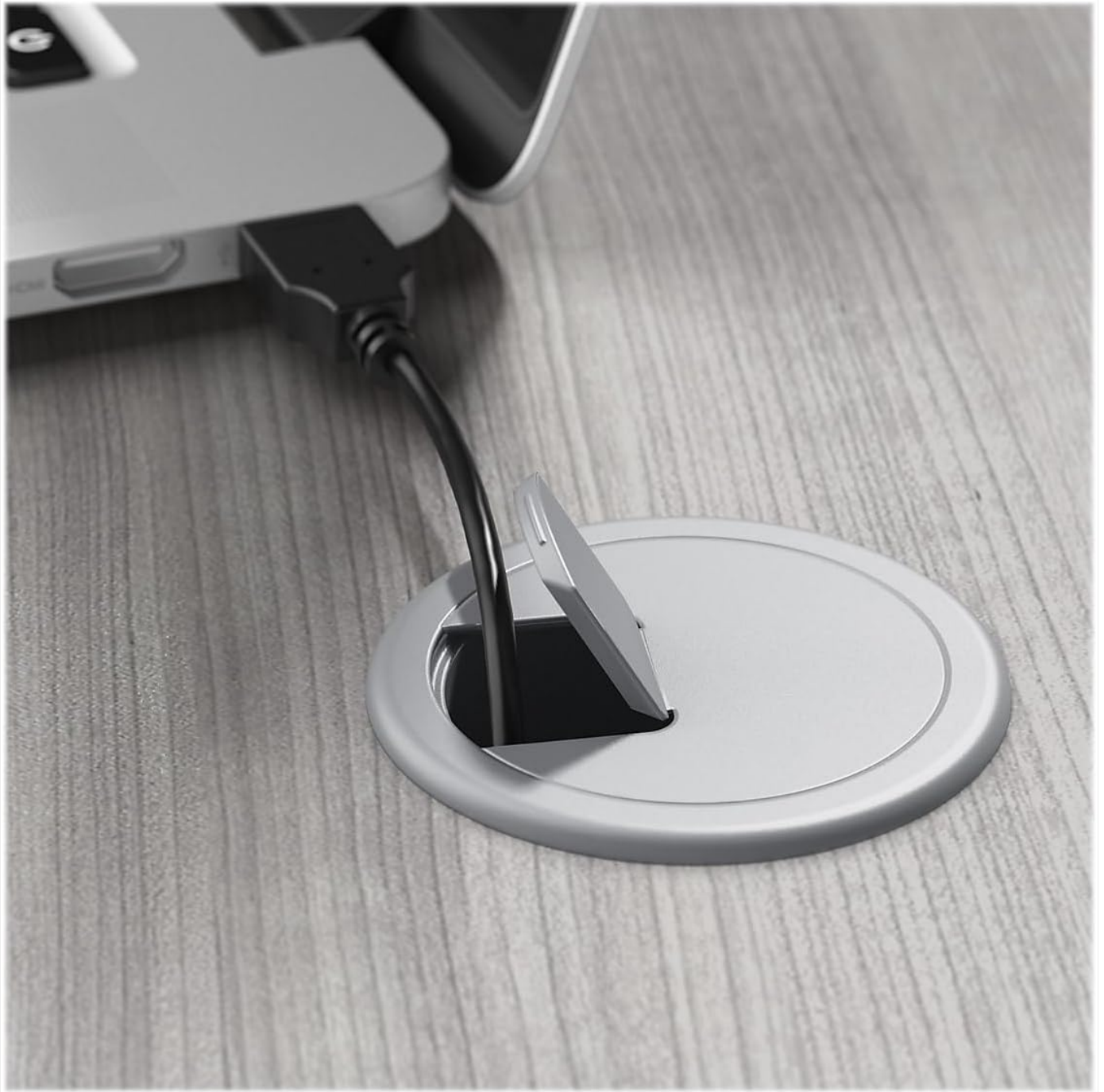
Image 3.1: A close-up view of the wire management grommet, demonstrating its function for cable organization.