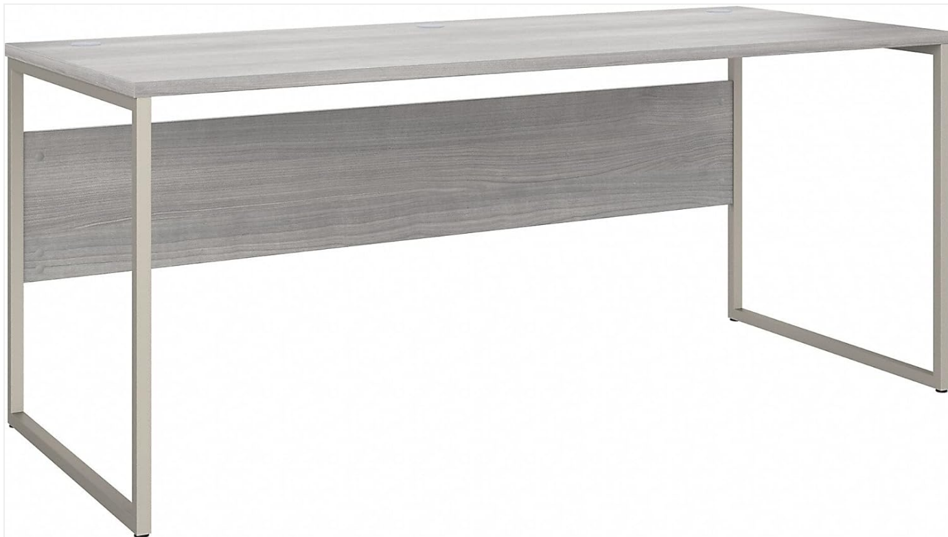
Image 1.1: The Bush Business Furniture Hybrid 72W x 30D Computer Table Desk in Platinum Gray.

The Bush Business Furniture Hybrid 72W x 30D Computer Table Desk provides a practical and durable workspace. Designed for both home and commercial office environments, this desk features a contemporary aesthetic with an open metal leg design and a finished privacy panel. It is built to support multiple monitors and equipment, offering ample space for various tasks.