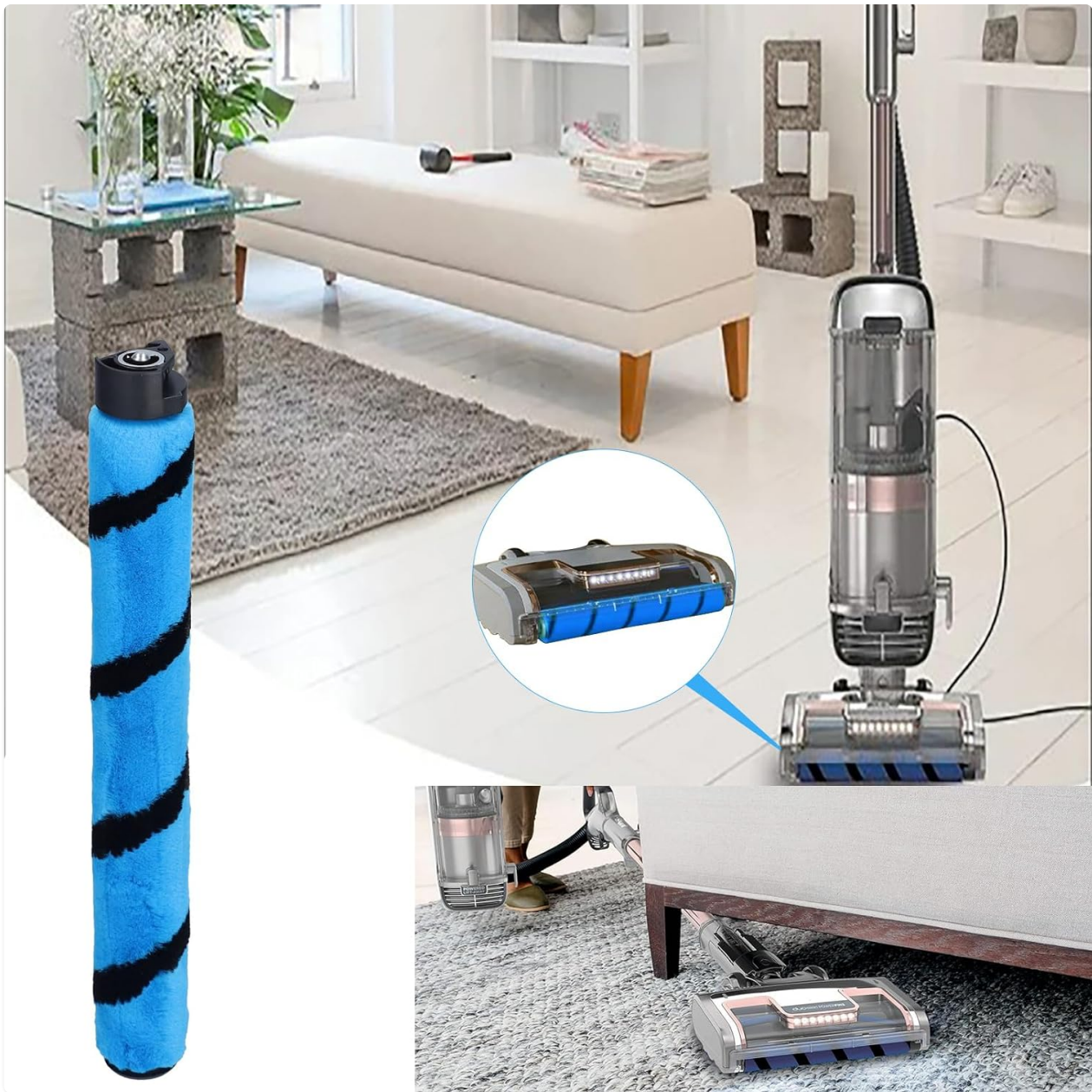
Image: The roller brush in action, cleaning various floor types.