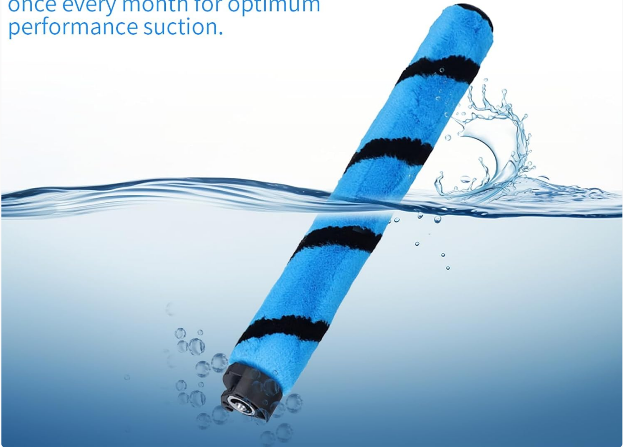
Image: Instructions for washing and drying the roller brush.

Rinse soft roller underwater only. Air-dry filter completely for at least 24 hours. Suggest rinsing the soft roller brush once every month for optimum performance suction.