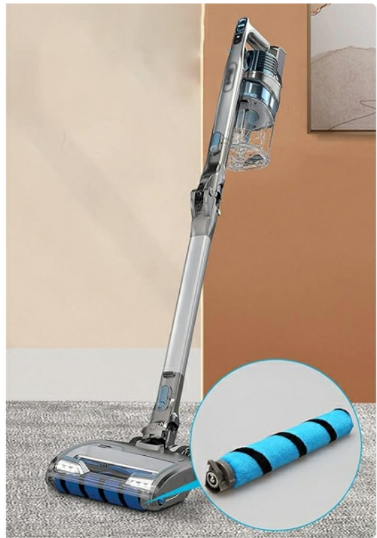
Image: Visual guide for easy brushroll replacement.