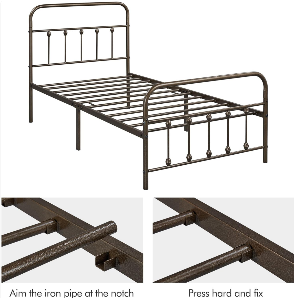
Figure 5: Aligning and pressing the metal slats into the frame notches.

Place the metal slats across the bed frame, ensuring they fit into the designated notches. Secure them if necessary. The embedded design helps prevent the mattress from sliding.