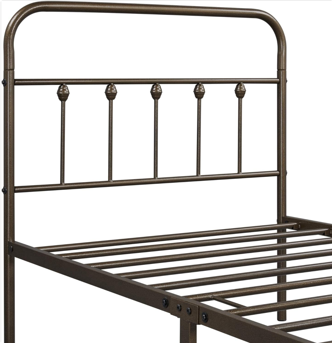
Figure 7: Close-up view of the elegant Victorian-style iron-art headboard.