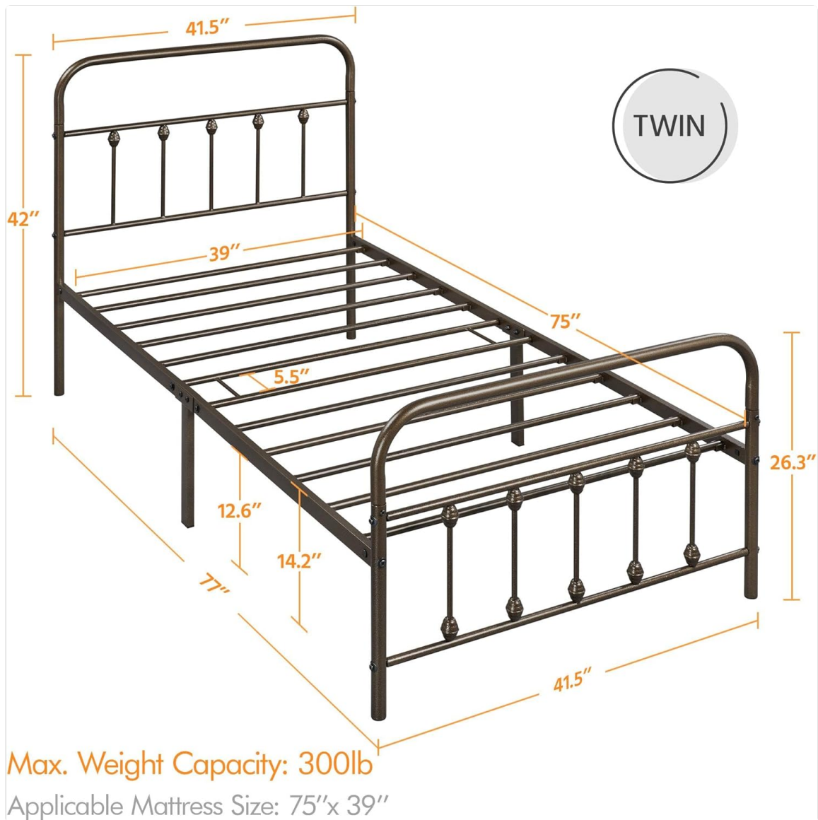
Figure 9: Detailed dimensions of the Yaheetech Twin Metal Platform Bed Frame.