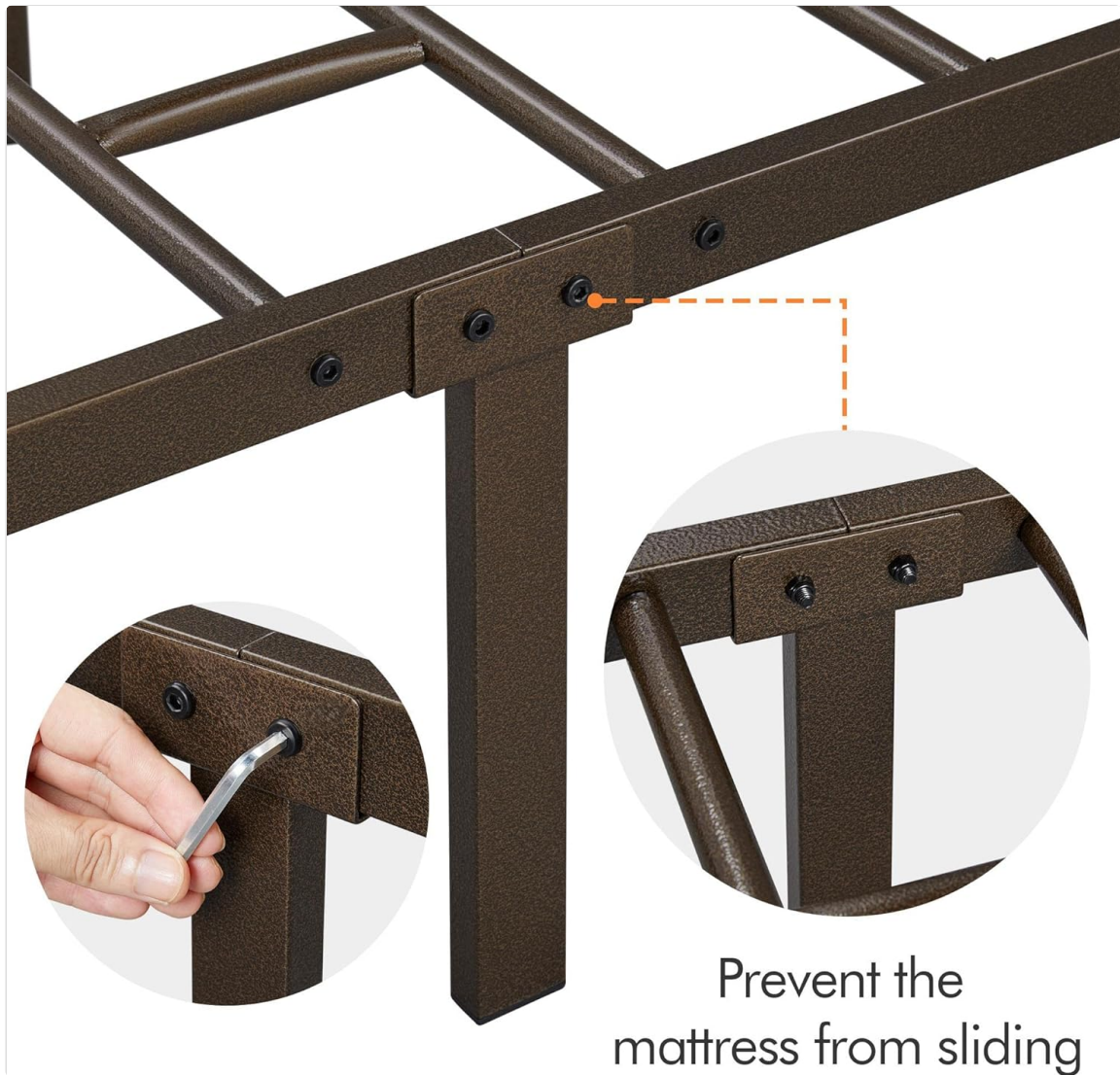
Figure 6: The integrated mattress stopper mechanism to prevent mattress movement.