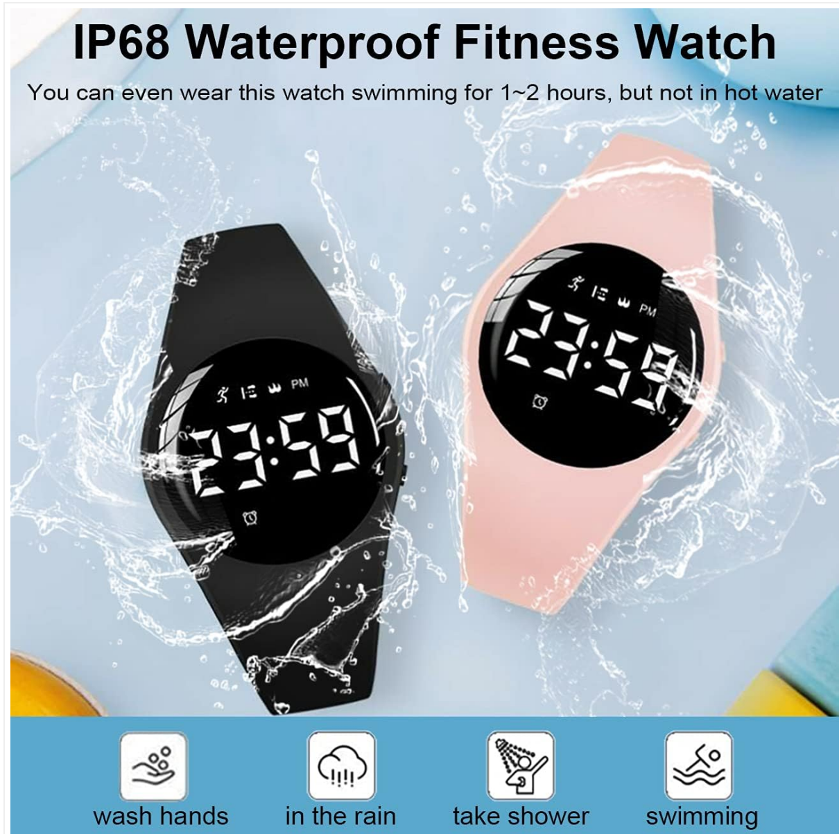
Image: Two HUYVMAY Fitness Trackers, one black and one pink, shown with water droplets, emphasizing their IP68 waterproof capability for activities like washing hands, rain, showering, and swimming.

The device has an IP68 waterproof rating, meaning it is resistant to dust and can withstand immersion in water up to 1.5 meters for up to 30 minutes. This allows for use during hand washing, in the rain, showering, and swimming for 1 to 2 hours. However, it is important to avoid exposure to hot water, as this can compromise the waterproof seals.