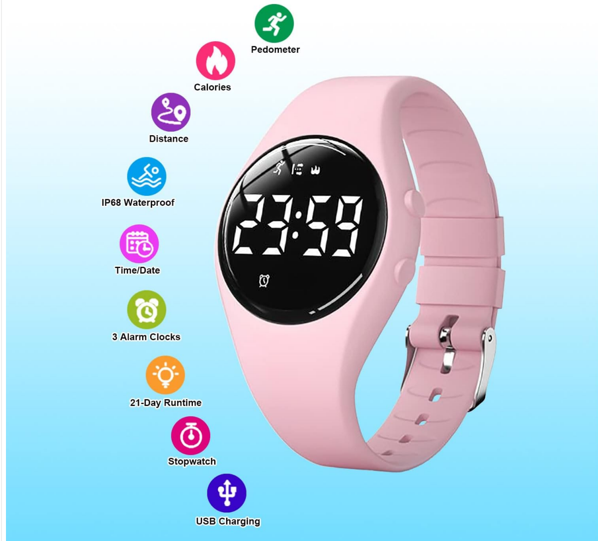
Image: The HUYVMAY Fitness Tracker T6F displaying its various functions including pedometer, calories, distance, IP68 waterproof rating, time/date, 3 alarm clocks, 21-day runtime, stopwatch, and USB charging.