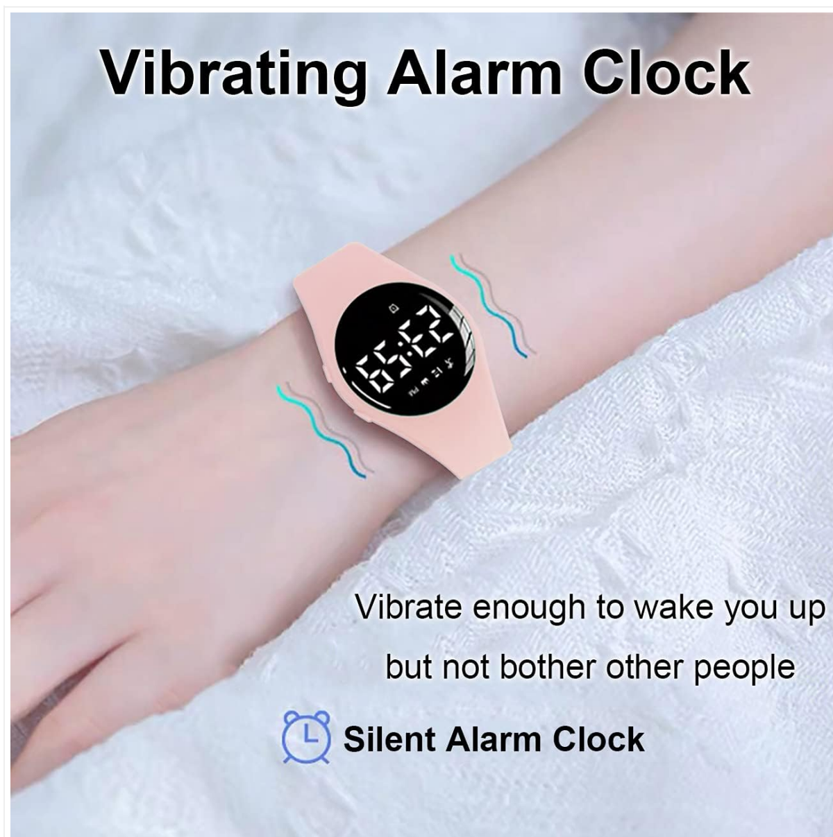
Image: A HUYVMAY Fitness Tracker T6F on a wrist, illustrating the vibrating alarm clock feature with subtle wave graphics.