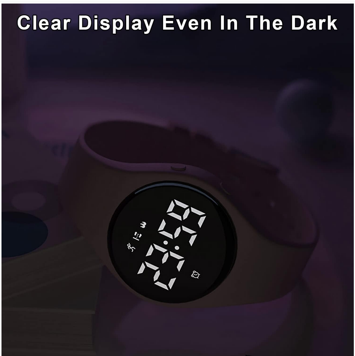
Image: The HUYVMAY Fitness Tracker T6F display illuminated and clearly visible in a dark environment.