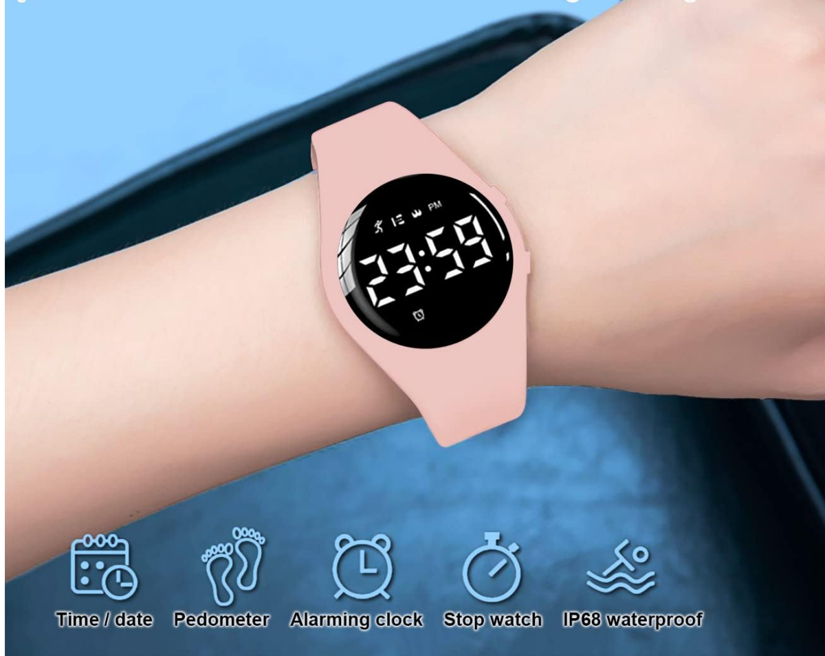
Image: A HUVMAY Fitness Tracker T6F on a wrist, displaying the pedometer function. Icons below indicate time/date, pedometer, alarming clock, stopwatch, and IP68 waterproof features.

Note: to get accurate steps/distance/calories burned data, please refer to user manual to set user's correct weight and height in watch