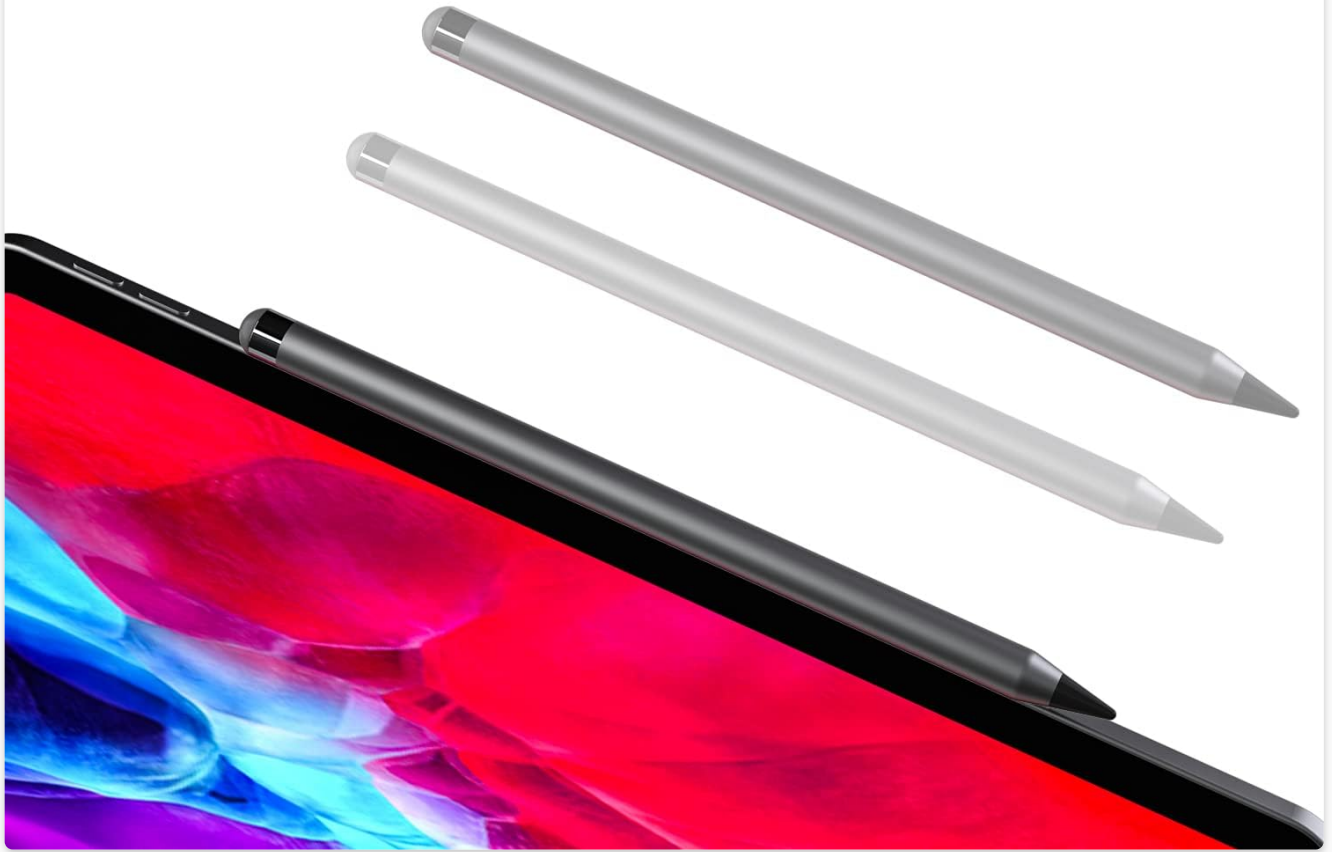
Image 5.2: The magnetic adsorption feature of the doqo Pencil AP02-GY, showing it attached to the side of an iPad.

Magnetic Design Only Support iPad PRO 11" & iPad PRO 12.9" (3gen and above) / iPad Air 4 10.9"