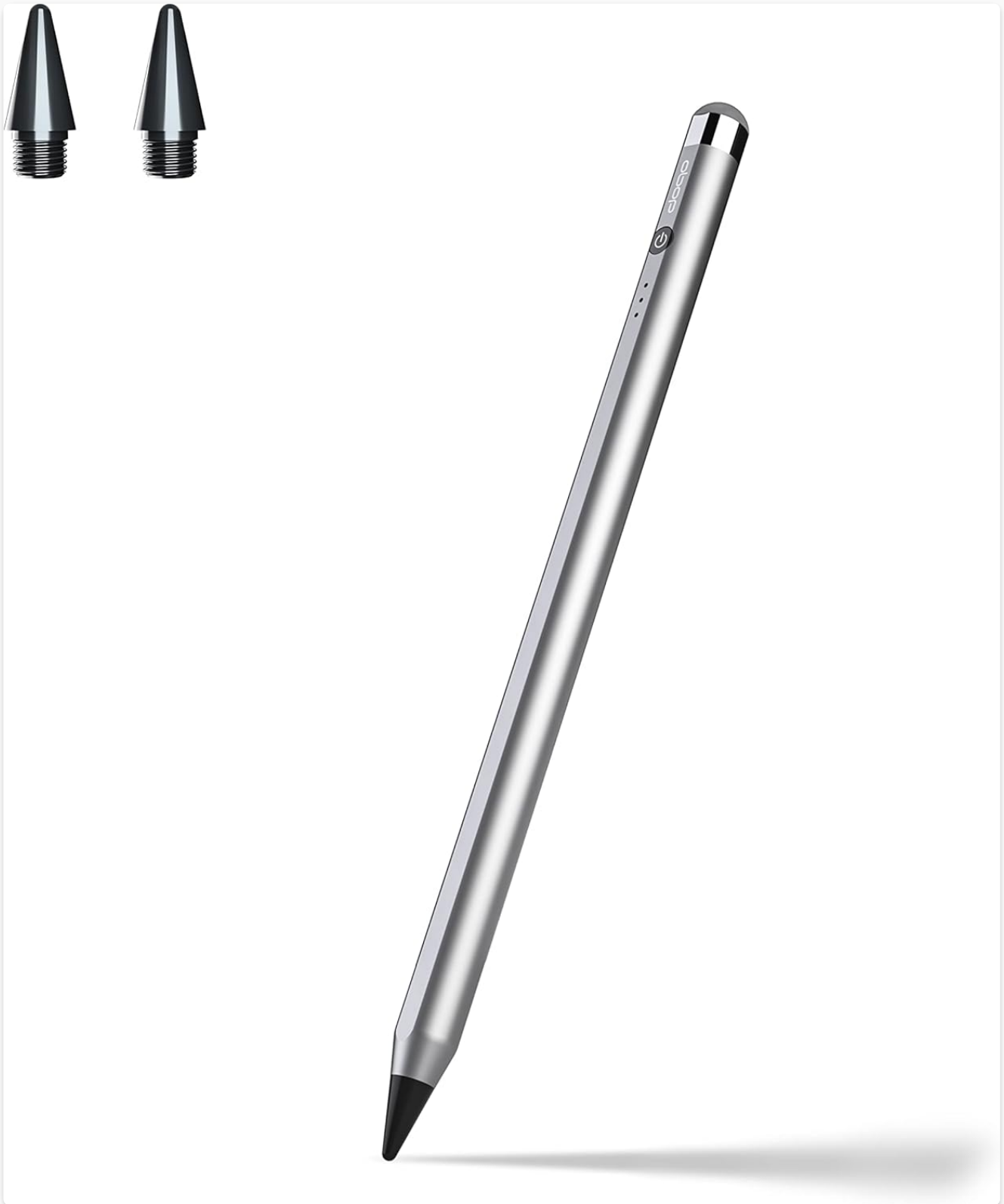
Image 1.1: The doqo Pencil AP02-GY stylus with two replacement tips.