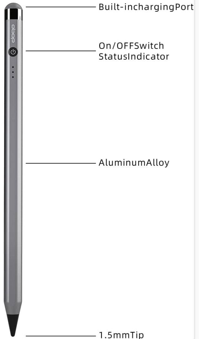
Image 4.1: Overview of the doqo Pencil AP02-GY, highlighting the power button and status indicator lights.