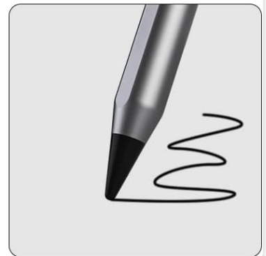
Image 5.1: The 1.2mm fine point tip of the doqo Pencil AP02-GY, demonstrating its precision for writing and drawing.