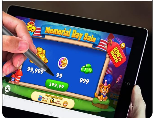
Image 5.3: Various applications of the doqo Pencil AP02-GY, including studying, browsing, drawing, and gaming.