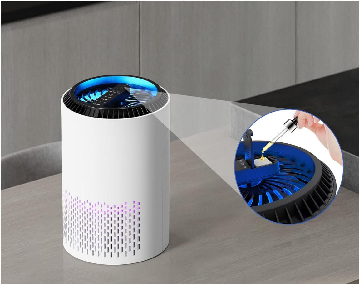
Image: A hand adding drops of essential oil into a designated aroma pad area on the top of the air purifier.