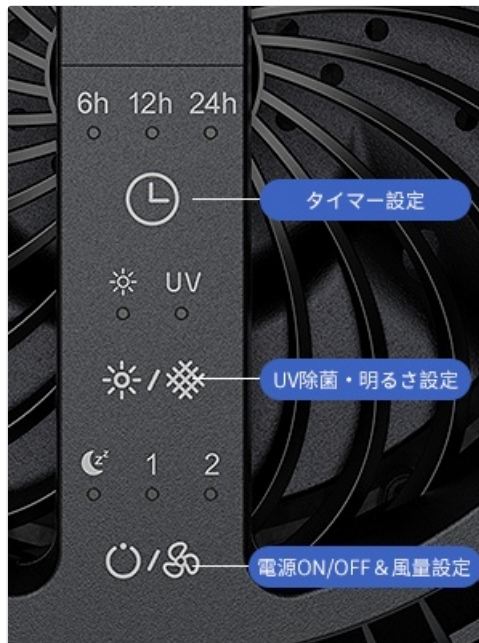
Image: Close-up view of the touch control panel, indicating buttons for timer, UV, light, and fan speed settings.