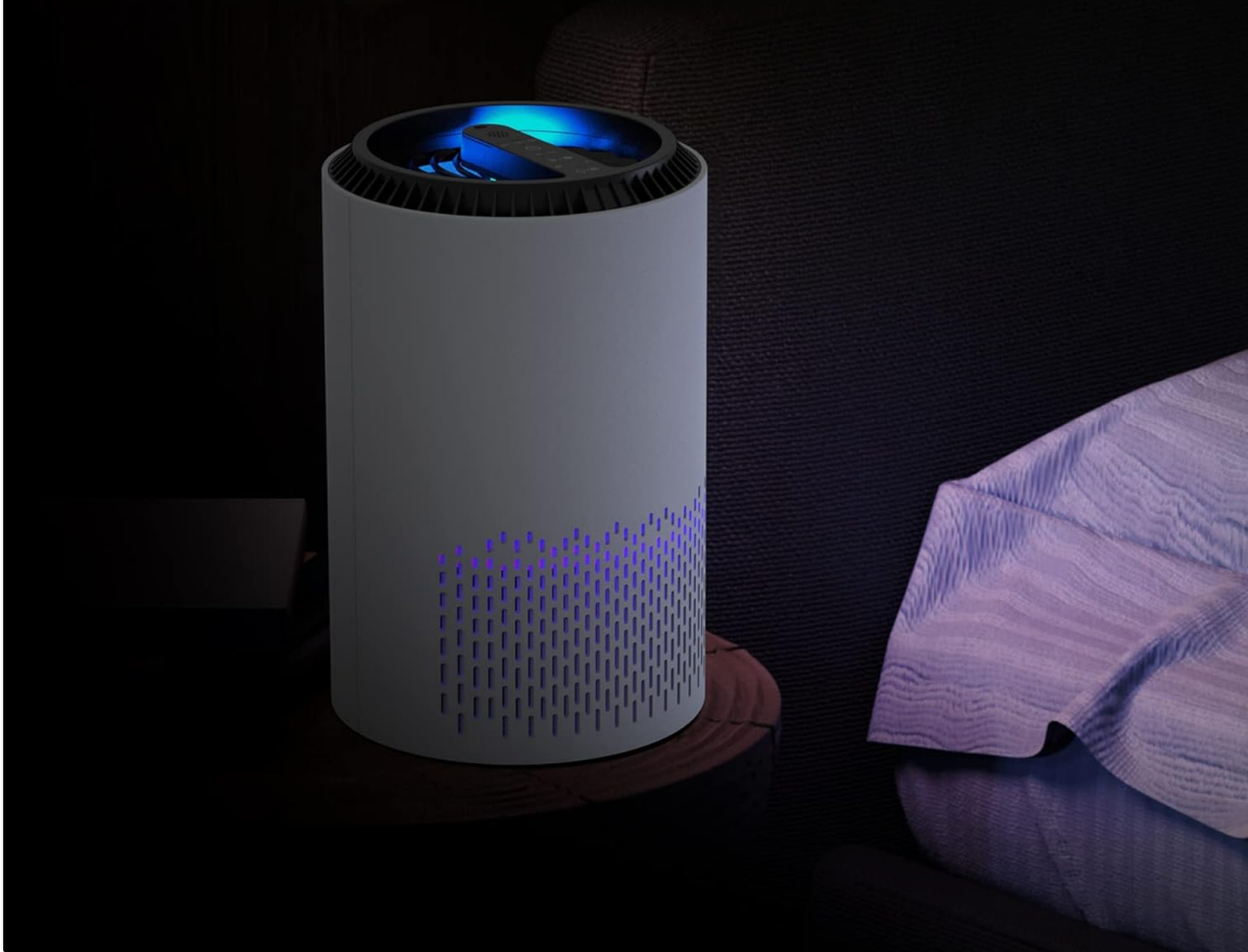
Image: The air purifier operating with its soft blue night light illuminated, placed on a bedside table in a dimly lit room.

電源をつけるとオシャレなブルーライトが点灯 おやすみ時におすすめ 気になる時も消灯できます