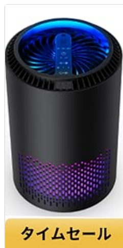
Image: The air purifier, power cable, and user manual as typically included in the product package.