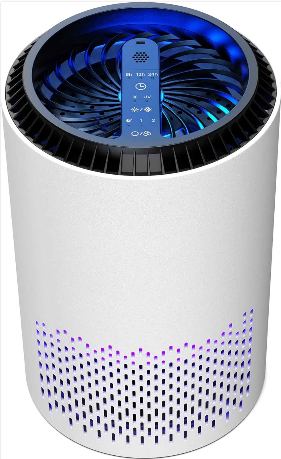
Image: The SANVINDER DH-JH01 Compact Air Purifier, showing its cylindrical design and top control panel.