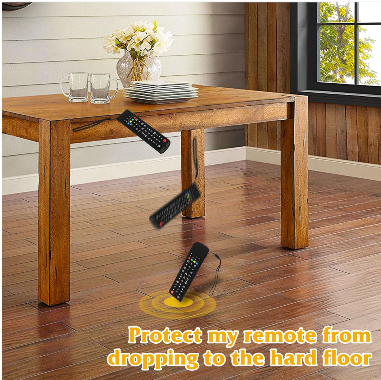
Figure 7: The silicone case provides protection against drops. The remote also features an adjustable anti-lost wrist strap to prevent misplacement.