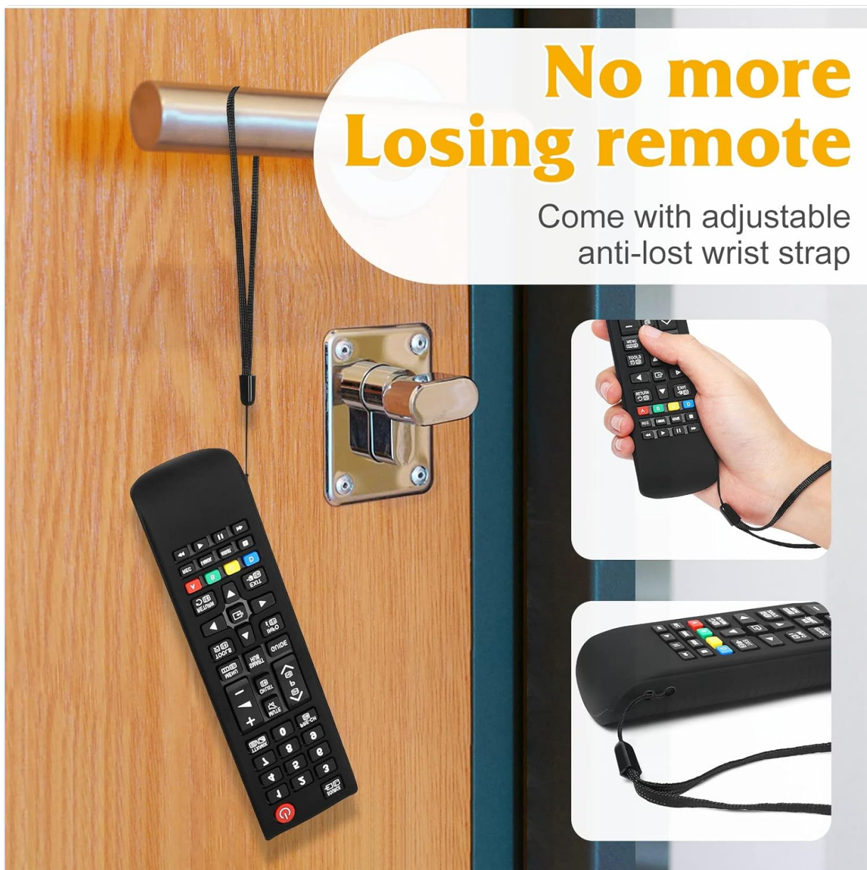
Figure 8: The wrist strap helps prevent losing the remote.