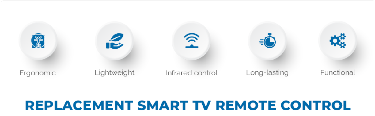
Figure 9: Key features of the UrbanX Universal Remote Control.