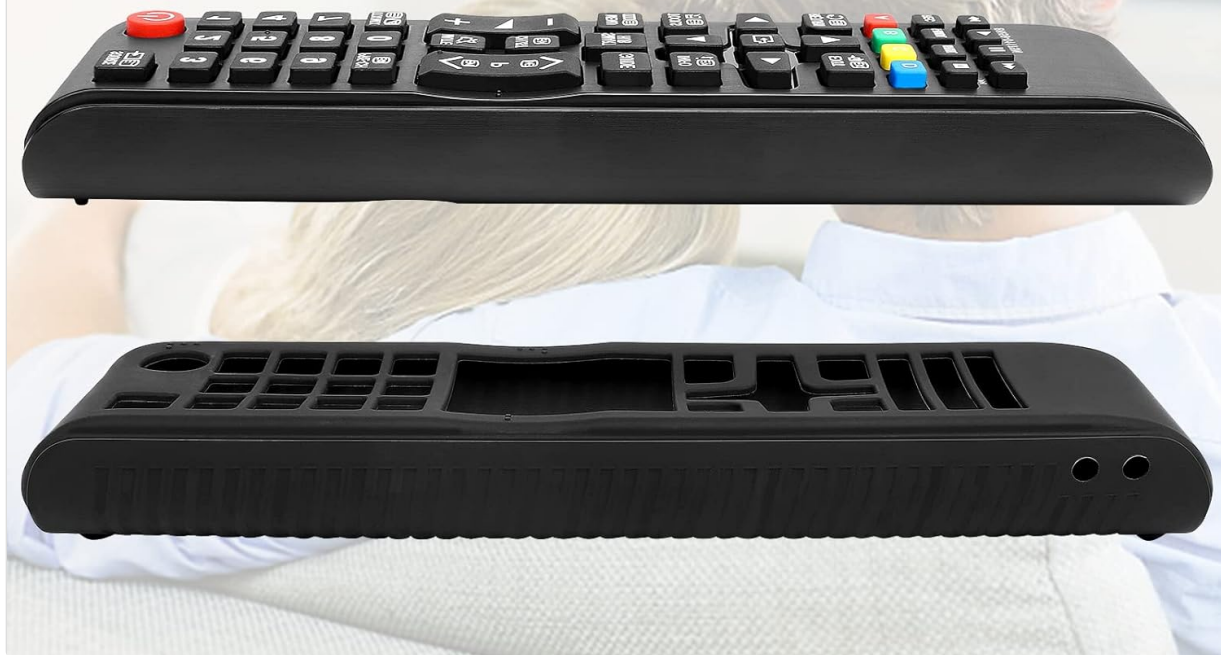
Figure 3: Features of the silicone protective case.