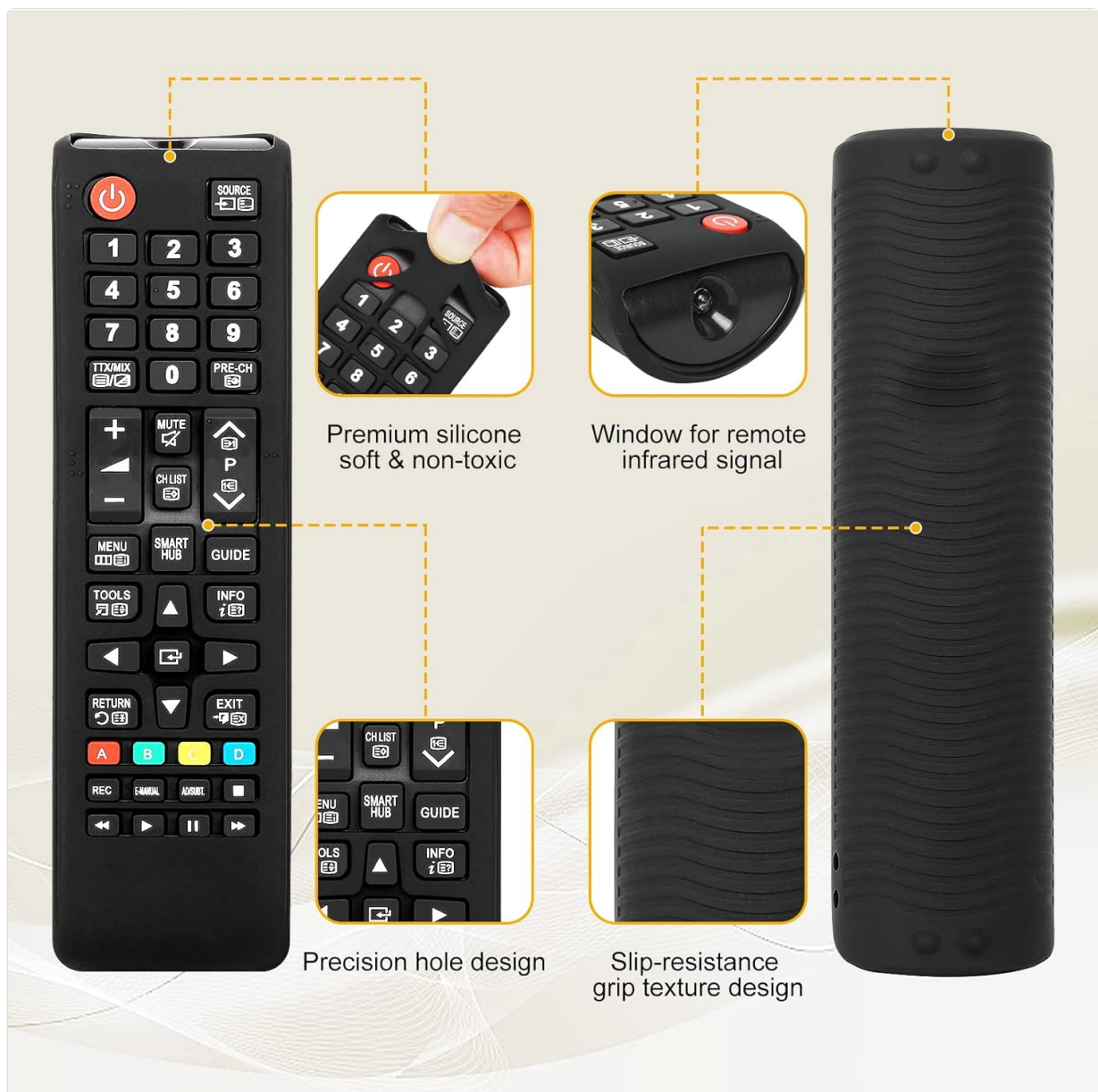
Figure 4: Detailed view of remote features and case application.