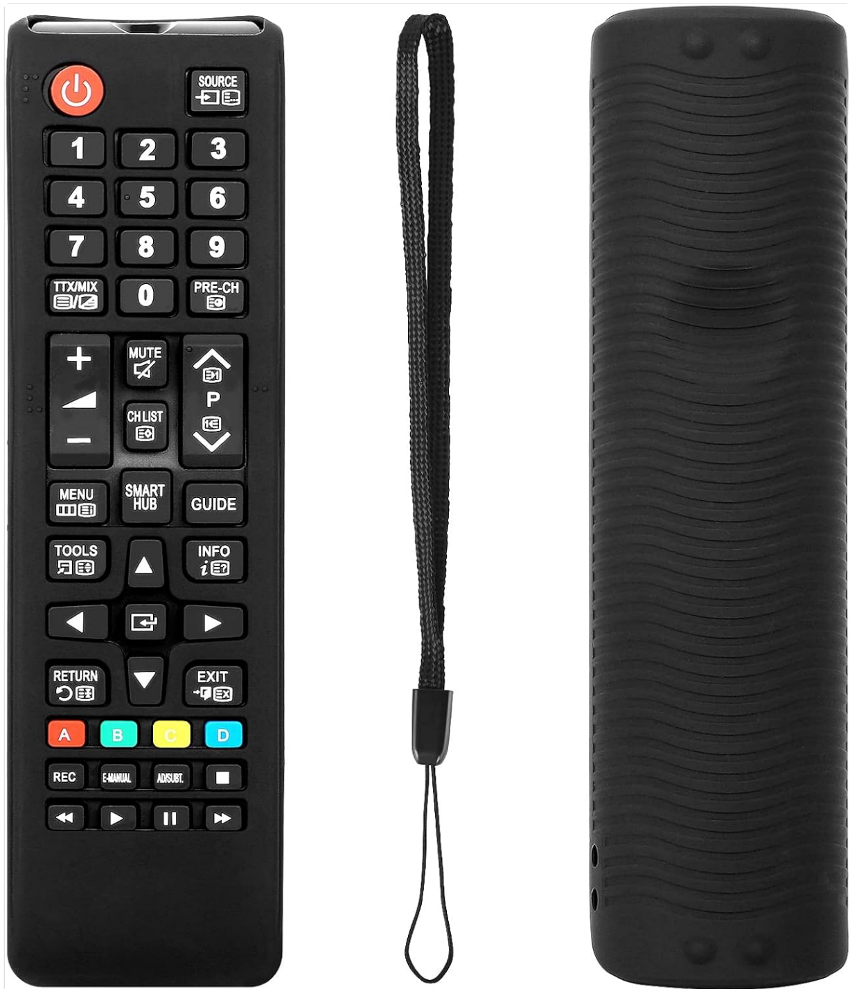
Figure 2: Contents of the UrbanX Universal Remote Control package.