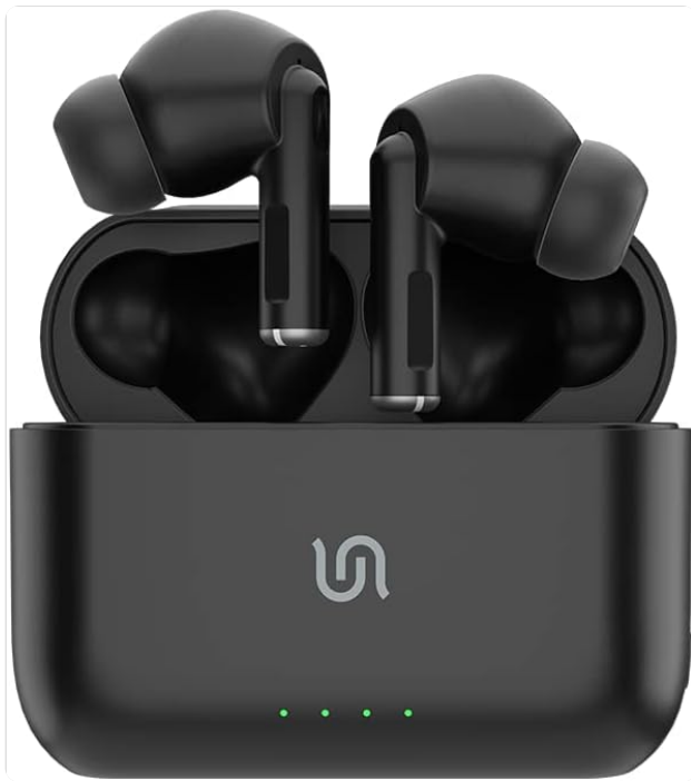
Figure 1: Earbuds seated in their charging case, showing the overall design and charging indicators.