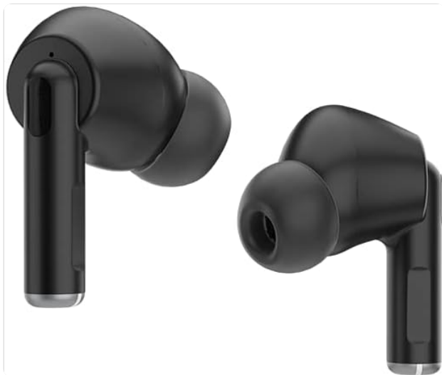
Figure 2: Individual earbuds, highlighting their ergonomic design and touch control areas.