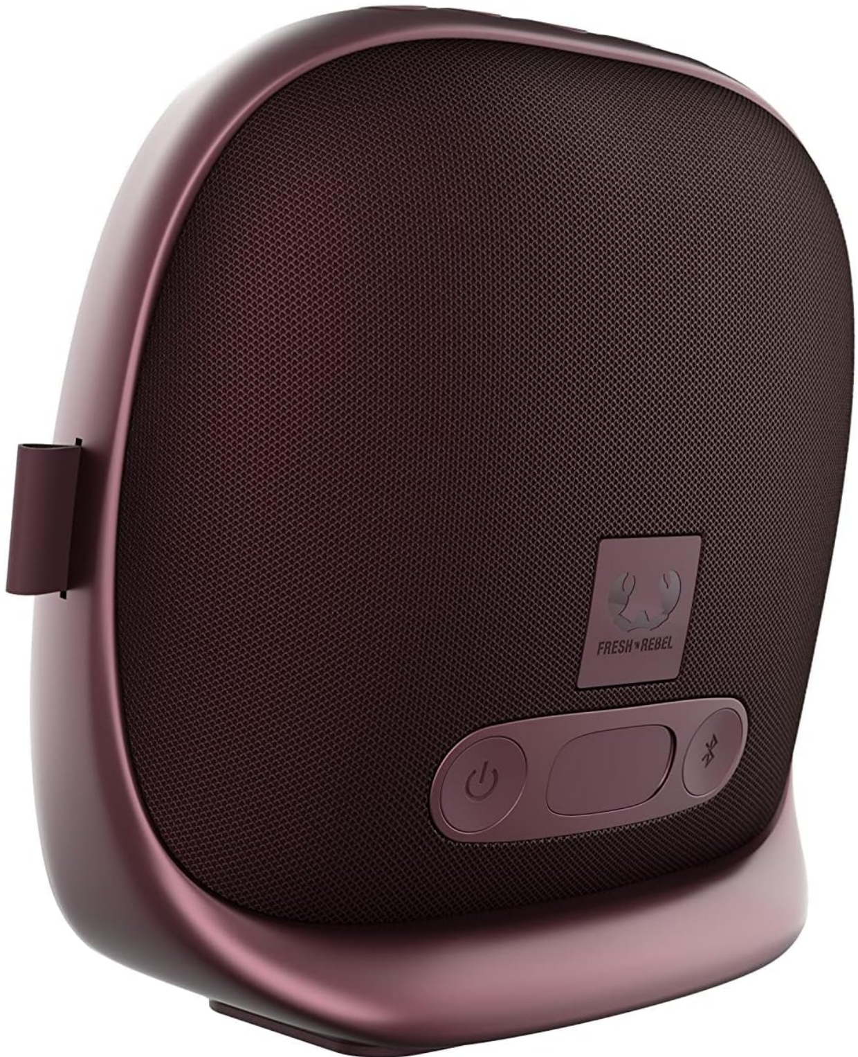
Rear view of the speaker, highlighting the power and Bluetooth pairing buttons, and the USB-C charging port.

3.5mm Audio Input (AUX): For wired audio connection.