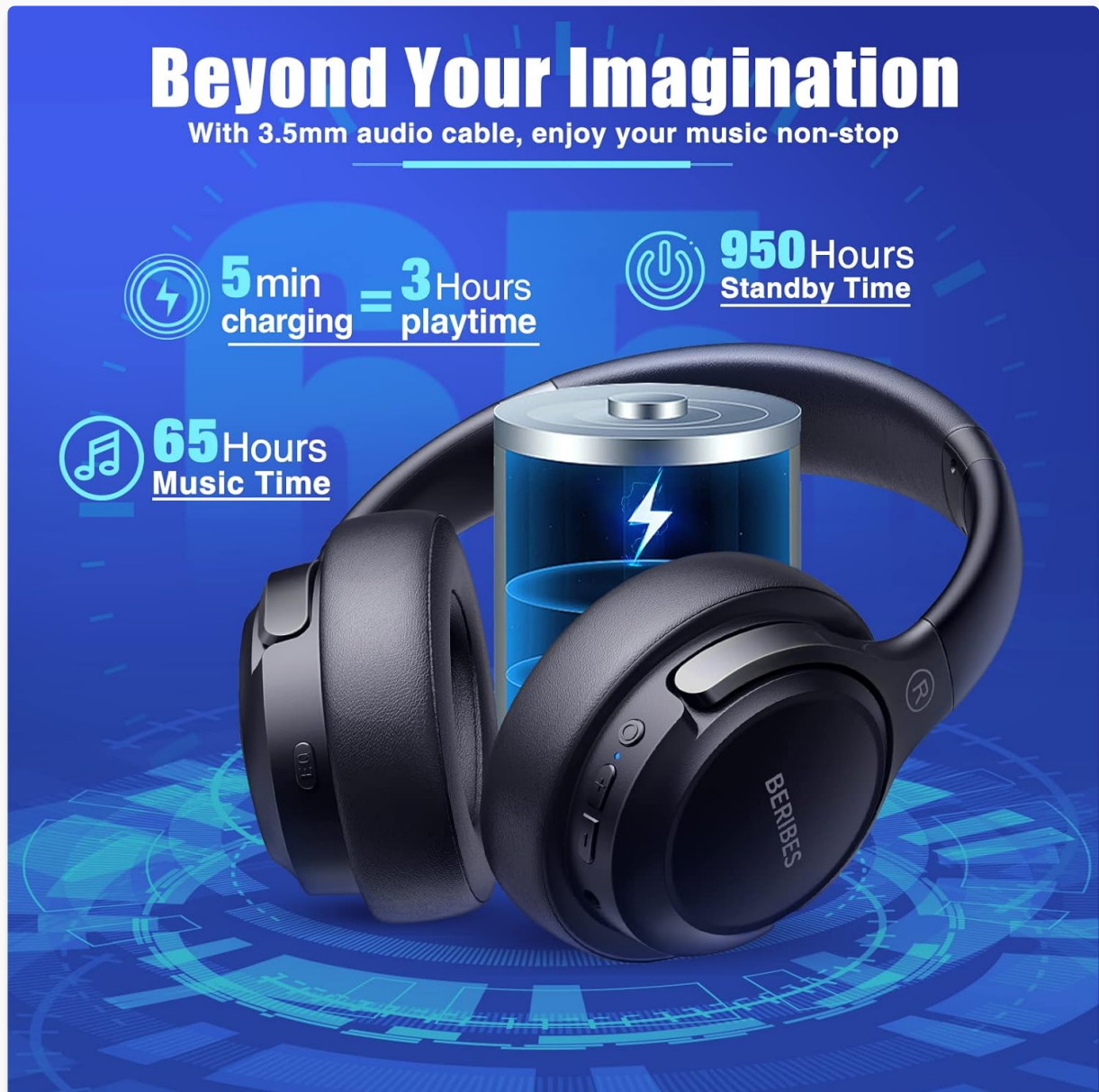
Image: Visual representation of the BERIBES headphones' extended battery life, highlighting 65 hours of music time and 950 hours of standby time.