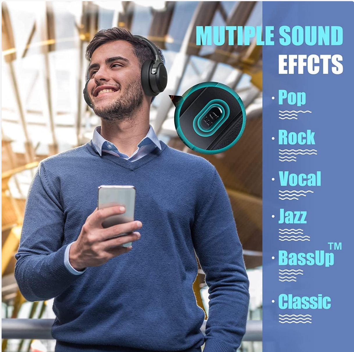
Image: Illustration showing the BERIBES headphones' multiple sound effects, including Pop, Rock, Vocal, Jazz, BassUp, and Classic EQ modes.