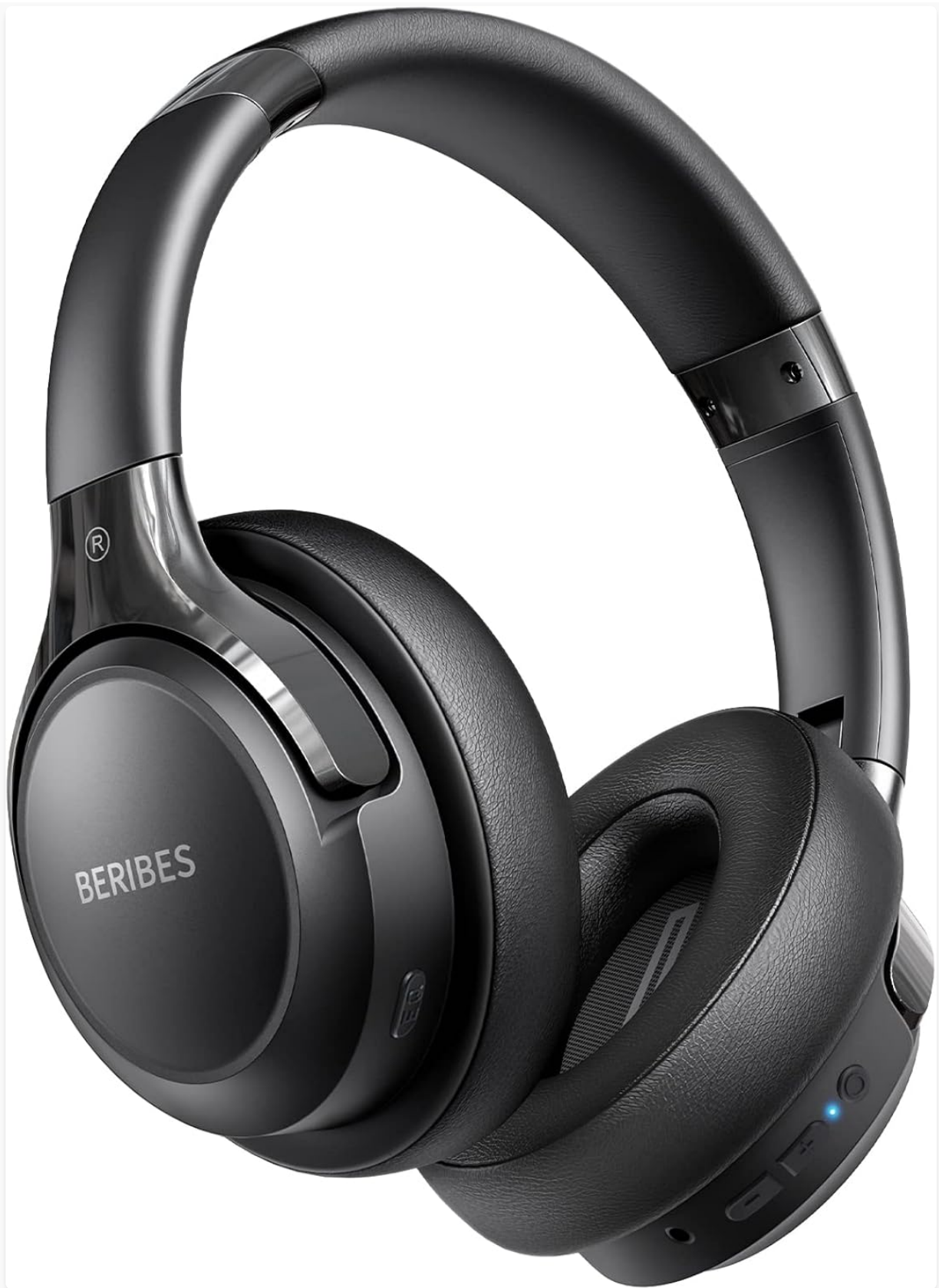
Image: The BERIBES Bluetooth Headphones in black, showcasing their sleek over-ear design.