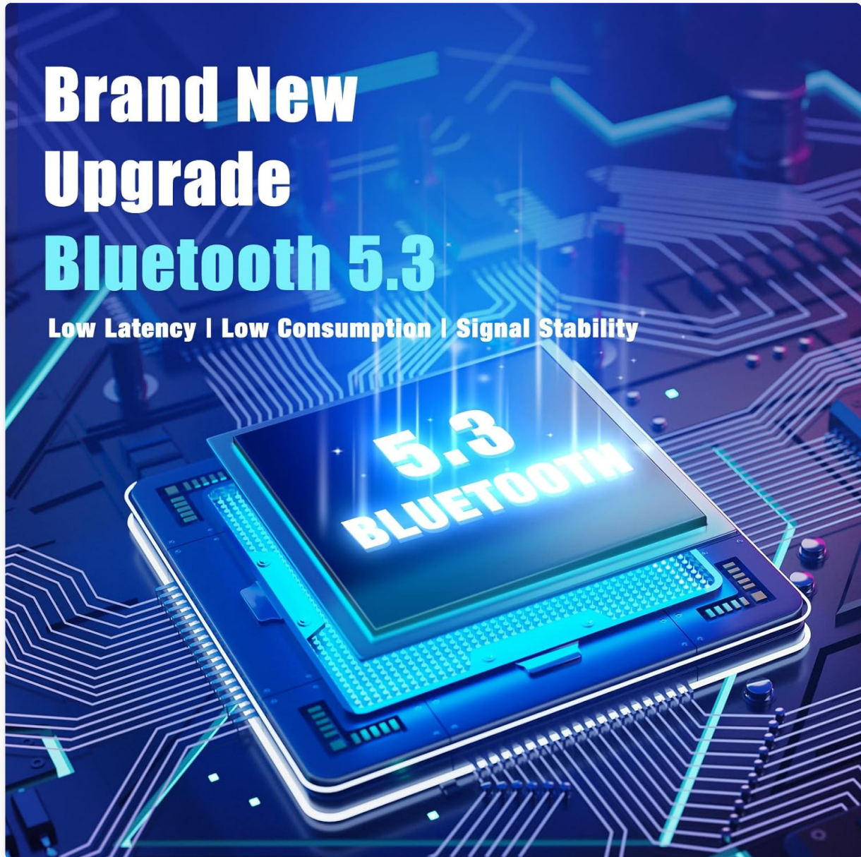
Image: A visual representation of the advanced Bluetooth 5.3 chip, emphasizing low latency, low power consumption, and signal stability.