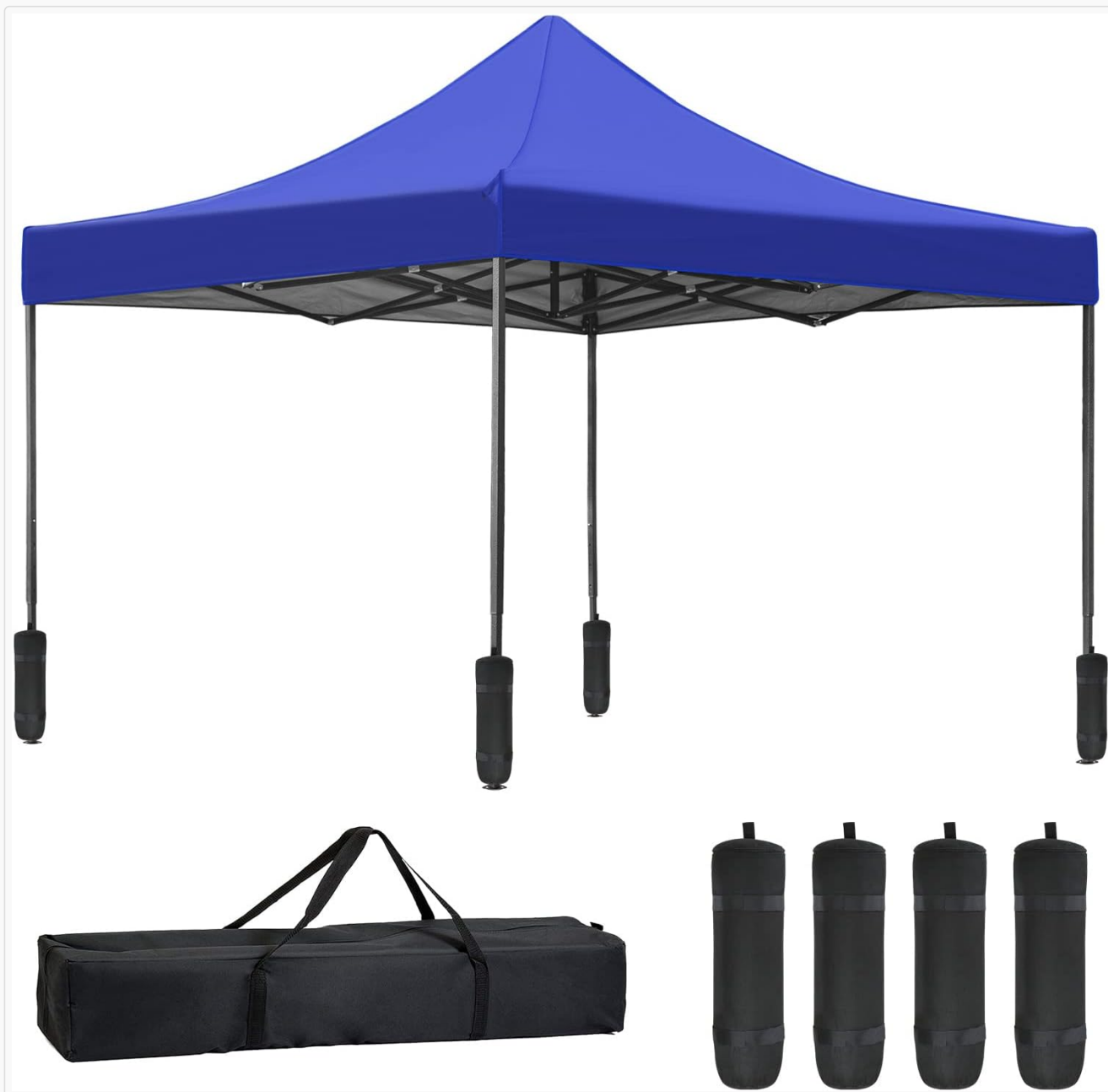
Image 3.1: Complete package contents including the canopy tent, carrying bag, and four sandbags.