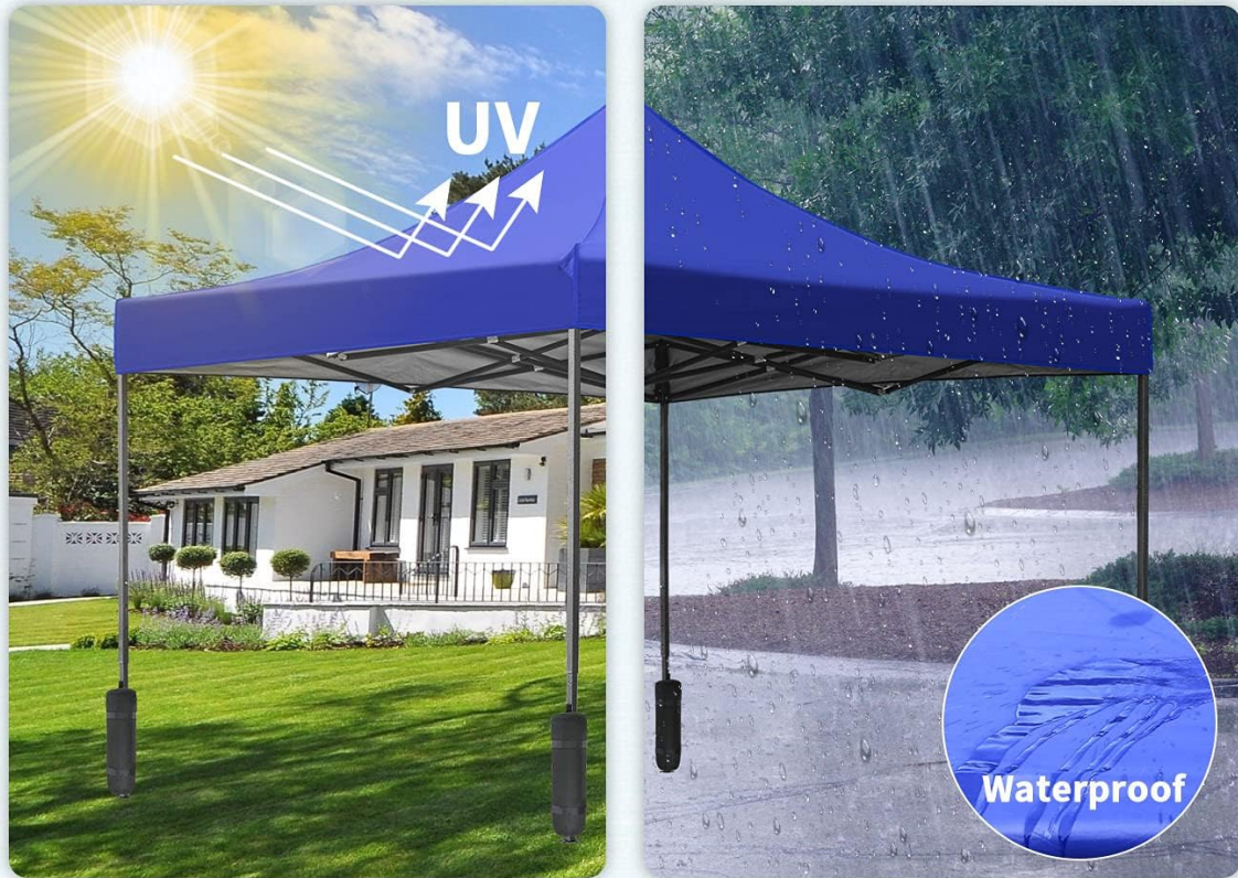
Image 9.2: Visual representation of the canopy's UV protection and water-resistant properties.

The fabric can effectively waterproof and UV