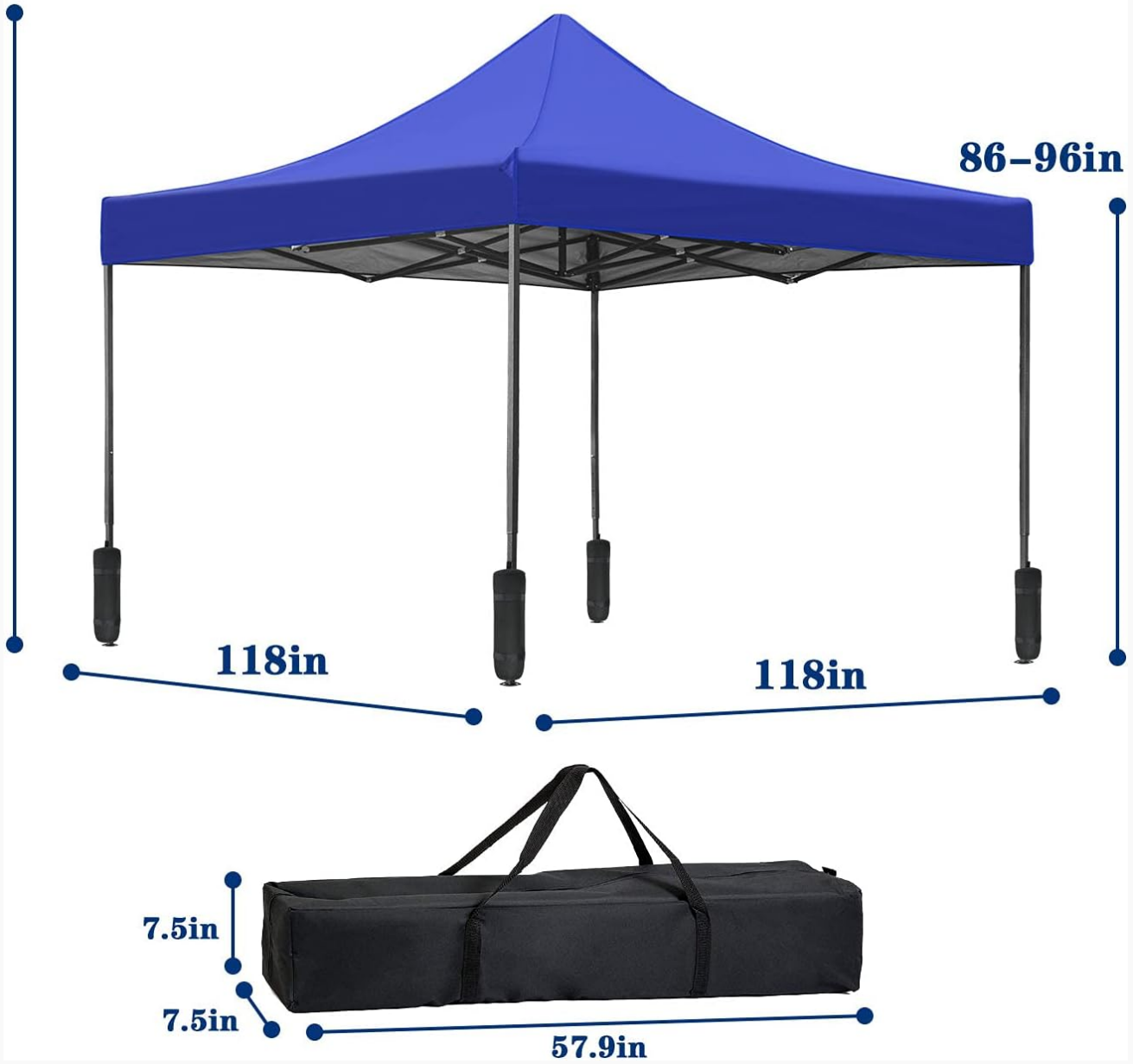
Image 9.1: Dimensional overview of the canopy tent and its folded carrying bag.