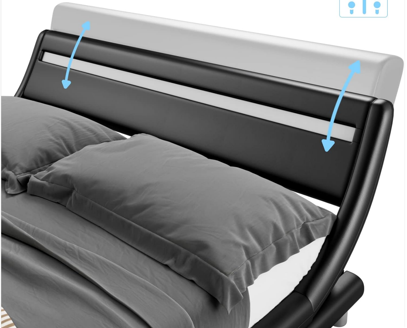
Image: The bed frame with its LED headboard, demonstrating the auto timing mode where lights can be set to turn on or off at specific times.