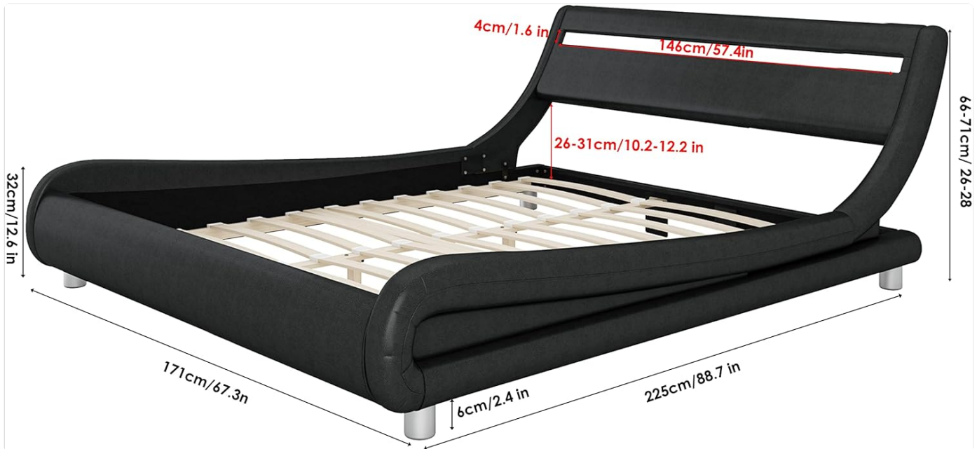
Image: A detailed diagram illustrating the dimensions of the bed frame, including length, width, and headboard height, along with slat support structure.