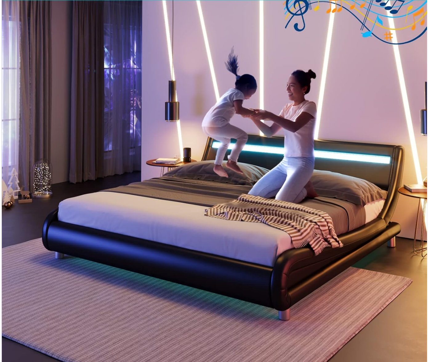
Image: The LED headboard lights dynamically changing colors in sync with music, illustrating the music sync mode feature.