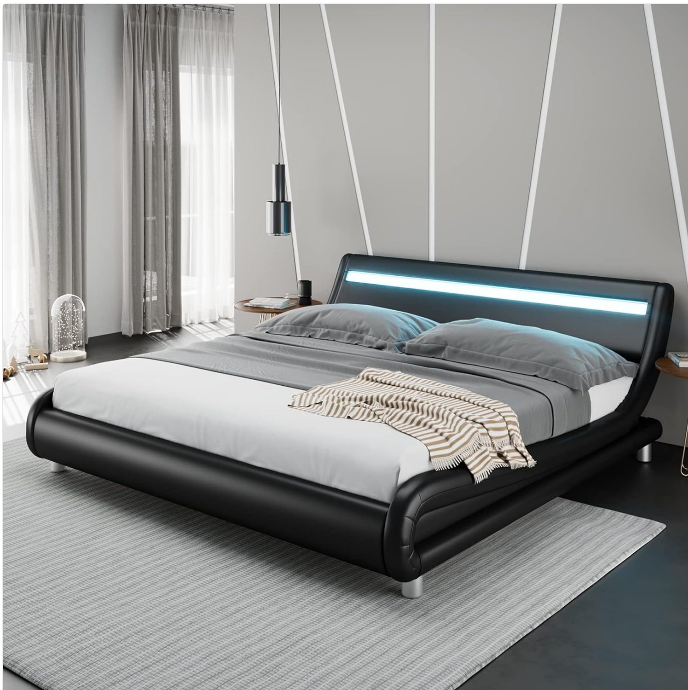
Image: The Keyluv Upholstered Queen LED Bed Frame, showcasing its sleek design and illuminated headboard in a modern bedroom environment.