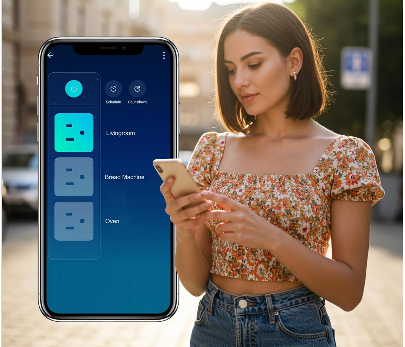
Figure 5.1: App Control Interface. The GHome app allows for individual control of each smart outlet and the USB ports, enabling precise management of connected devices.