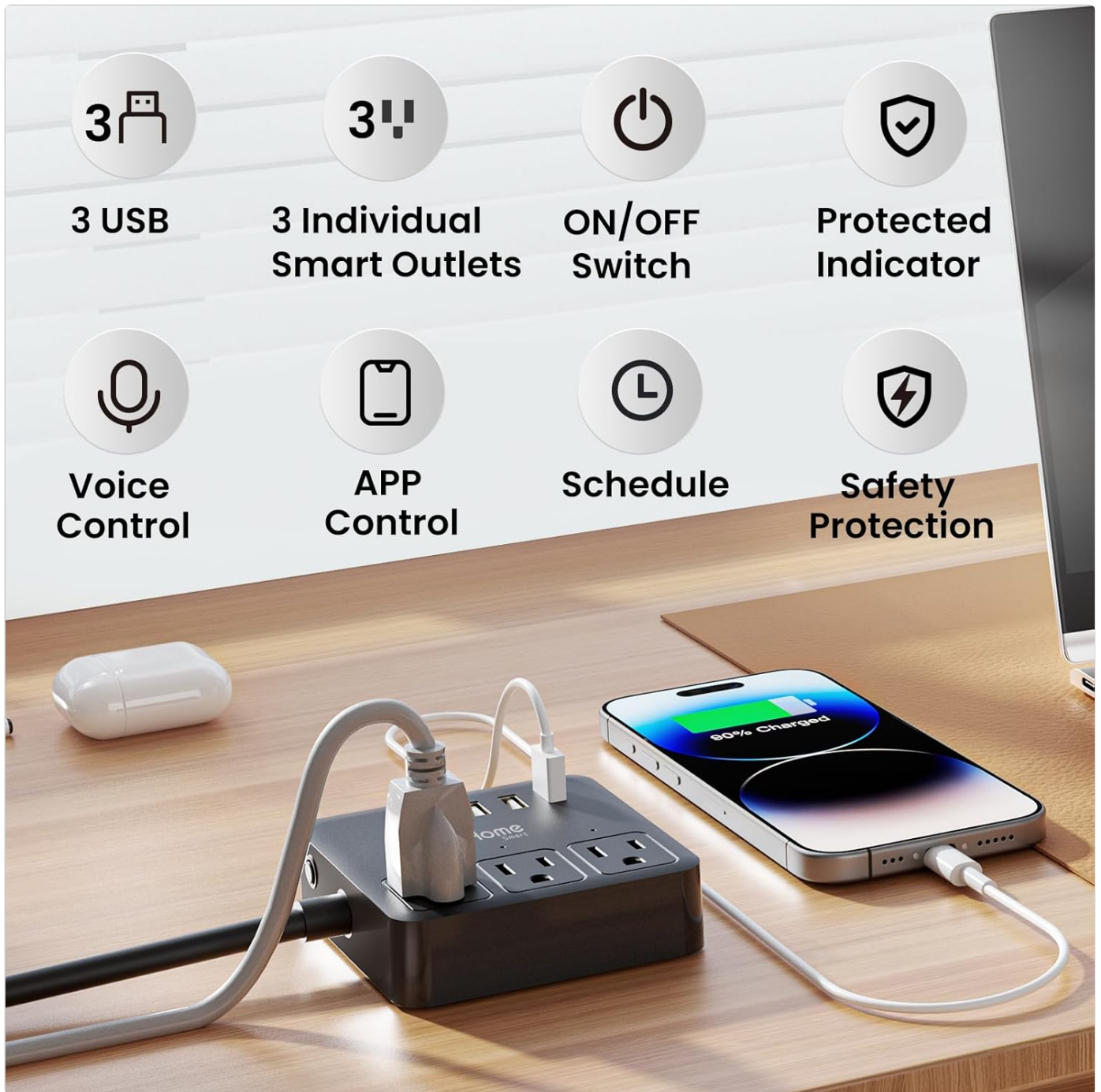
Figure 3.1: Overview of GHome Smart Power Strip features, including USB ports, individual smart outlets, physical switch, protected indicator, voice control, app control, scheduling, and safety protection.