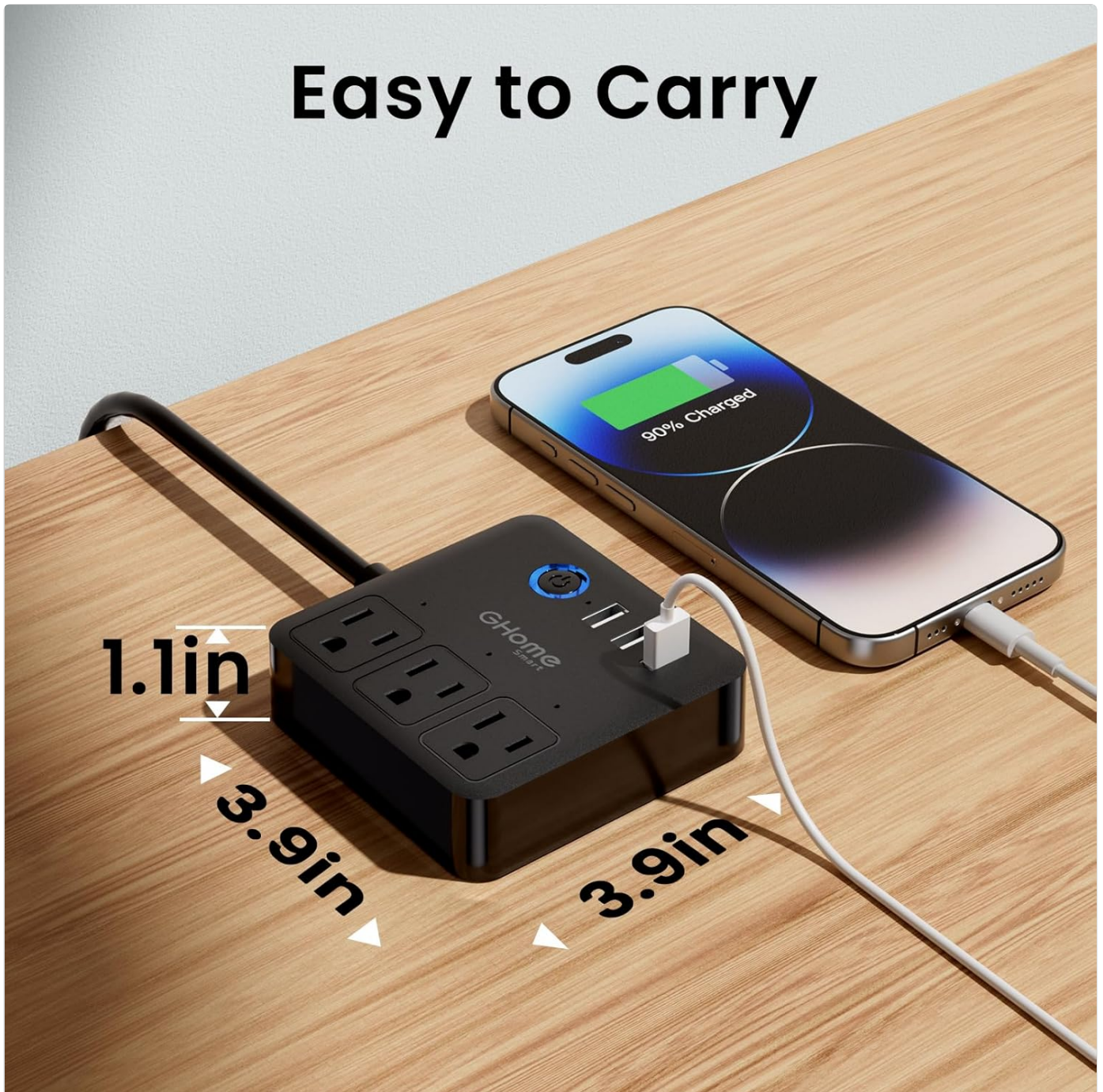
Figure 3.2: The compact design of the GHome Smart Power Strip, measuring 3.9 inches by 3.9 inches by 1.1 inches, makes it easy to carry and suitable for various settings.