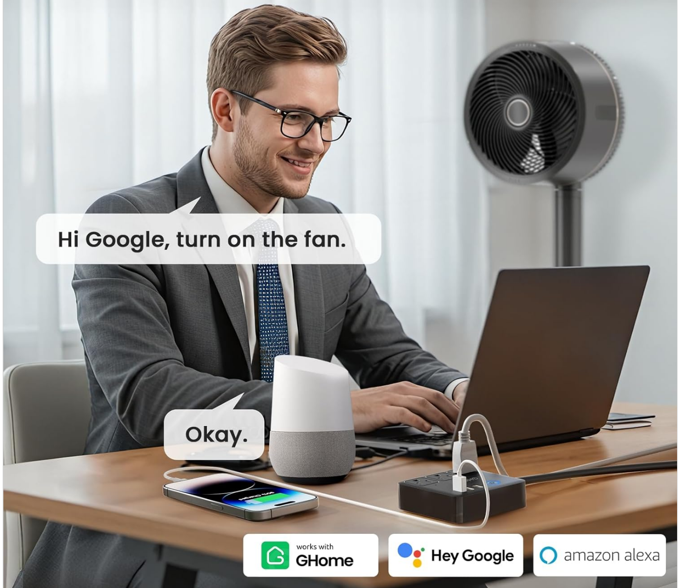
Figure 5.2: Voice Control in Action. A user commands a Google Home device to turn on a fan, demonstrating hands-free control of devices connected to the GHome Smart Power Strip.