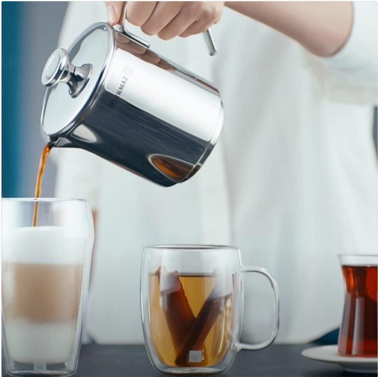
Image: Brewed beverage being poured from the top teapot into serving cups, showcasing the product in use.