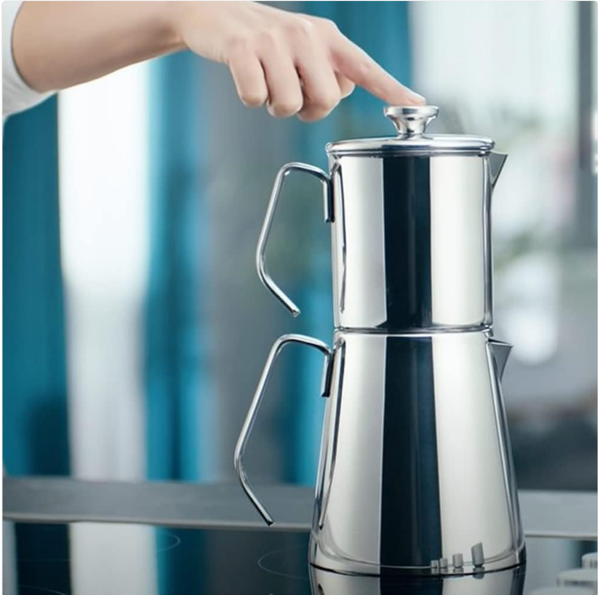
Image: A hand demonstrating the pressing action of the French press lid, used for brewing coffee or herbal tea.