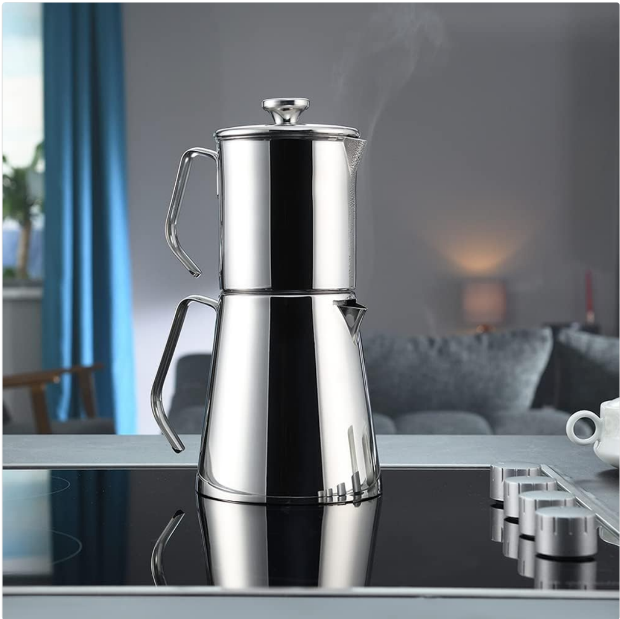
Image: The Korkmaz A225 Aqua Teapot Set placed on an induction stovetop, demonstrating its compatibility with various heat sources.