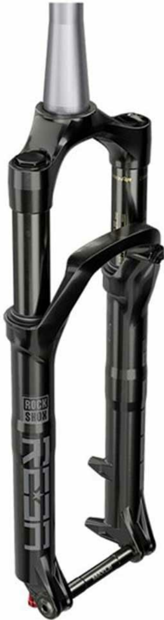
Image: The RockShox Reba RL Suspension Fork, showing its overall design.