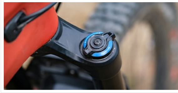
Image: Detail of the blue compression and lockout adjuster knob on the fork crown.