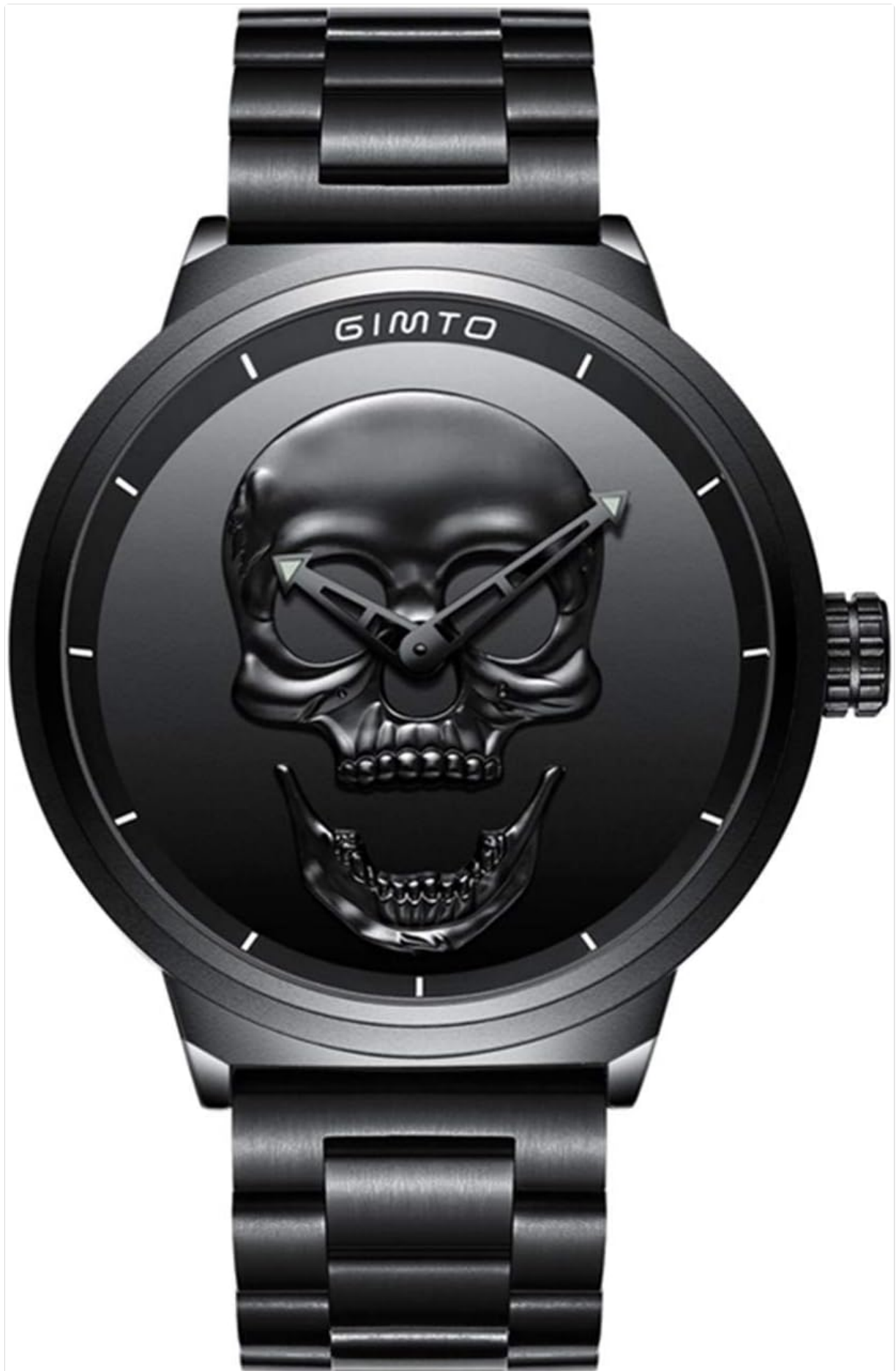
Figure 1: Front view of the Universal Stainless Steel Skull Watch. This image displays the watch face with its prominent skull design and stainless steel strap.