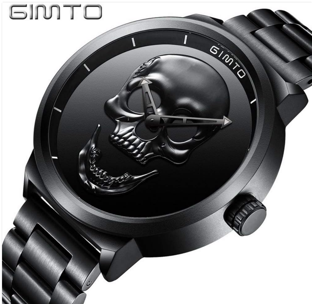
Figure 2: Close-up view of the watch dial, highlighting the stereoscopic skull design and the luminous hour and minute hands.

This watch operates on a quartz movement, providing accurate timekeeping. The luminous hands absorb light and glow in the dark, allowing for easy time reading in low-light conditions.