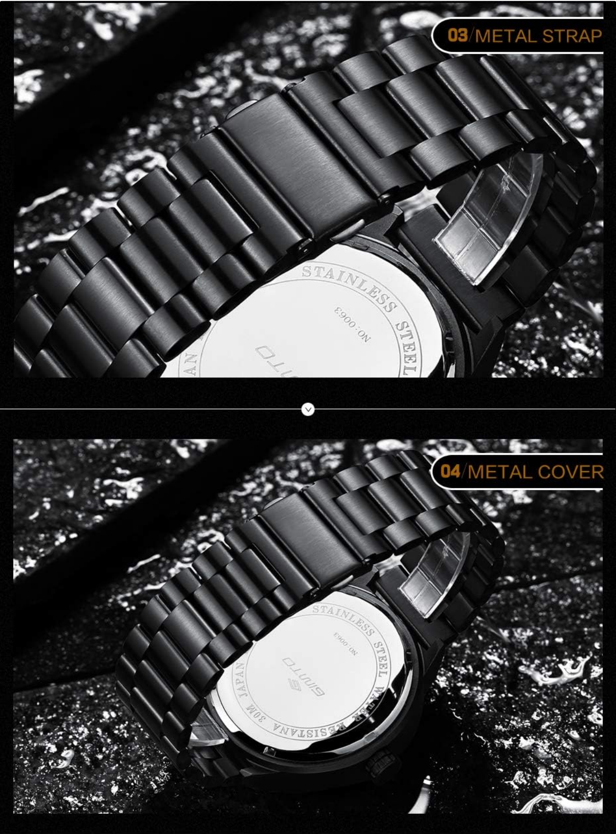
Figure 3: Rear view of the watch, displaying the stainless steel case back and the clasp mechanism of the stainless steel strap.