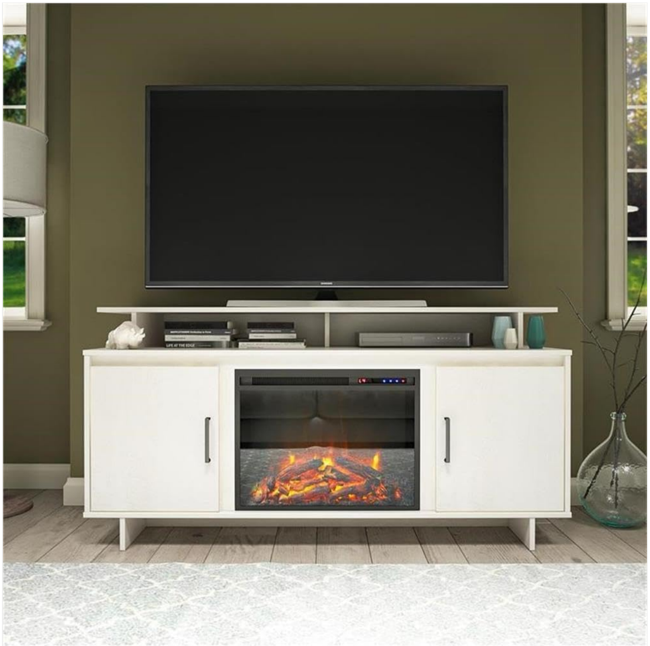
Image: The console integrated into a living room setting with a television.