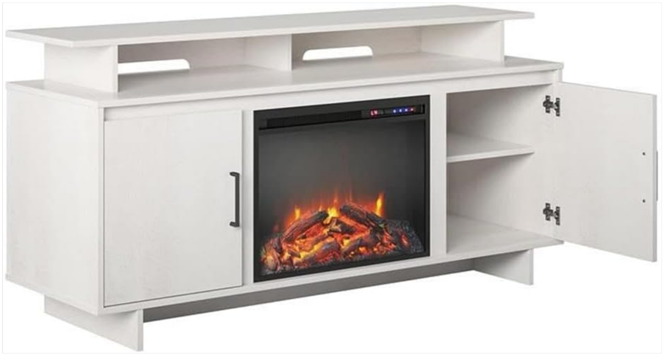
Image: Console with an open cabinet door, illustrating internal storage.