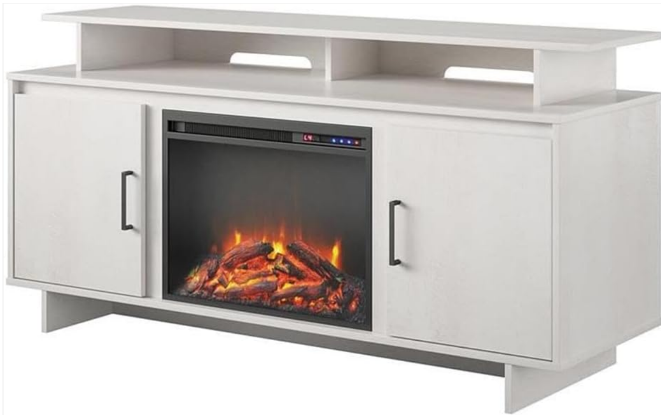
Image: The Ameriwood Home Merritt Avenue Electric Fireplace TV Console in Ivory Oak finish.

This manual provides detailed instructions for the assembly, operation, and maintenance of your Ameriwood Home Merritt Avenue Electric Fireplace TV Console. This unit is designed to accommodate flat-screen televisions up to 74 inches and 120 lbs, offering both media storage and an electric fireplace for supplemental heating and ambiance.