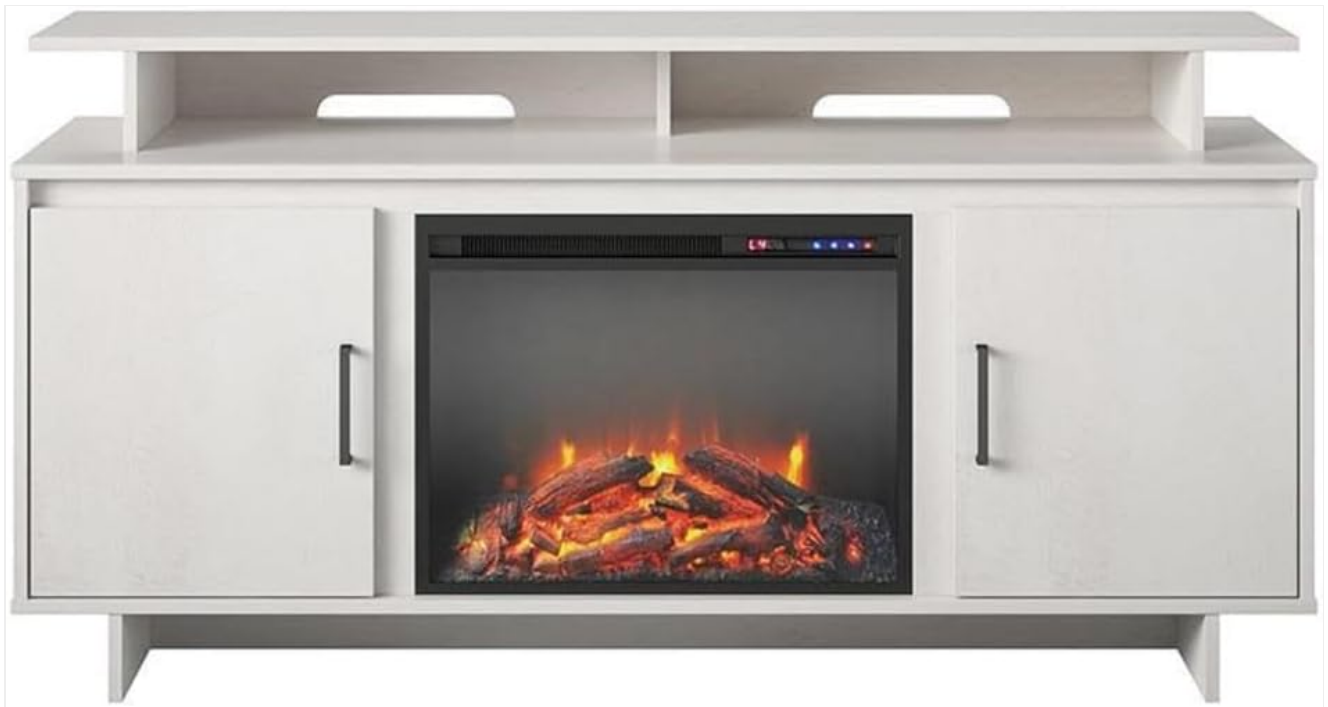
Image: Close-up of the electric fireplace insert with illuminated flames and control panel.