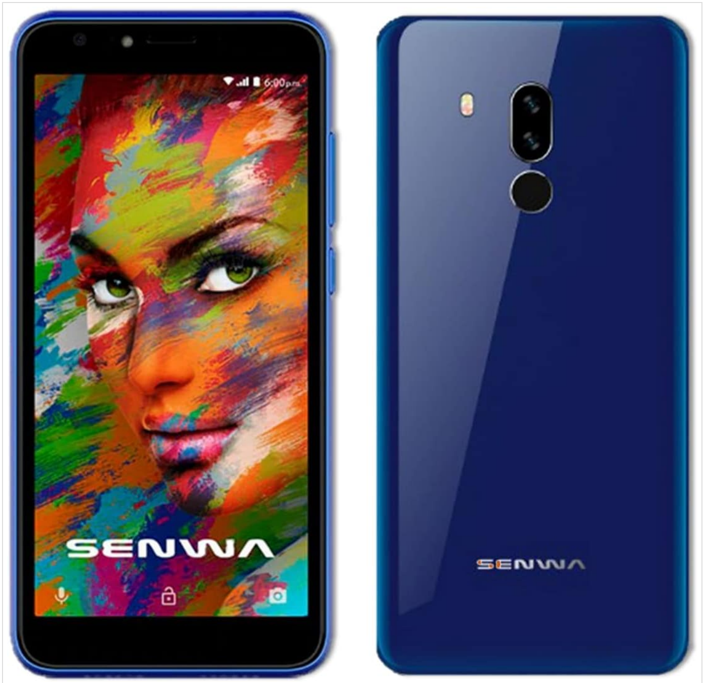
Image: Front and back views of the Azumi Senwa LS5018FP smartphone. The front shows the display, earpiece, and front camera. The back highlights the dual rear cameras, LED flash, and fingerprint sensor.

Familiarize yourself with the physical components of your Senwa LS5018FP smartphone.