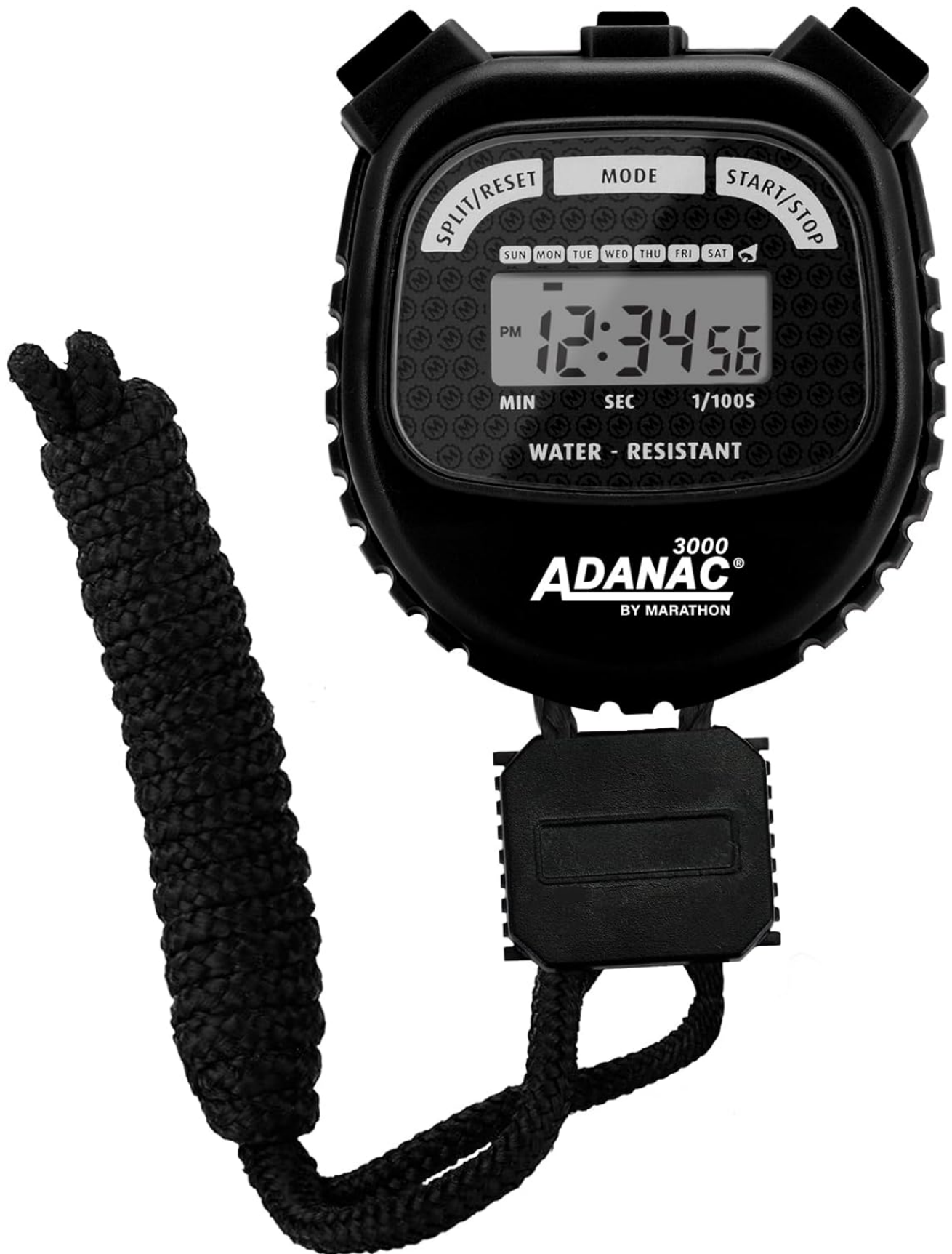
The Marathon Adanac 3000 Digital Stopwatch Timer, featuring a clear display and an attached lanyard.