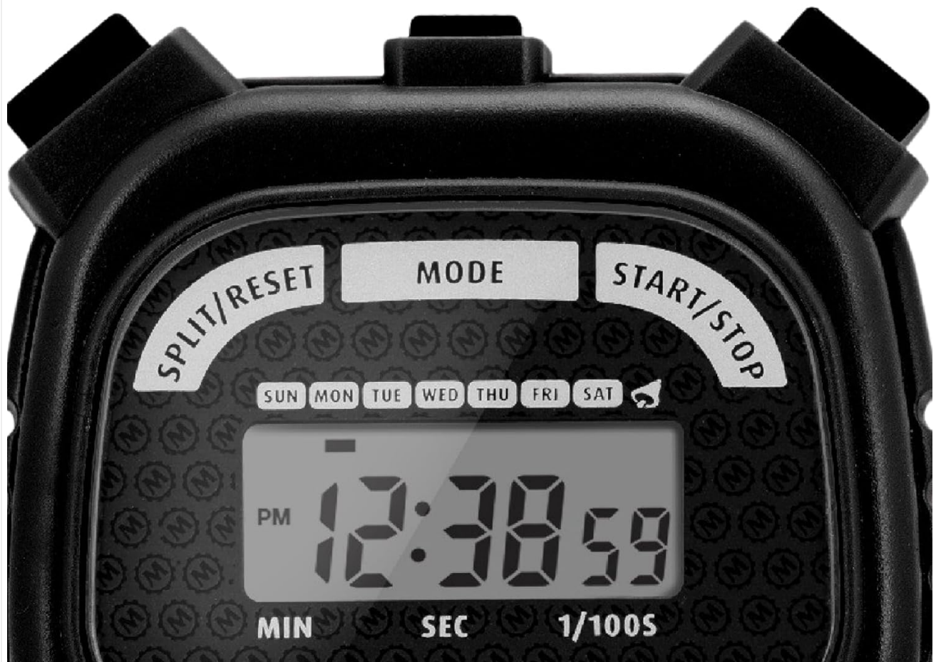
Detailed view of the stopwatch's dynamic display, showing time and calendar functions.

Time/Calendar displays the hour, minute, seconds, date, day & alarm.