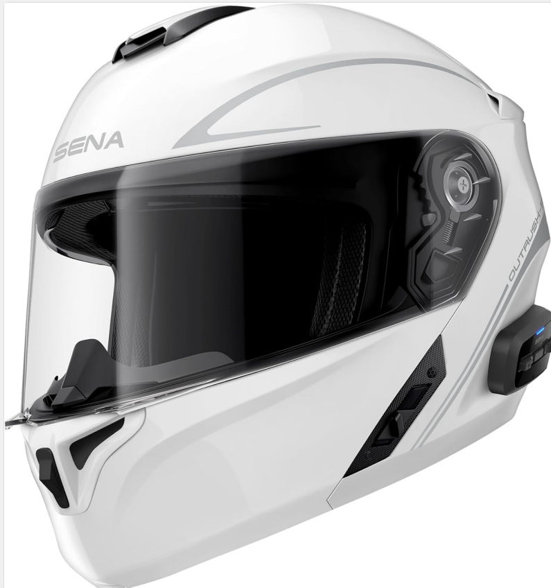
Image: Sena Outrush R helmet in gloss white, showcasing its modular design and integrated Bluetooth system.