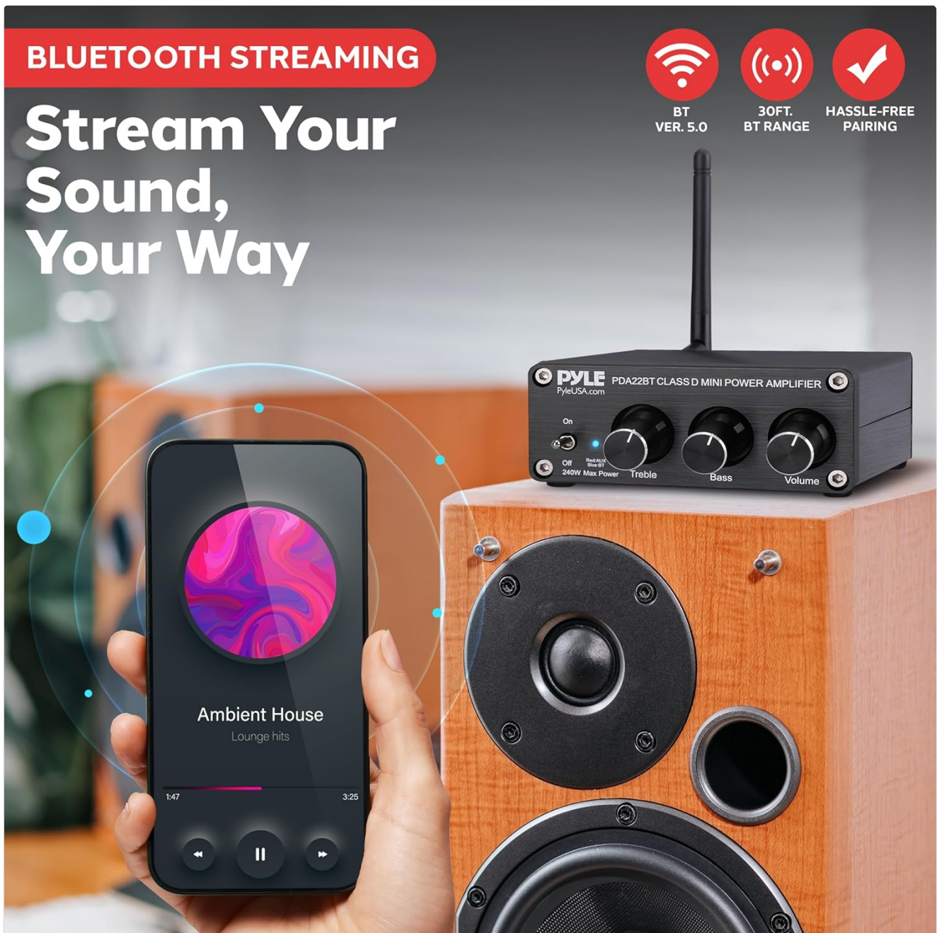
Figure 6.2: A smartphone displaying a music player interface, wirelessly connected to the Pyle PDA22BT amplifier via Bluetooth for audio streaming.