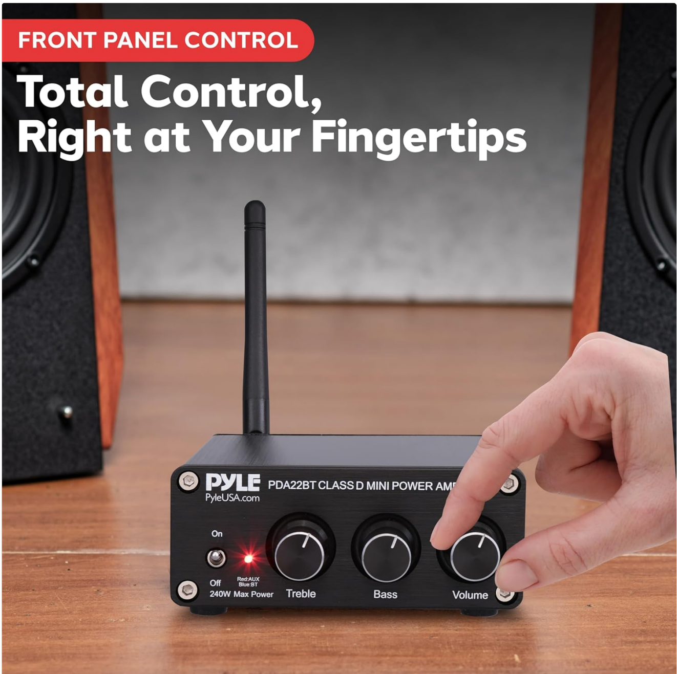
Figure 6.1: A hand demonstrating the adjustment of the volume knob on the amplifier's front panel.