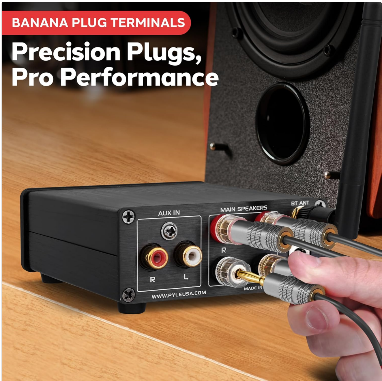
Figure 5.1: Illustration of connecting speaker cables with banana plugs to the amplifier's main speaker terminals.