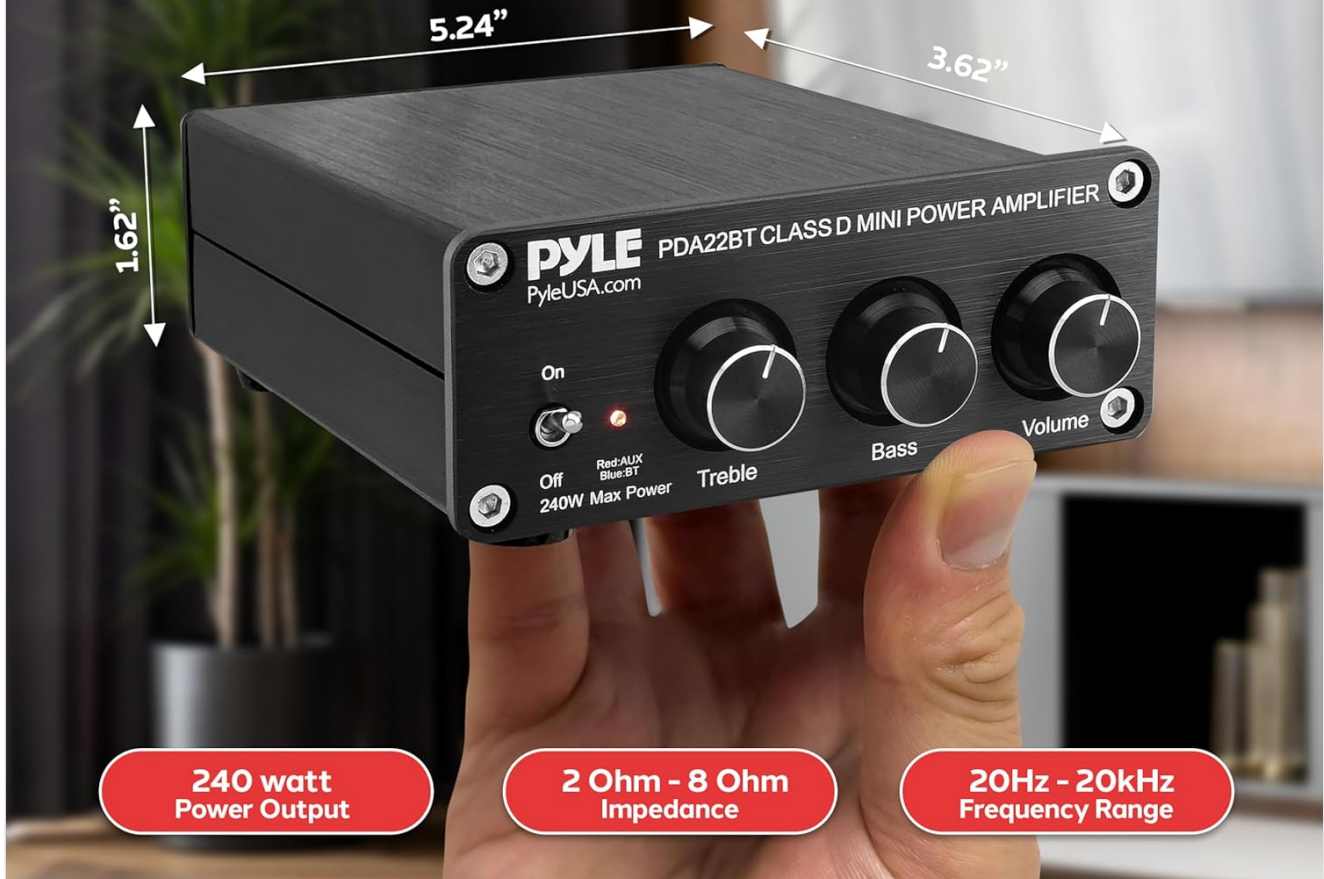
Figure 9.1: The Pyle PDA22BT amplifier with its key dimensions (length, width, height) indicated.