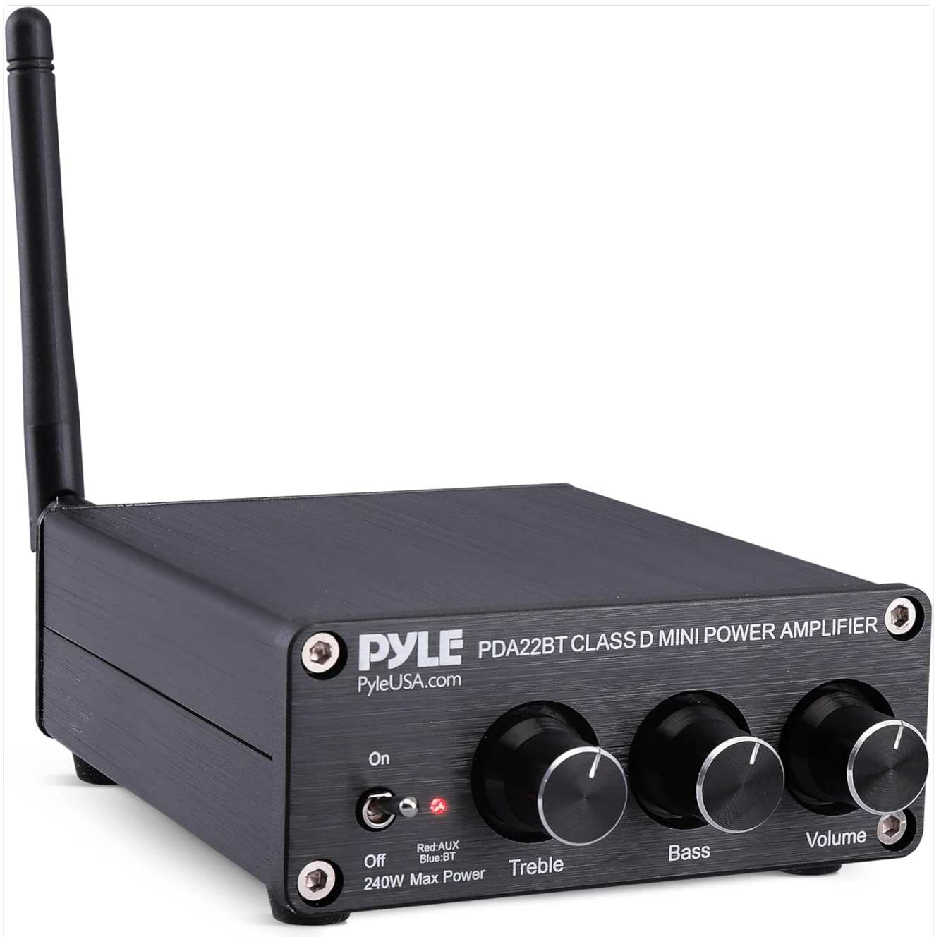
Figure 1.1: Front view of the Pyle PDA22BT Compact Home Audio Amplifier, showcasing its compact design and front panel controls.