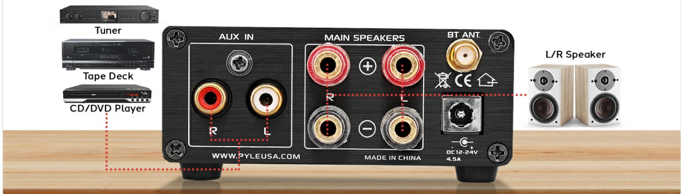
Figure 5.2: Example setup showing how to connect external audio devices like a tuner, tape deck, or CD/DVD player to the amplifier's RCA input.

With a built-in RCA (L/R) audio input, this mini receiver lets you connect a tuner, CD player, tape deck, and more.