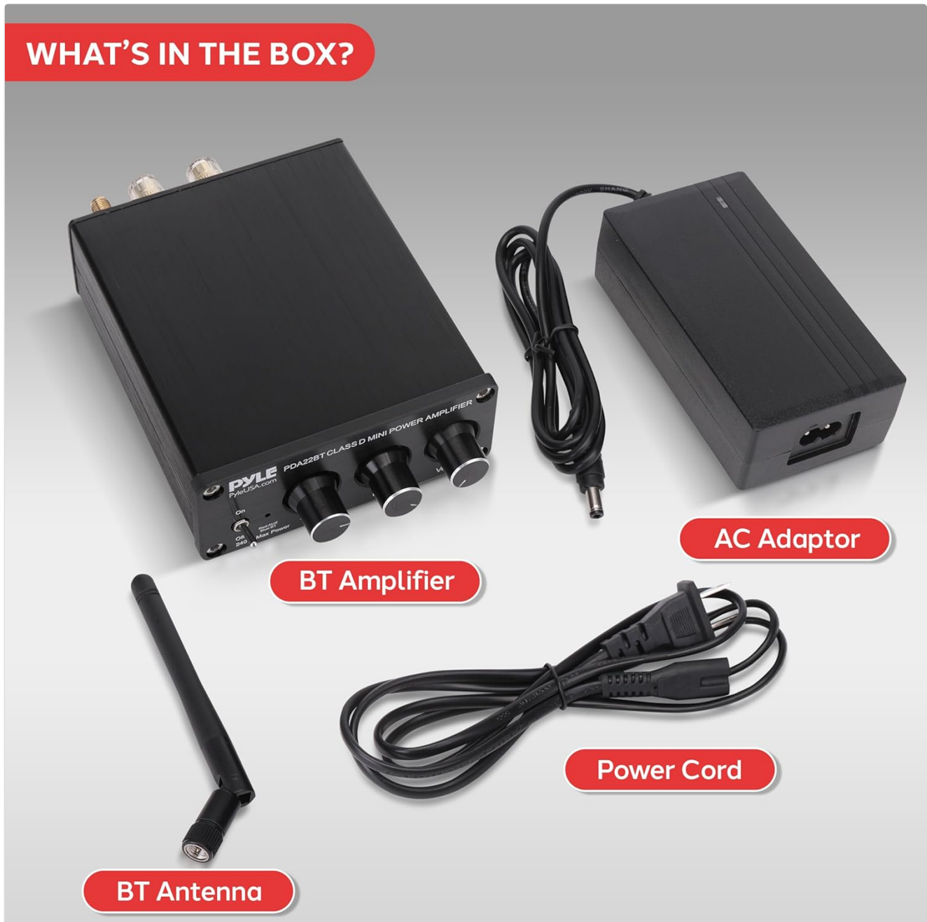
Figure 3.1: All components included in the Pyle PDA22BT amplifier package: the amplifier unit, power adapter, AC power cord, and Bluetooth antenna.