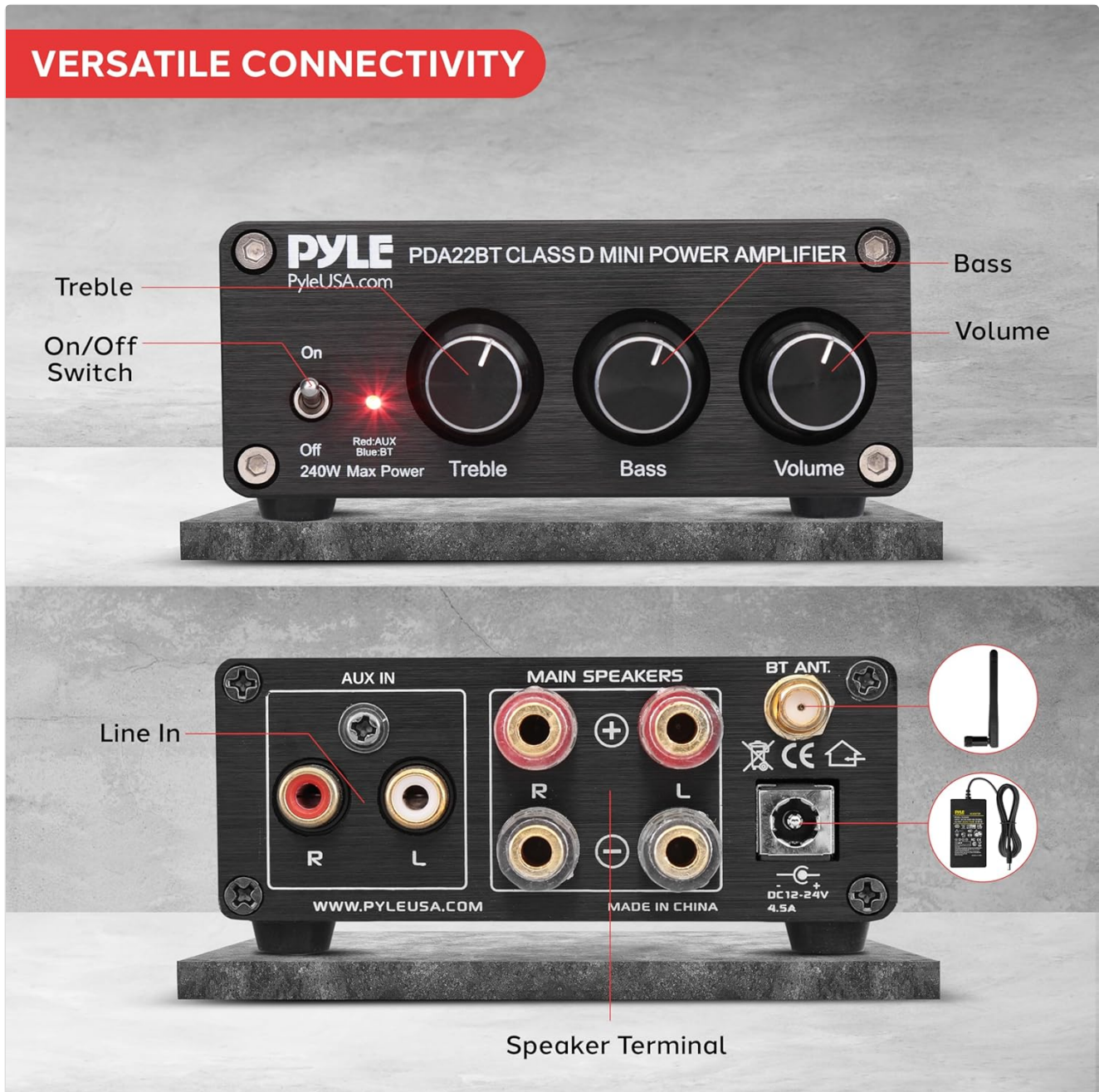
Figure 4.1: Detailed diagram showing the front panel controls and rear panel connections of the Pyle PDA22BT amplifier.