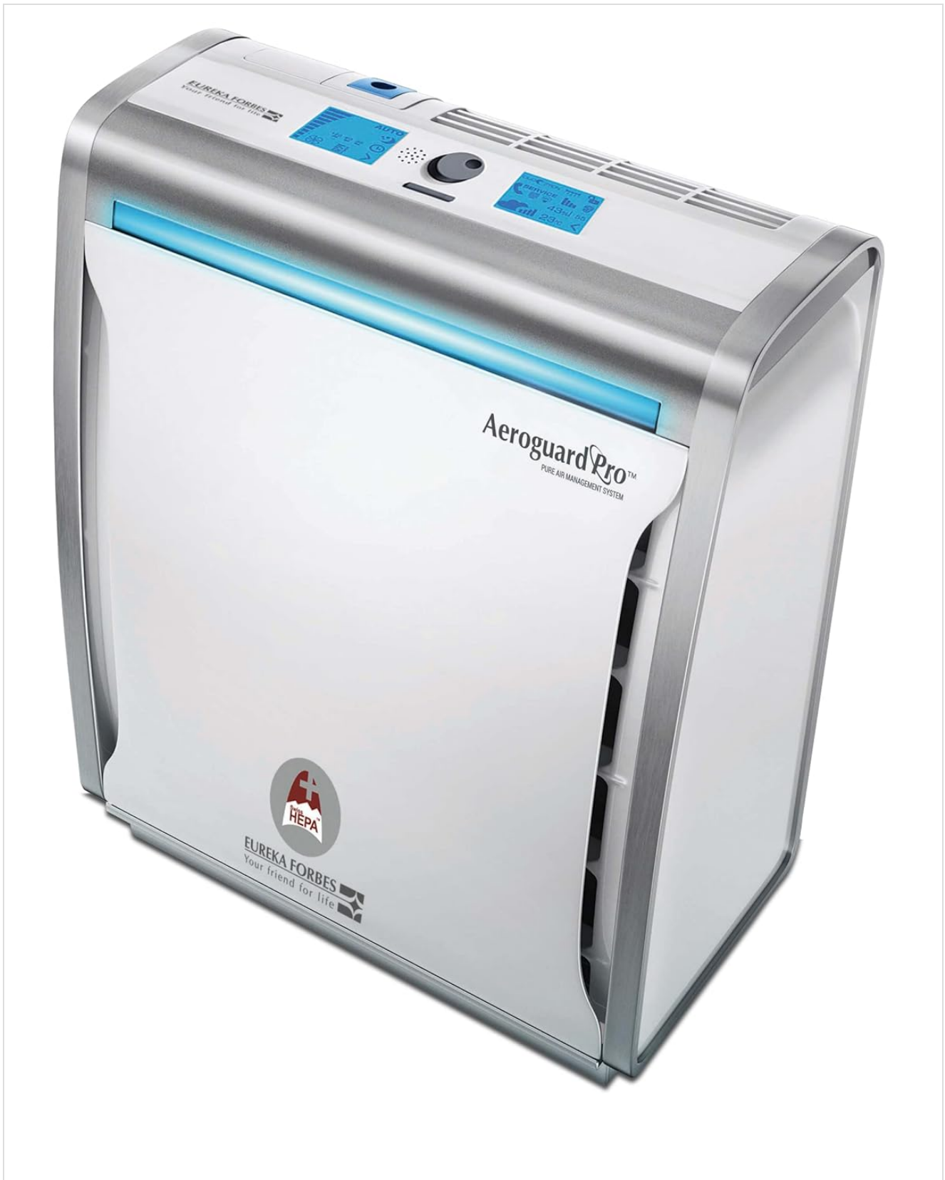
Figure 1: Eureka Forbes Aeroguard PRO 1000 Air Purifier. This image shows the sleek, white and silver design of the air purifier from an angled perspective, highlighting its control panel and air vents.