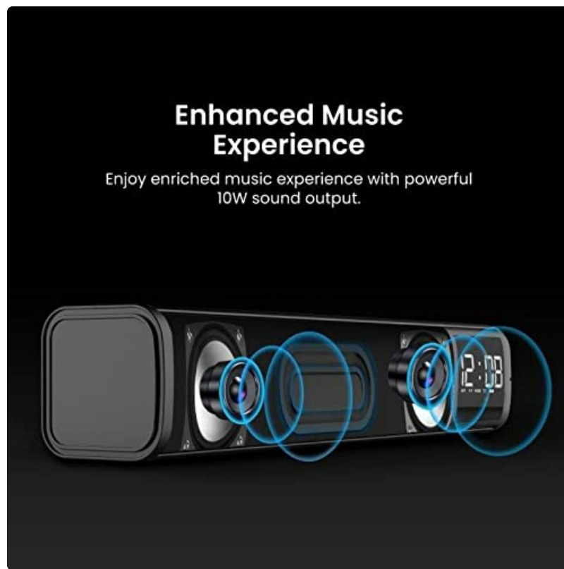
Illustration demonstrating the 10W powerful sound output from the soundbar's internal speakers.