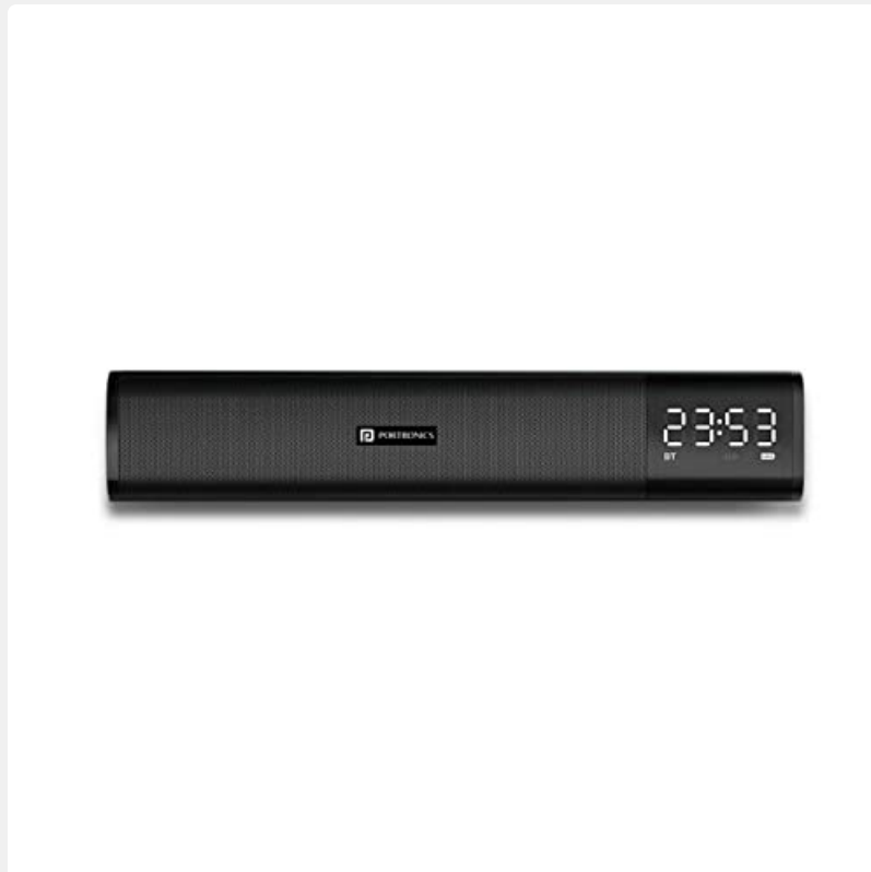
Front view of the Portronics Decibel 1 Wireless Soundbar, showcasing its sleek black design and digital display.