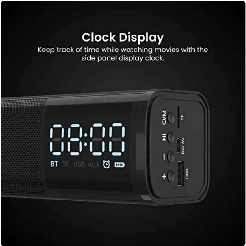
A close-up image of the soundbar's digital clock display, showing the time and battery indicator.