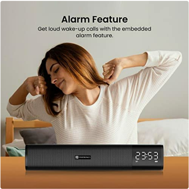
The soundbar positioned on a bedside table, illustrating its alarm feature for daily use.