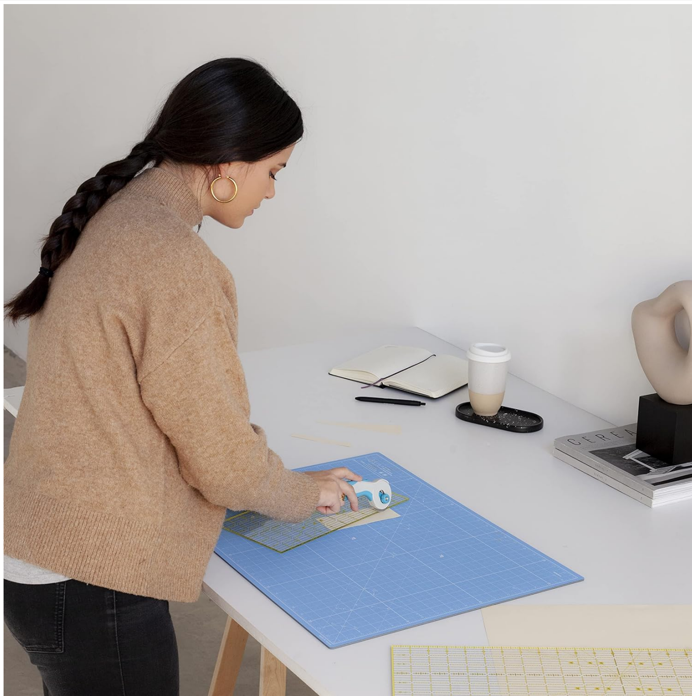
Image: A user preparing the Elan cutting mat on a workspace, demonstrating proper flat placement.

Upon receiving your Elan Cutting Mat, ensure it is laid flat on a stable, clean, and dry surface. The mat is designed to remain flat; avoid bending or rolling it, as this can affect its integrity and self-healing properties. Allow the mat to acclimate to room temperature if it has been stored in extreme conditions.