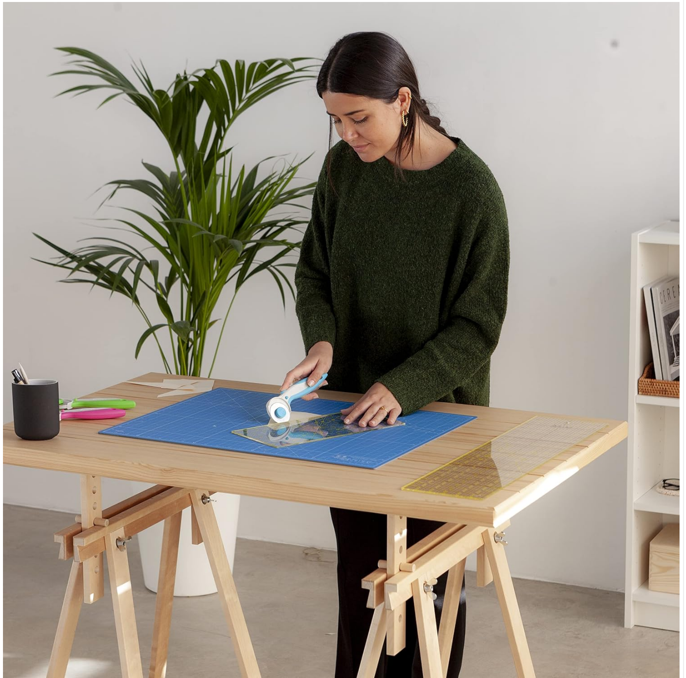
Image: A user demonstrating the use of a rotary cutter on the Elan cutting mat for precise fabric cutting.