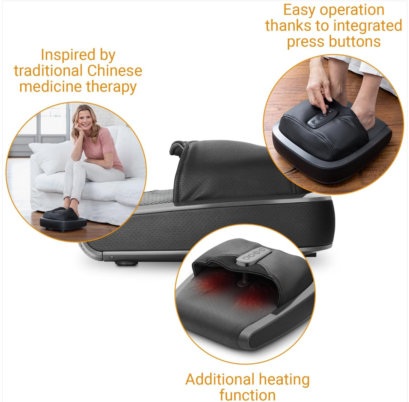
Image: Detailed view of the control panel on the Medisana FM 900, showing buttons for power, mode selection, intensity, and heat function.

The Medisana FM 900 offers various massage modes and intensity levels for a personalized experience.