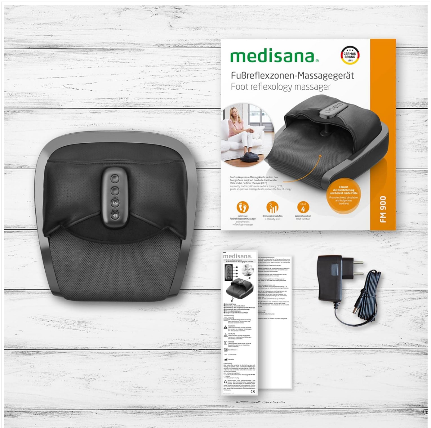
Image: The Medisana FM 900 Premium Foot Massager, its power adapter, and the user manual as found in the product packaging.

Please check that all parts are included and undamaged.