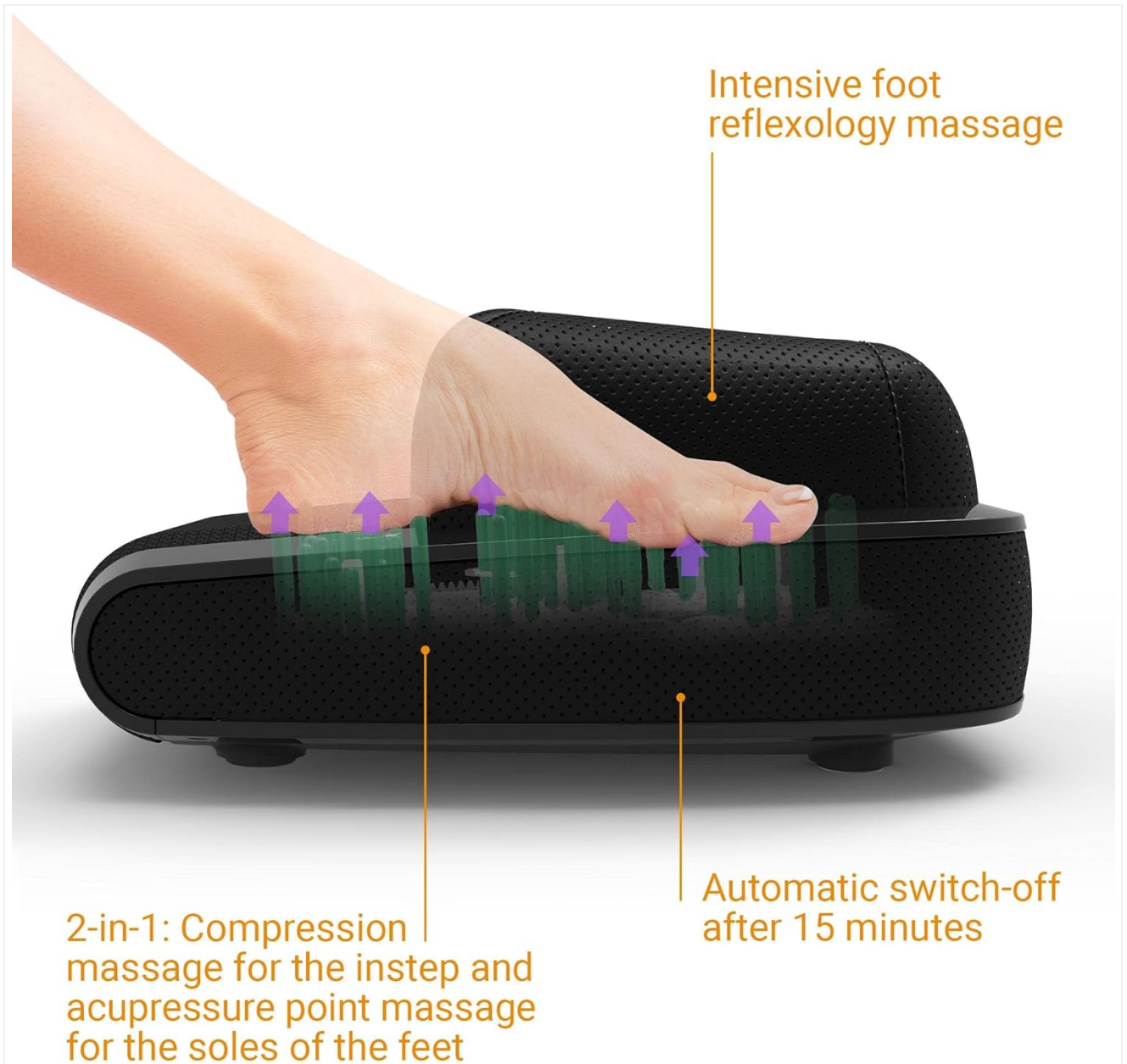
Image: A diagram illustrating the intensive foot reflexology massage, 2-in-1 compression massage for the instep, and acupressure point massage for the soles of the feet, along with the automatic switch-off feature after 15 minutes.

blood circulation and invigorate tired feet.