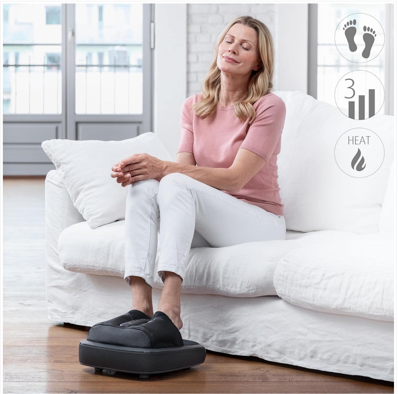
Image: A user enjoying a relaxing foot massage with the Medisana FM 900, highlighting the device's comfort and ease of use.