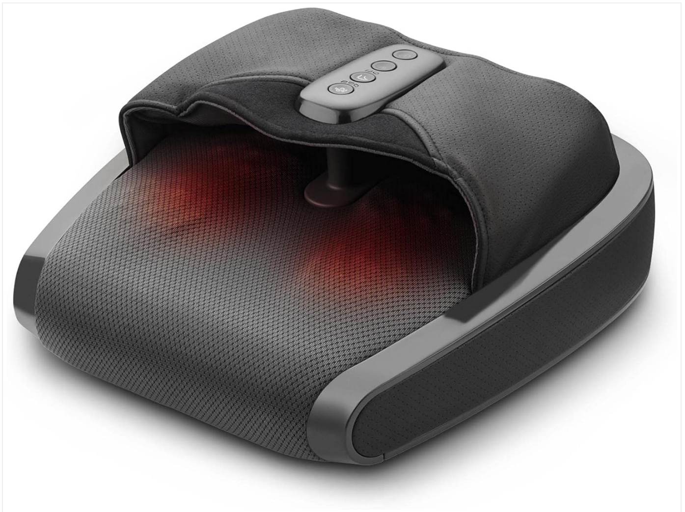
Image: The Medisana FM 900 Premium Foot Massager, showcasing its sleek design and control panel.

The Medisana FM 900 Premium Foot Massager is designed to provide a relaxing and invigorating massage experience for your feet. It features a heating function, two speeds, 2-in-1 compression, and acupressure points for foot reflexology, aiming to relieve tired and sore feet.