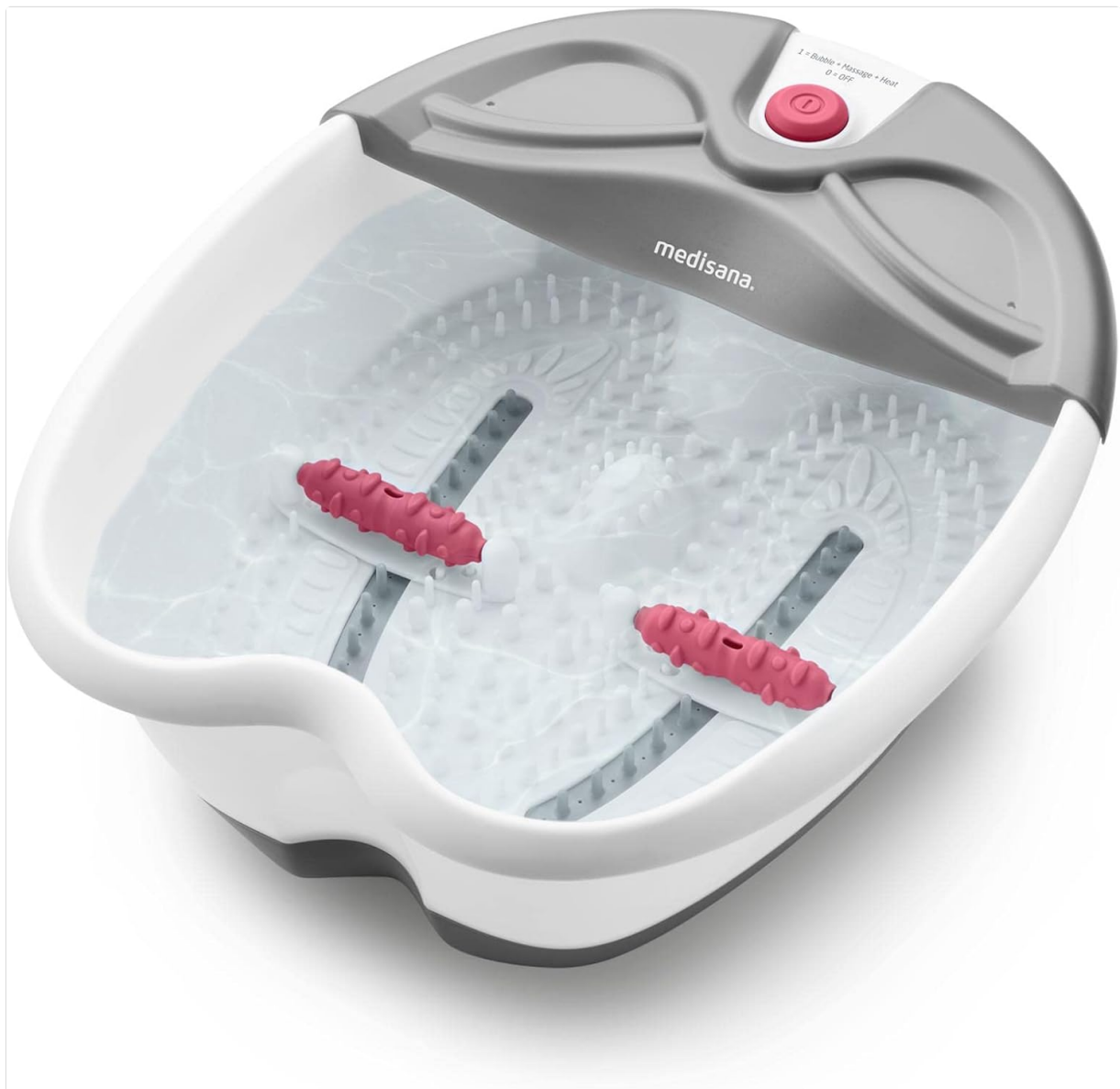
Figure 1: MEDISANA FS 300 Foot Spa, top-down view with water and massage rollers.

The MEDISANA FS 300 Foot Spa is designed for ease of use and effective foot relaxation. It features a robust housing, integrated massage rollers, and a simple control panel.