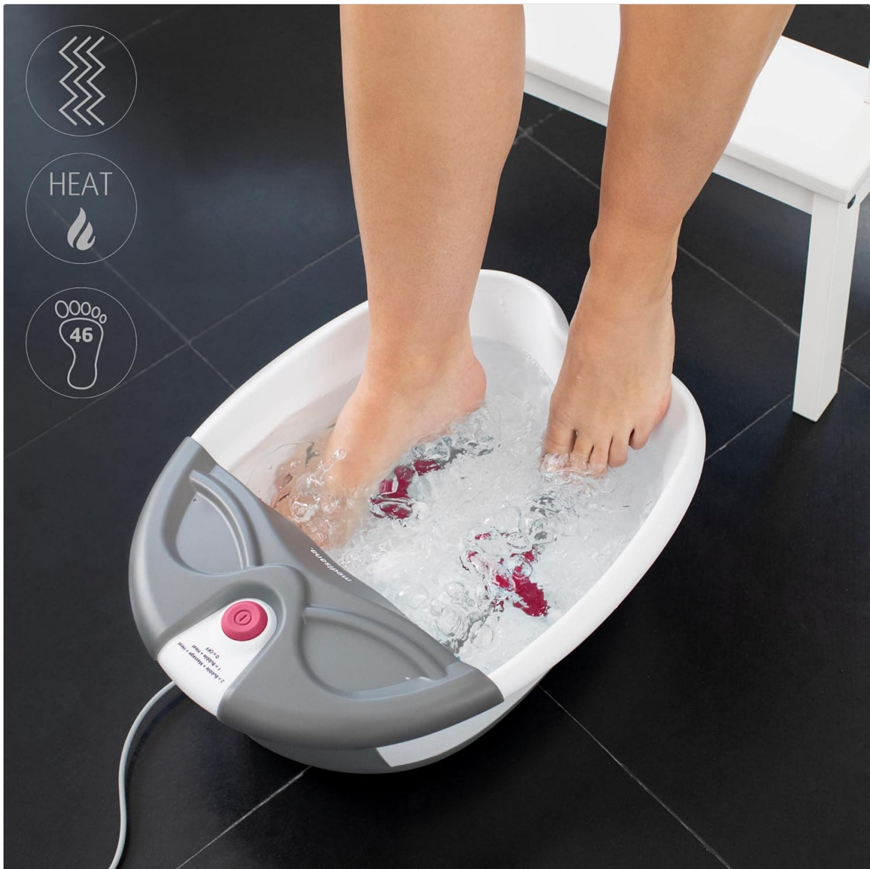
Figure 4: User enjoying the foot spa with feet immersed.