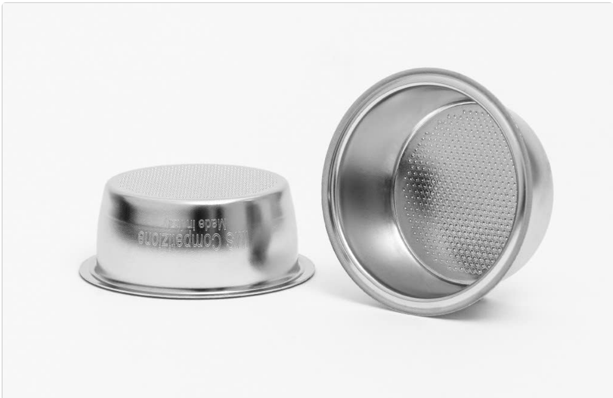
Figure 1: IMS Precision 16-18g Filter Basket (DL2TH26E)

This manual provides comprehensive instructions for the proper use and maintenance of your verybarista IMS Precision 16-18g Filter Basket (DL2TH26E). Designed for optimal espresso extraction, this high-quality stainless steel basket is compatible with various 51mm group head portafilters, including Delonghi, Sage, and Breville models. Adhering to these guidelines will ensure consistent performance and longevity of your filter basket.