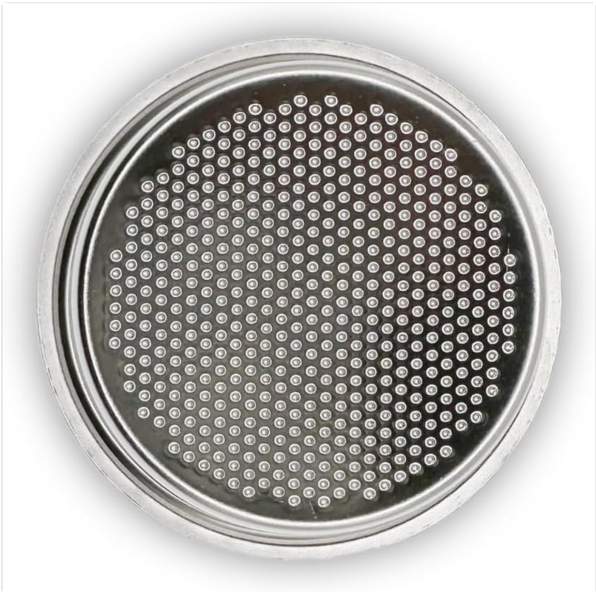
Figure 3: Bottom view of the IMS Precision Filter Basket, highlighting the precision holes.