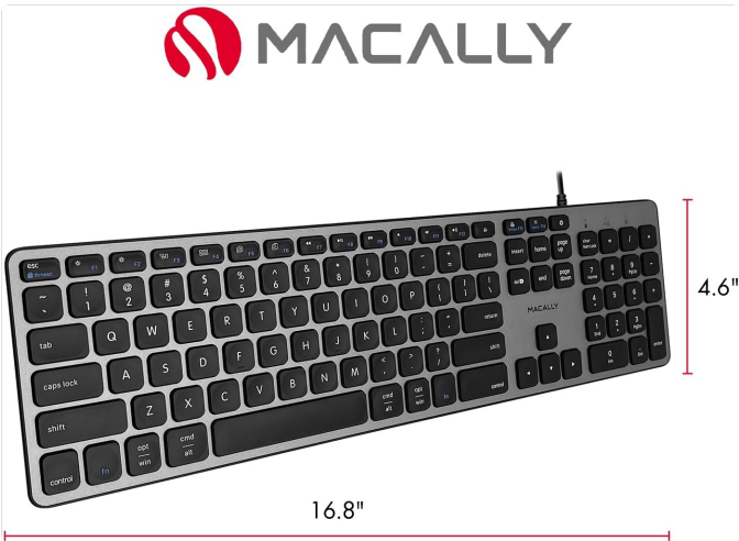
Image: An overhead view of the keyboard with measurements indicating its length (16.8 inches) and width (4.6 inches).