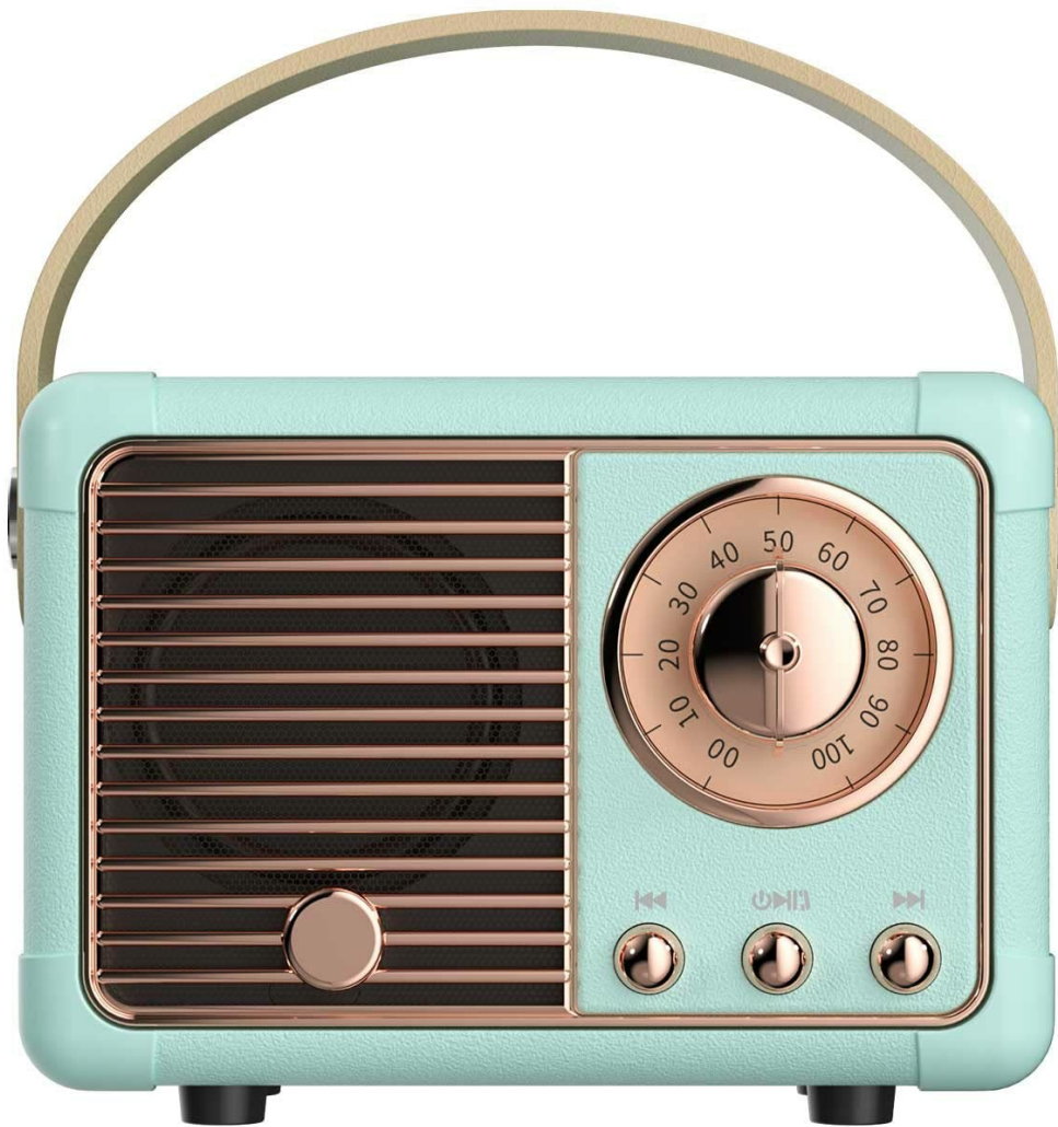
Figure 1: Front view of the Dosmix HM11 Retro Bluetooth Speaker.