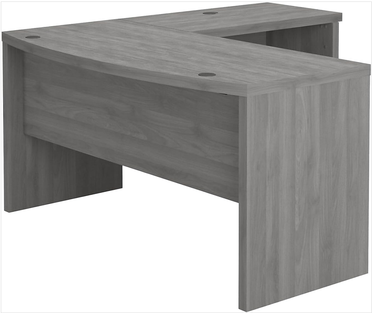
Image: A top-down view of the fully assembled Bush Business Furniture Echo L Shaped Bow Front Office Desk, showcasing its L-shape and bow front design in Modern Gray.