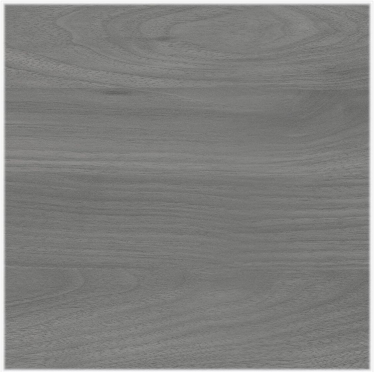
Image: A detailed close-up of the Modern Gray finish on the desk surface, showing the wood grain texture.