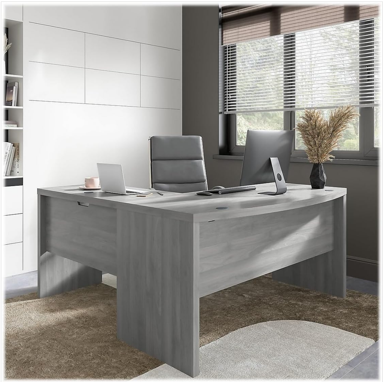
Image: The Bush Business Furniture Echo L Shaped Bow Front Office Desk in a modern gray finish, set up in an office environment with a computer and chair.