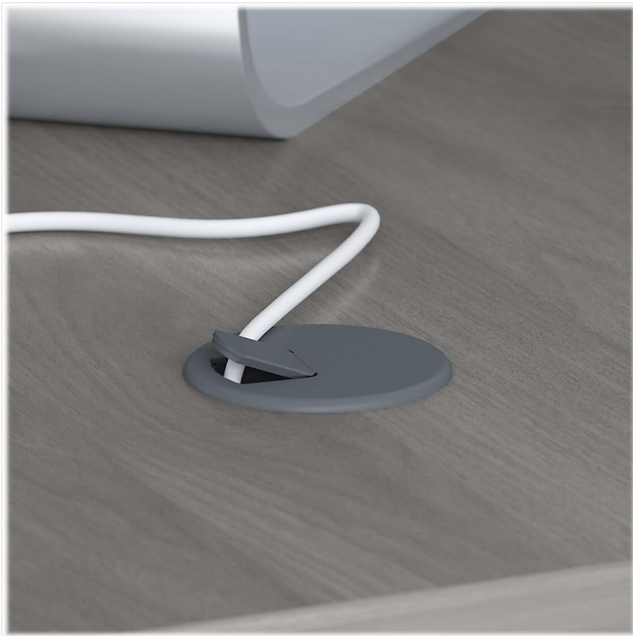
Image: A close-up view of a gray wire management grommet on the desk surface, with a white cable passing through it, demonstrating its function for cable organization.