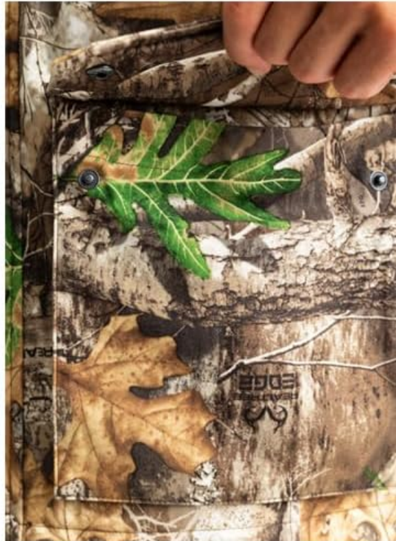
Close-up images detailing the zippered chest pocket, snap-closure bellow pockets, and the main zipper of the jacket.