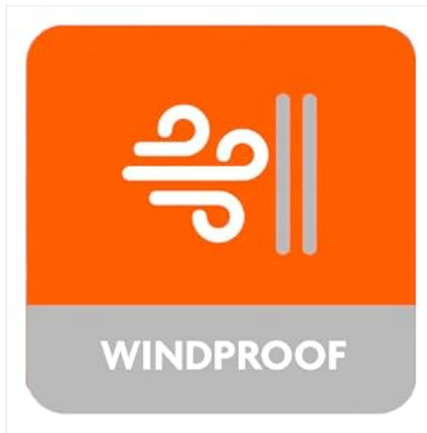
Logo indicating windproof feature.