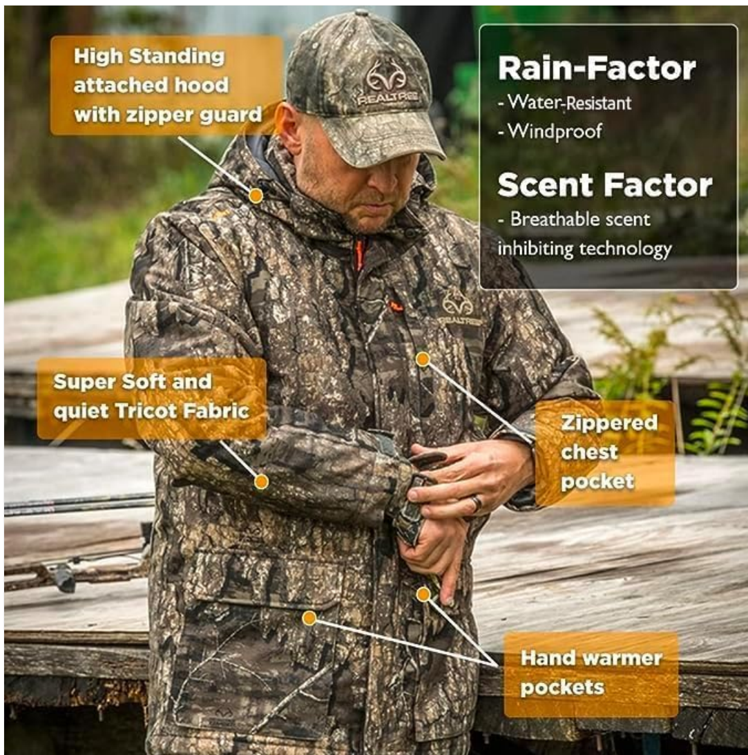
Diagram highlighting key features of the jacket, including the high-standing hood, soft tricot fabric, zippered chest pocket, and hand warmer pockets. Also notes Rain-Factor water-resistant and windproof technology, and Scent Factor breathable scent inhibiting technology.