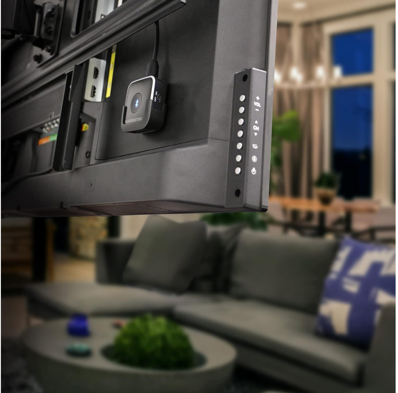
Image: The Bluetooth transmitter mounted on the back of a television, connected via an audio cable.