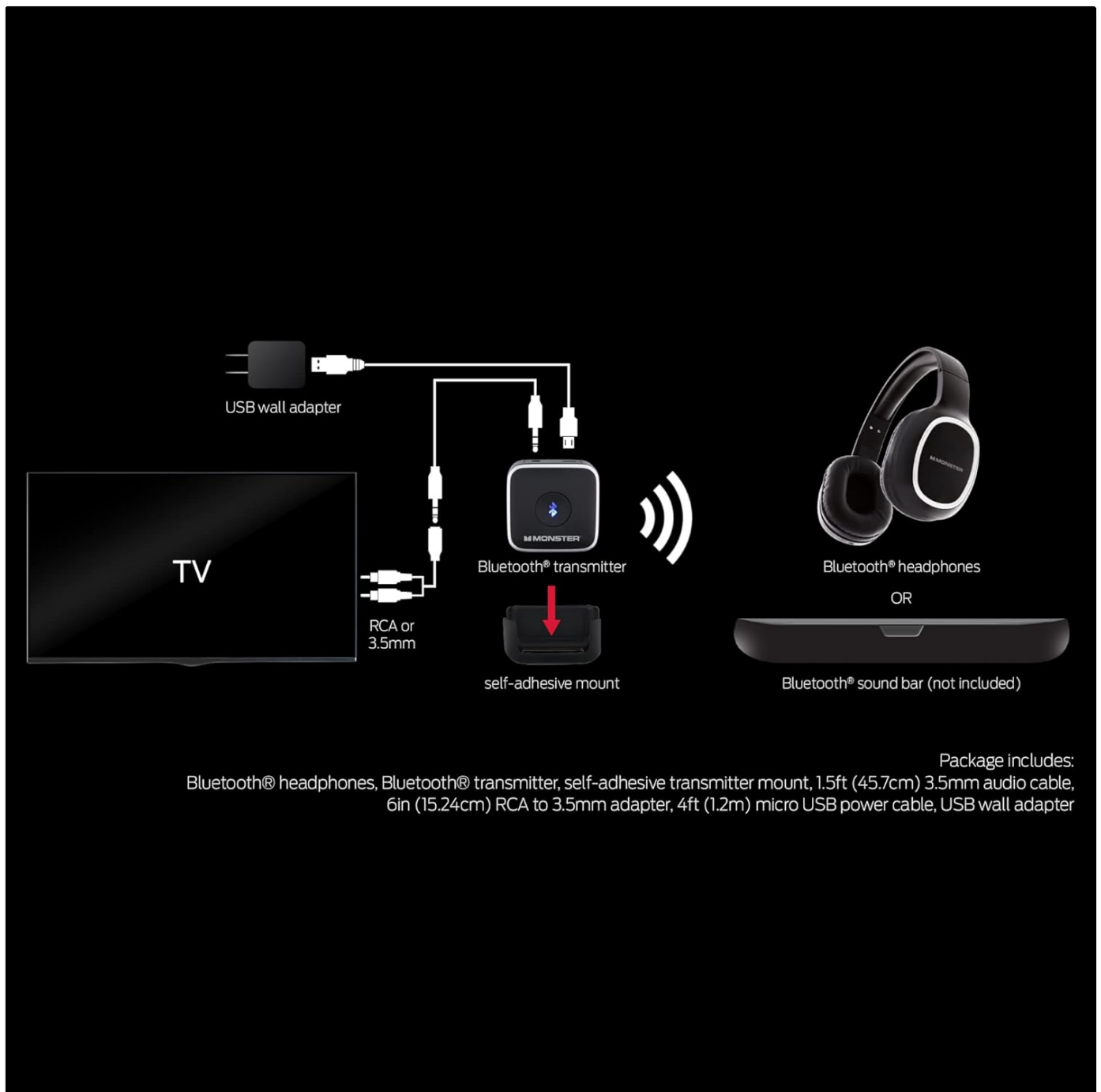
Image: Diagram illustrating the package contents and how to connect the transmitter to a TV and headphones.