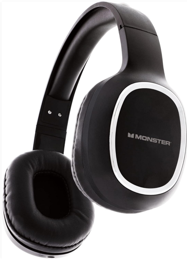
Image: Close-up view of the XTREME Monster over-ear Bluetooth headphones.