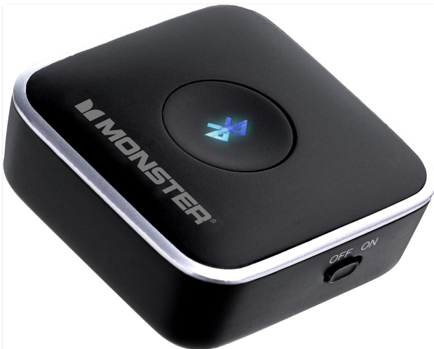
Image: Top view of the XTREME Monster Bluetooth audio transmitter.