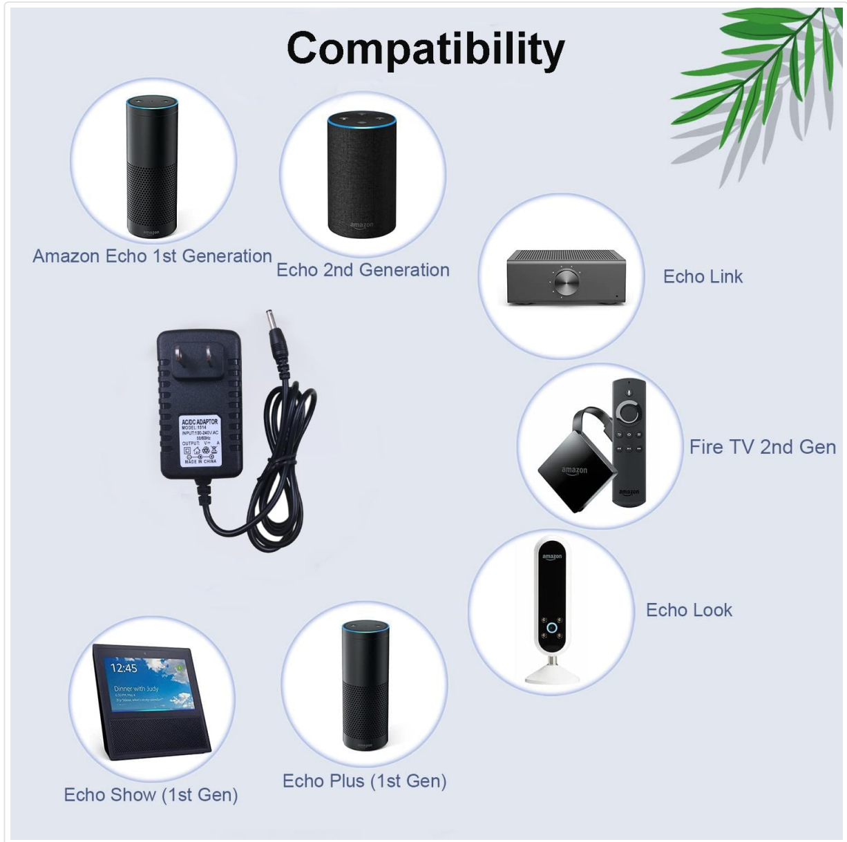
Image 2.1: Visual guide illustrating compatible Amazon Echo devices with the PDEEY 21W Power Adapter.