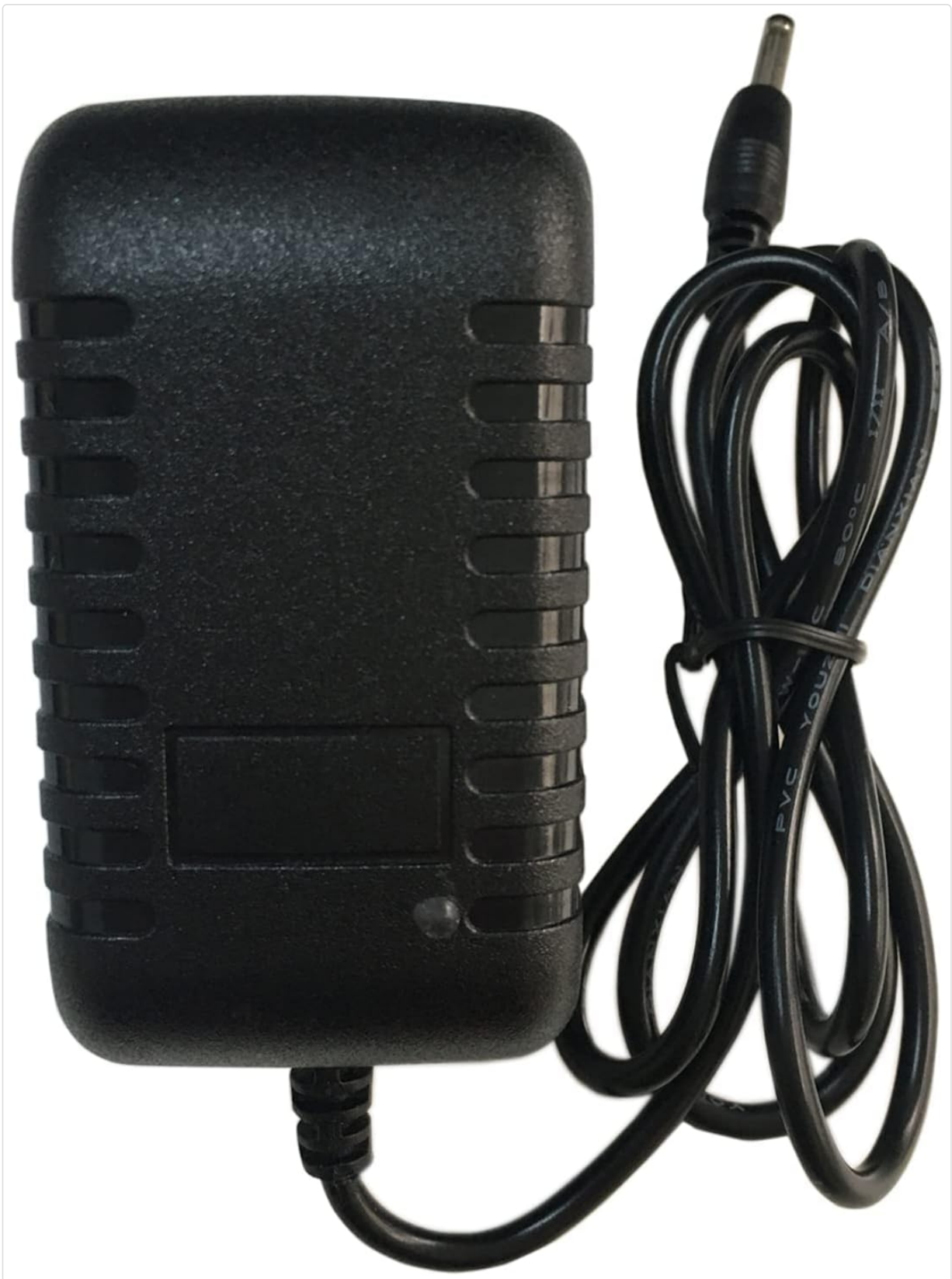
Image 1.2: Side view of the PDEEY 21W Power Adapter, showing the plug and barrel connector.