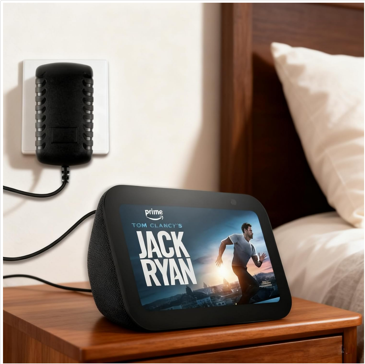
Image 4.1: An Amazon Echo Show device connected to the power adapter and plugged into a wall outlet.