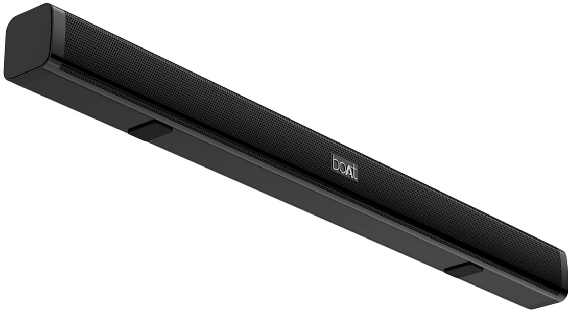
Image: The boAt Aavante Bar 900 soundbar, a sleek black unit with integrated controls on the side.