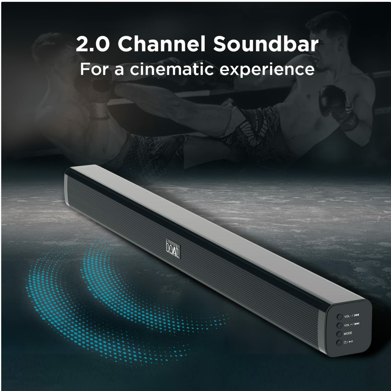
Image: A close-up of the integrated control panel on the side of the boAt Aavante Bar 900, showing buttons for volume, mode, and power/play-pause.