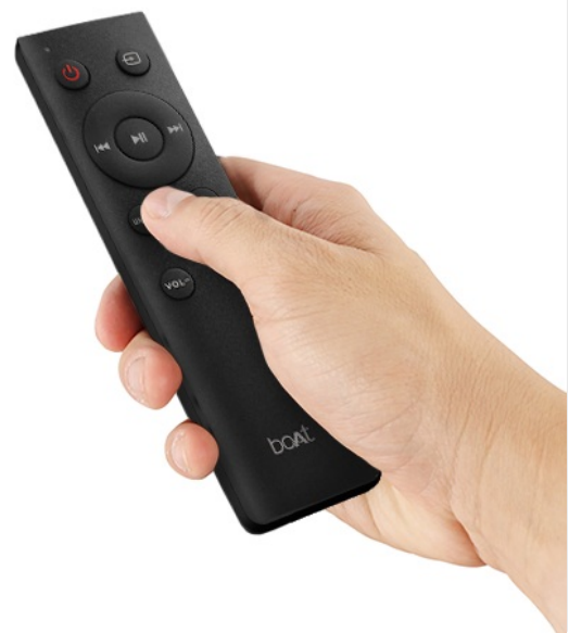
Image: A close-up of the boAt Aavante Bar 900 showcasing its sleek finish and the integrated control panel on the side, alongside the remote control.