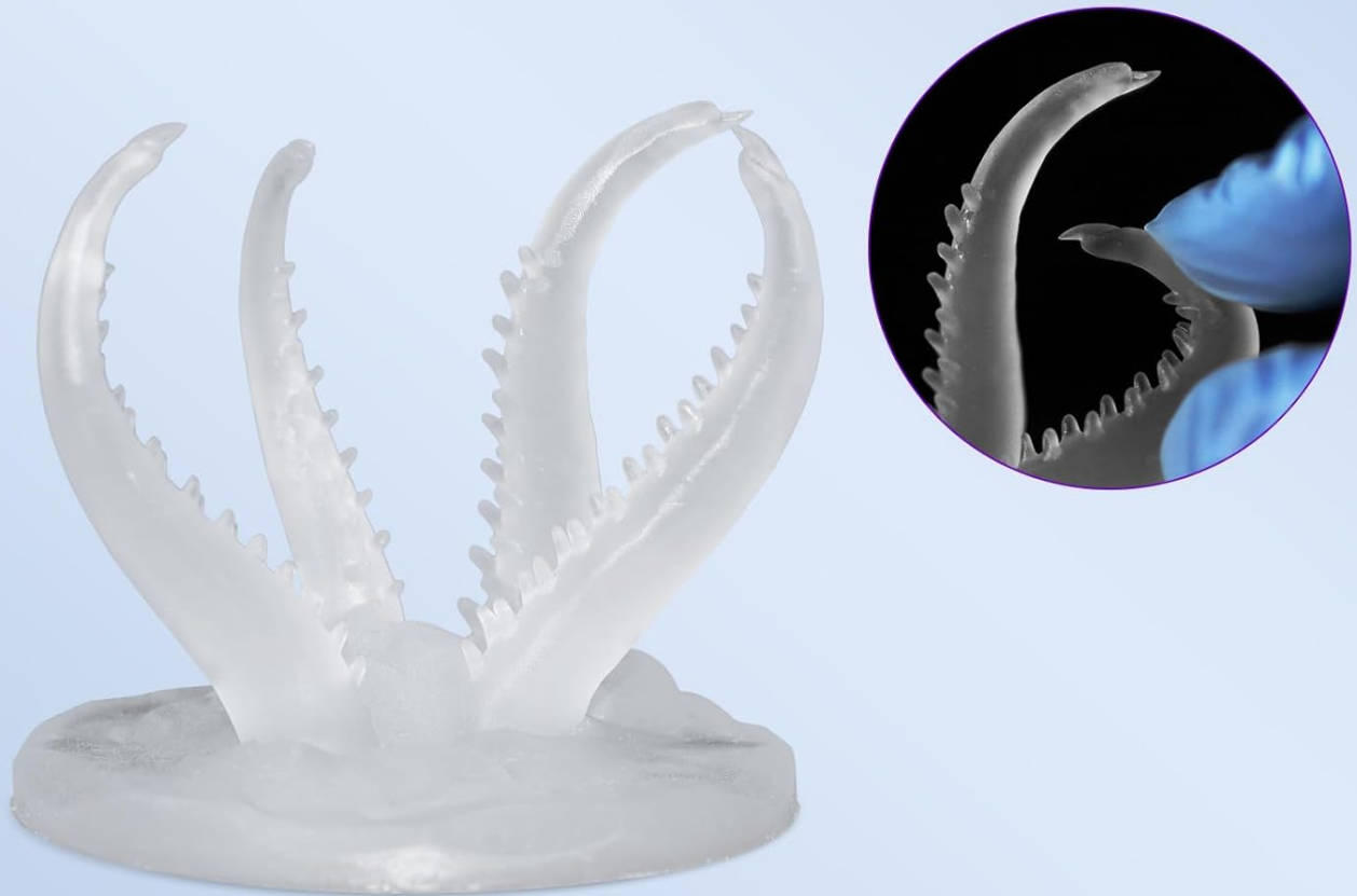
A transparent 3D printed model undergoing the curing process.

細部がはっきりしていて、RESIONEは処方に対して専門的な設計を行い、フレキシブルレジン部品が印刷中に変形しやすい欠点を効果的に回避し、印刷の成功を確保した