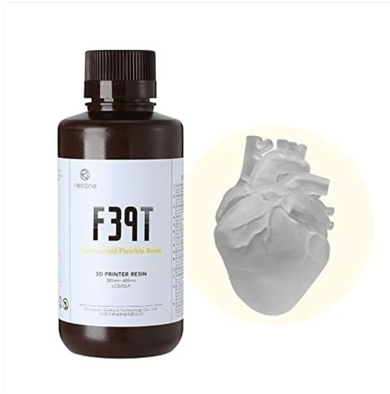
RESIONE F39T Flexible Resin bottle and a transparent flexible 3D printed heart model, demonstrating its rubber-like properties.