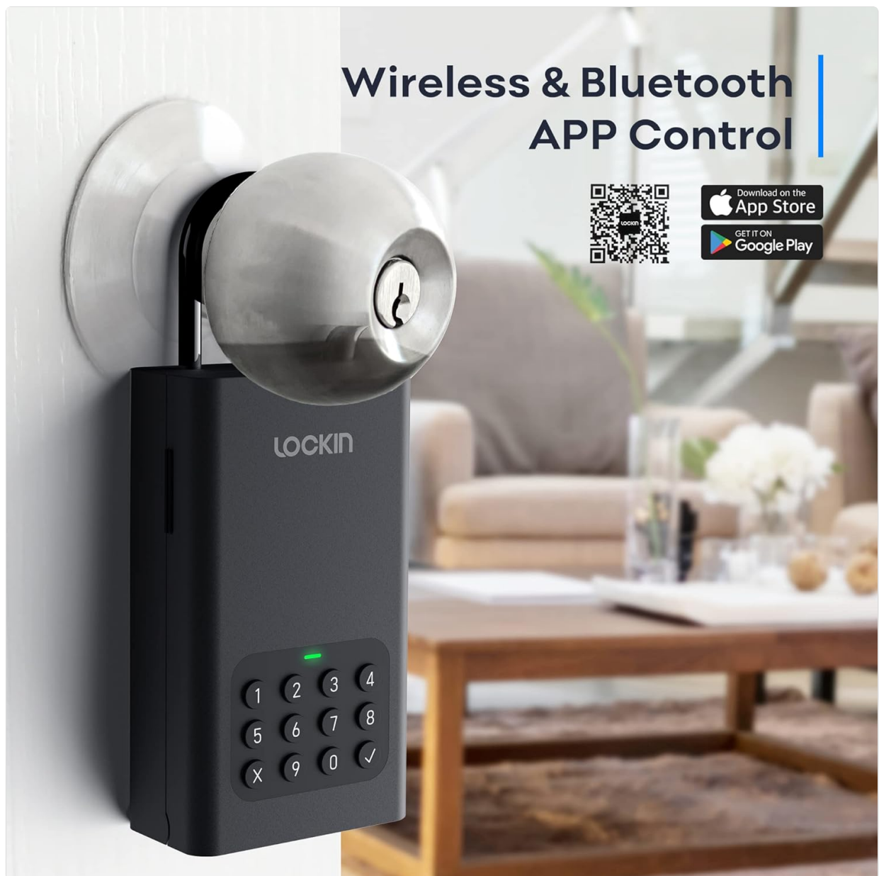
Image: The Lockin Smart Lock Box L1 next to a smartphone displaying the Lockin Home app interface, showing the app download options.

Important: Only one account can be attached to the lockbox at a time. If you need to transfer ownership or reset, remove the device from your current account in the app.