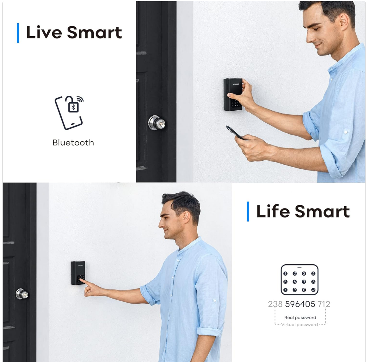
Image: The Lockin Smart Lock Box L1 securely mounted on a wall.

Use the provided anchoring screws and wall anchors to securely mount the lock box to a suitable outdoor wall. Ensure the surface is stable and can support the device.