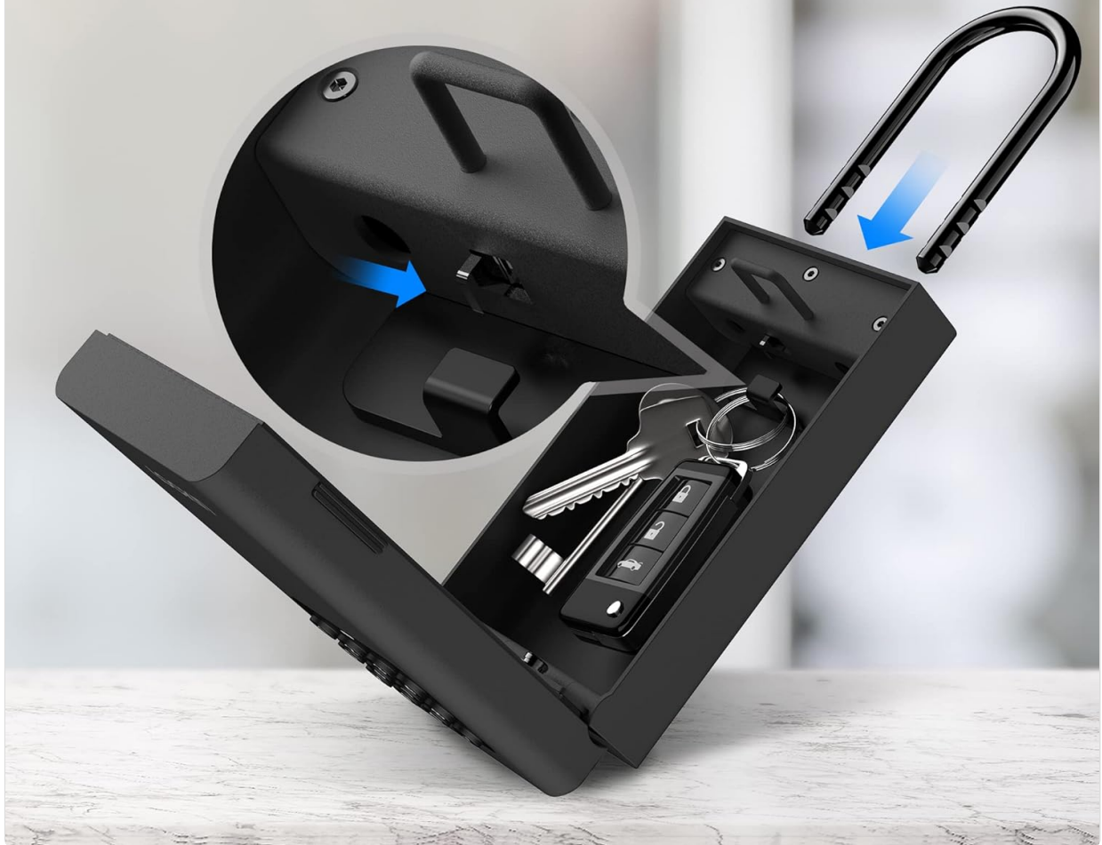
Image: The Lockin Smart Lock Box L1 hanging from a door knob using its removable shackle.