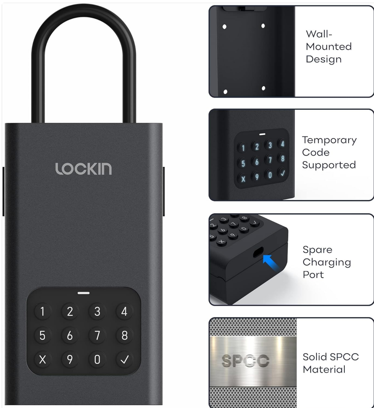
Image: Close-up of the Lockin Smart Lock Box L1 showing the USB-C port for emergency charging.

Your browser does not support the video tag.