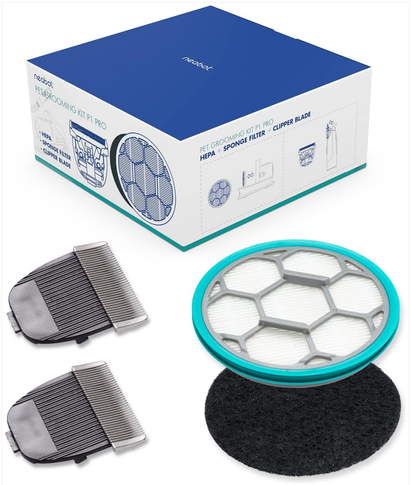
Figure 2.1: Contents of the neabot P1 Pro Replacement Parts package.